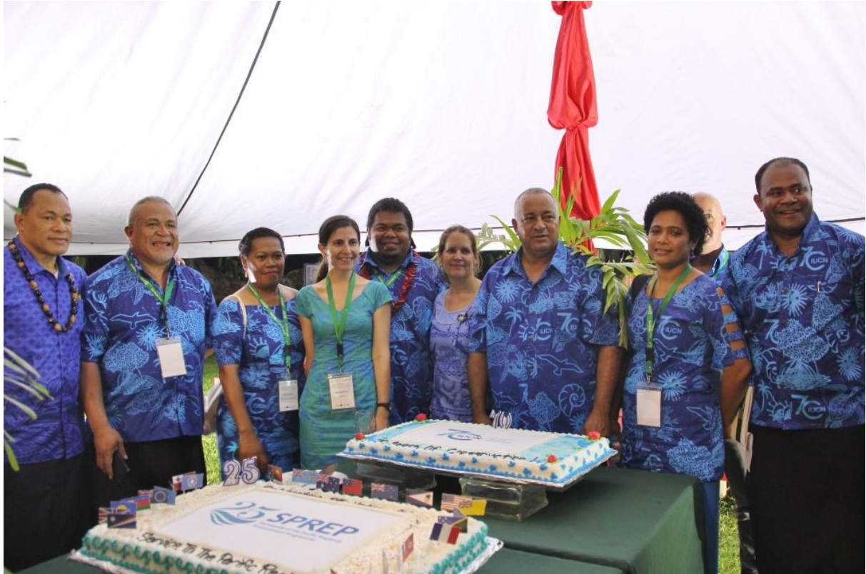
At the BIOPAMA II Inception Meeting in Samoa in June colleagues from IUCN Oceania Office and SPREP celebrate dual anniversaries - 25 years for SPREP and 70 years for IUCN