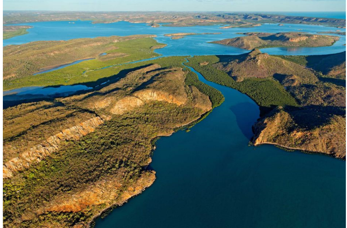
Yampi Sound Military Training Base in the Kimberley may well be an 'OECM' – do you know what that means? – You should!