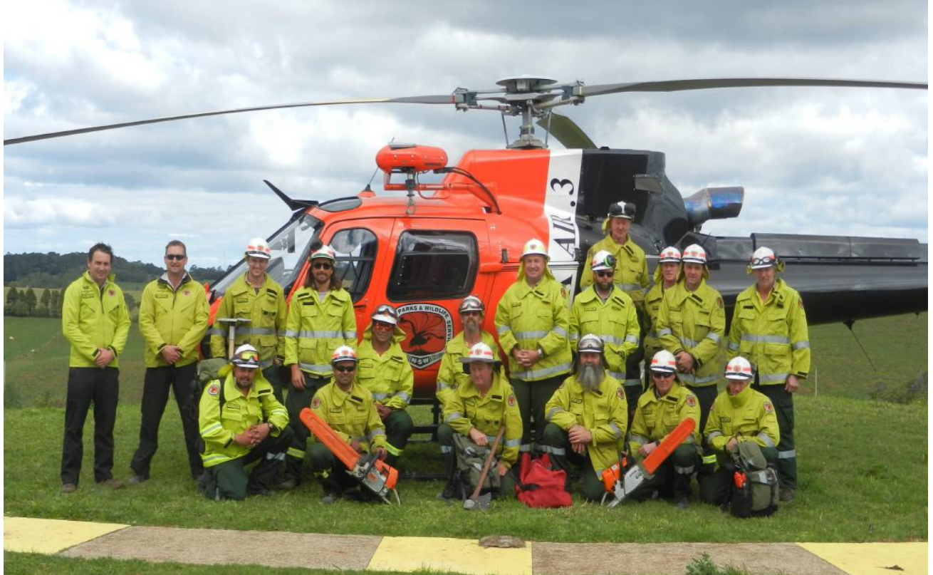
WCPA pays tribute to the National Parks fire fighters in the front line defending our parks, their natural systems, species, heritage and human life.

THE IUCN WORLD COMMISSION ON PROTECTED AREAS OCEANIA Newsletter No. 1 2019