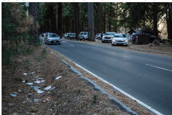
Yosemite National Park

National parks in the US are suffering as the ongoing government shutdown has left areas open to visitors with few staff on duty. Overflowing garbage, sewerage and illegal off-road driving in fragile areas are overwhelming some of the iconic national parks with concerns raised that natural resources and cultural and historic artefacts could be damaged.