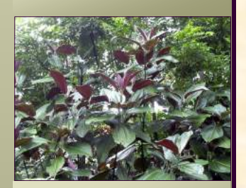
Miconia is a fast growing closed forest tree that rapidly transforms forests into almost pure stands to the exclusion of native species