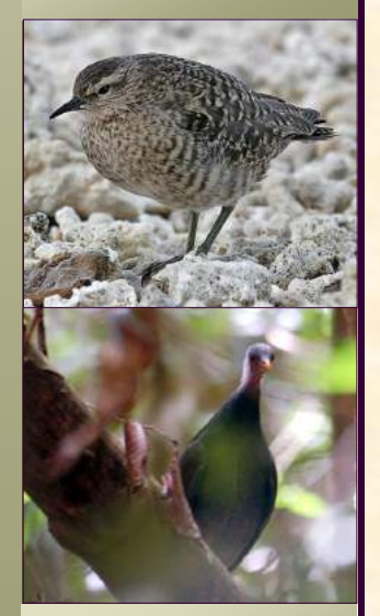
The survival of the Tuamotu Sandpiper (top) and the Polynesian Megapode (bottom) are both threatened by rats.