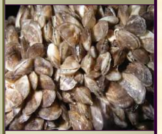
Black Striped Mussels can smother entire harbors, eliminating all other ocean life.