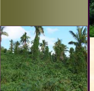
Merrimia peltata is a damaging weed on many Pacific islands