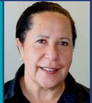
Pacific Ocean Commissioner Dame Meg Taylor

“A secure future for Pacific Island Countries and Territories based on the sustainable development, management and conservation of our ocean”