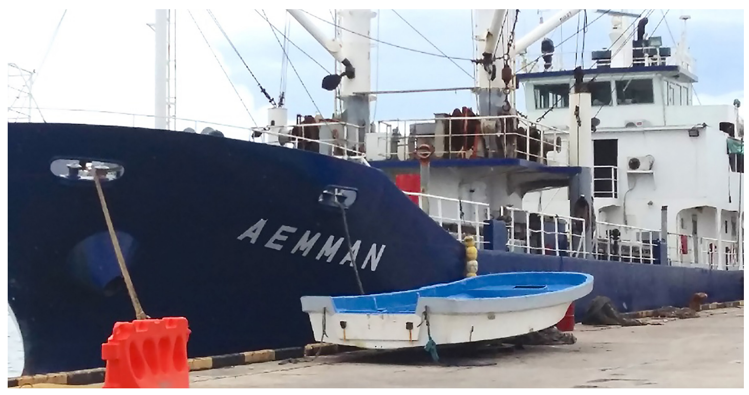
The MV Aemman moored in Majuro

For the small craft, the current practice of using gasoline fuelled outboard engines results in high expenditures and large greenhouse gases emissions for the relatively small size of tasks undertaken. There is a wide range of alternative low carbon solutions that can be deployed and current thinking is toward combining new technologies and traditional solutions, bringing together safety, efficiency and low maintenance advantages. Considering that up to 500 gasoline powered maritime craft may need to be modified or replaced, mass production of new craft should also be considered. Capital cost might appear a barrier, but this will be partially offset by long-term fuel savings. Some of the small craft improvement options may include clever integration of photovoltaic cells and electric outboards, small Flettners, hydrofoils, bio fuel outboards as well as traditional sail systems.