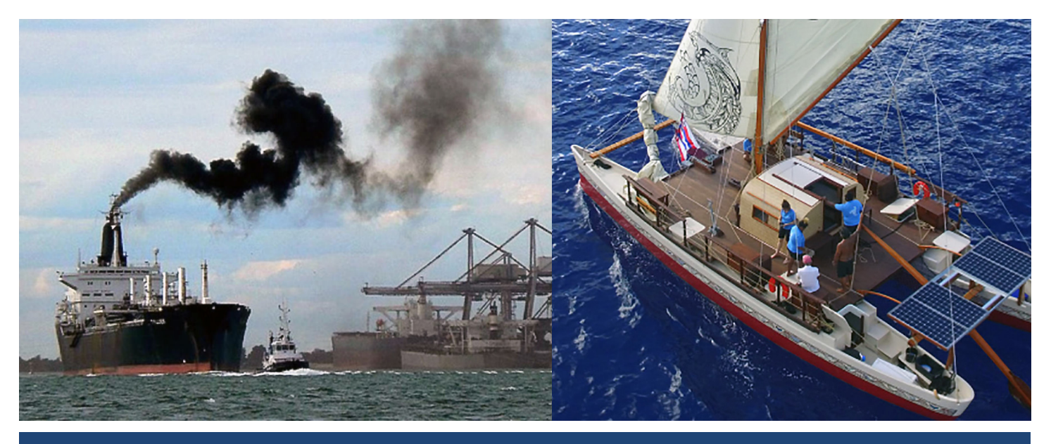
This paper, which focuses on the Republic of the Marshall Islands (RMI), is part of a series of technical assistance initiatives that the PRIF Transport Sector Working Group is conducting to improve maritime transport in Pacific island countries.