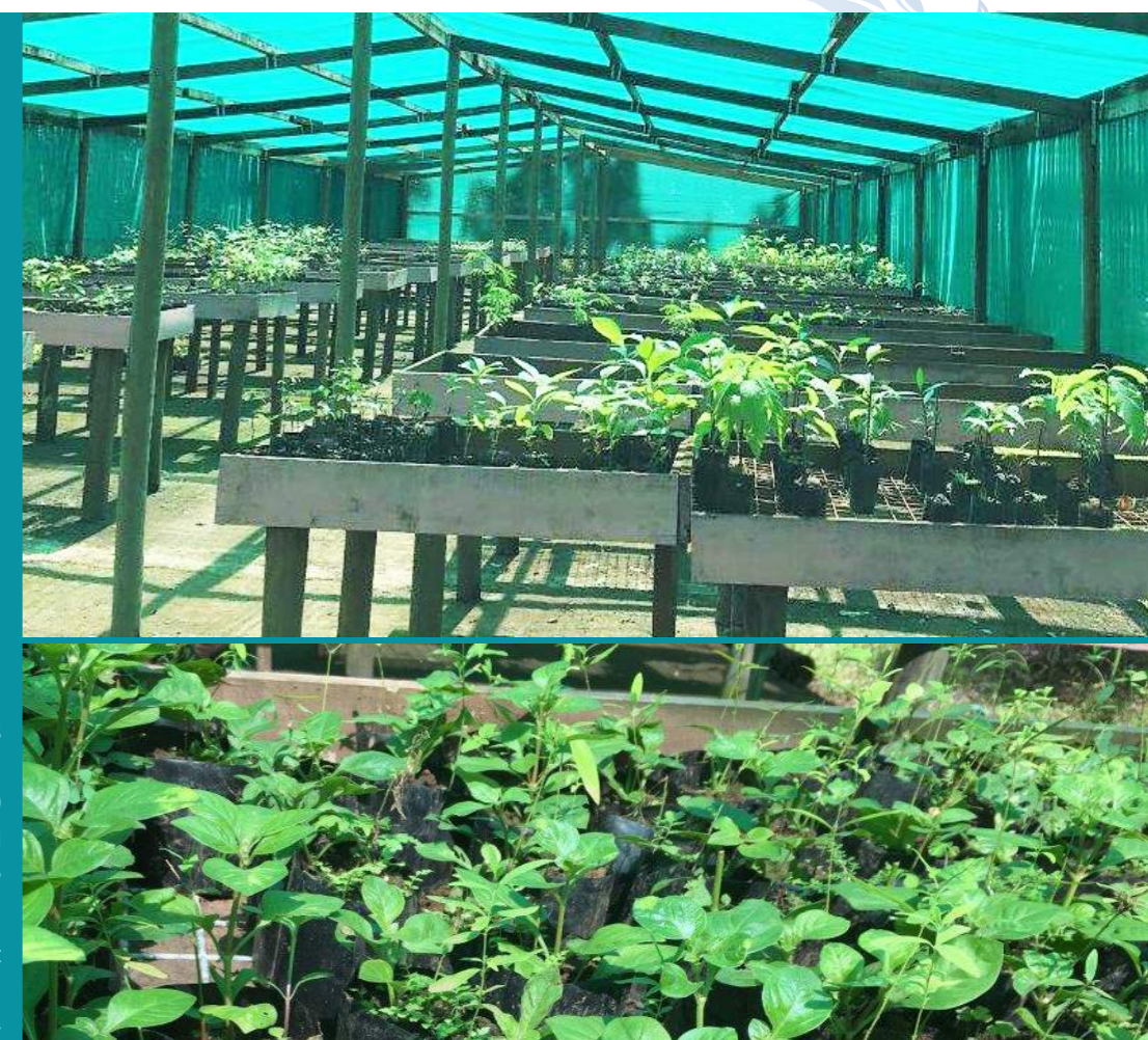
KOROTARI NURSERY, MACTUATA PROVINCE, FIJI

“With the upgrade, the nursery now has a total of 28 bays that can cater for a stock of 11,200 seedlings on the bays and 20,000 seedlings on the floor and