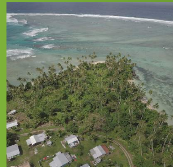
TAVEUNI ISLAND, FIJI.

re-establishment of native forest, agroforestry, plantation use, increasing agricultural diversity, ecotourism opportunities, coastal protection, aquaculture, and support for marine protected areas.