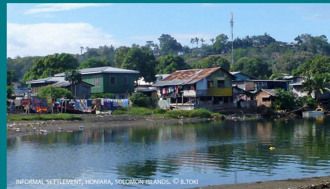
INFORMAL SETTLEMENT, HONIARA, SOLOMON ISLANDS.

activities such as creation of urban green space such as parks to cater for increasing air surface temperature due to climate change that is further exacerbated by urban concrete infrastructure.