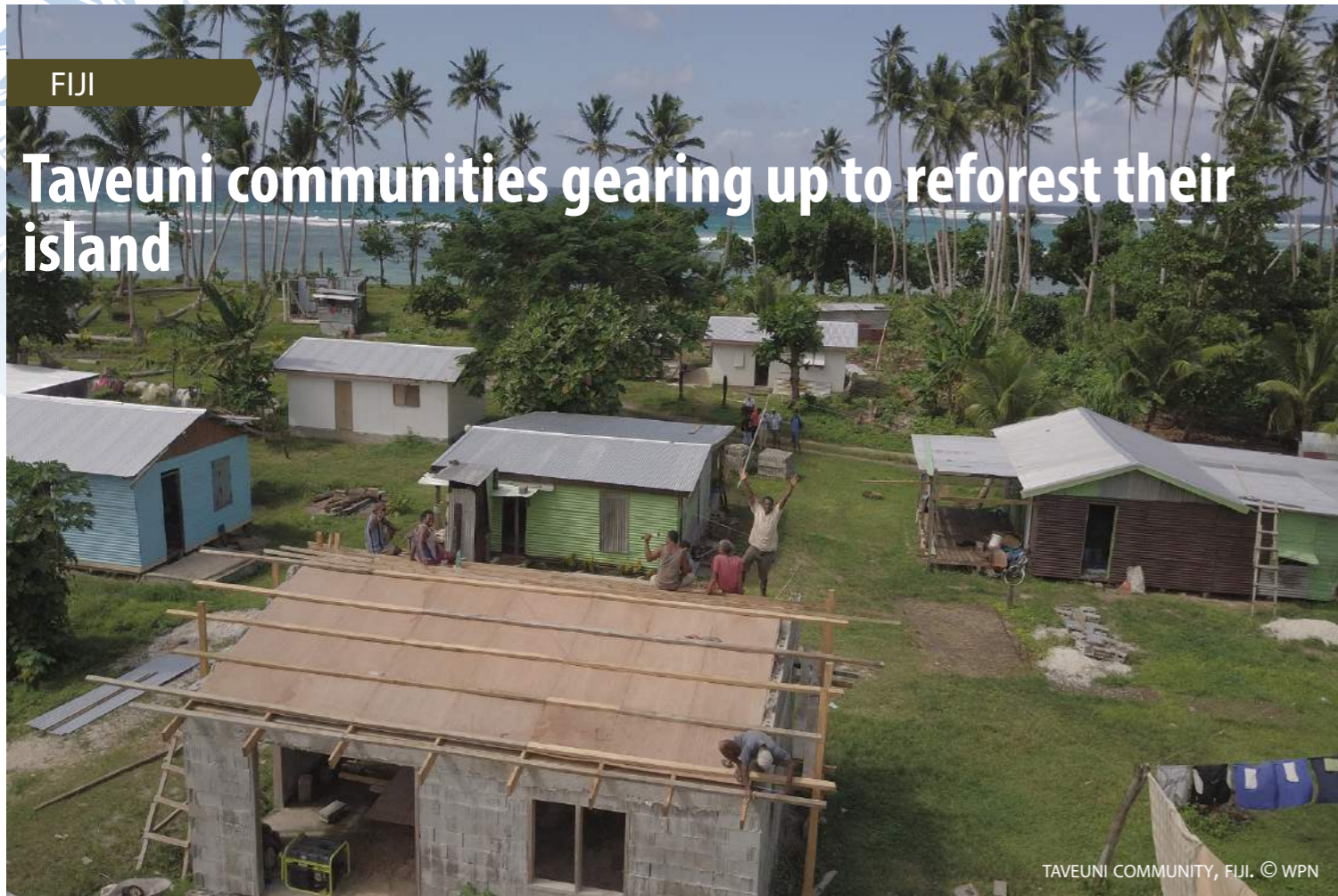
TAVEUNI COMMUNITY, FIJI.

Communities in Taveuni have a common interest in 2017 to work together to reforest degraded former forest land.