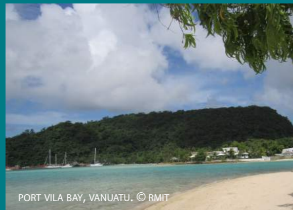
PORT VILA BAY, VANUATU.

The results are being incorporated into the ESRAM for Port Vila as they provide a useful