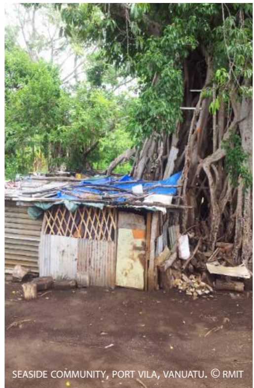
SEASIDE COMMUNITY, PORT VILA, VANUATU.

Discussions are underway to integrate the