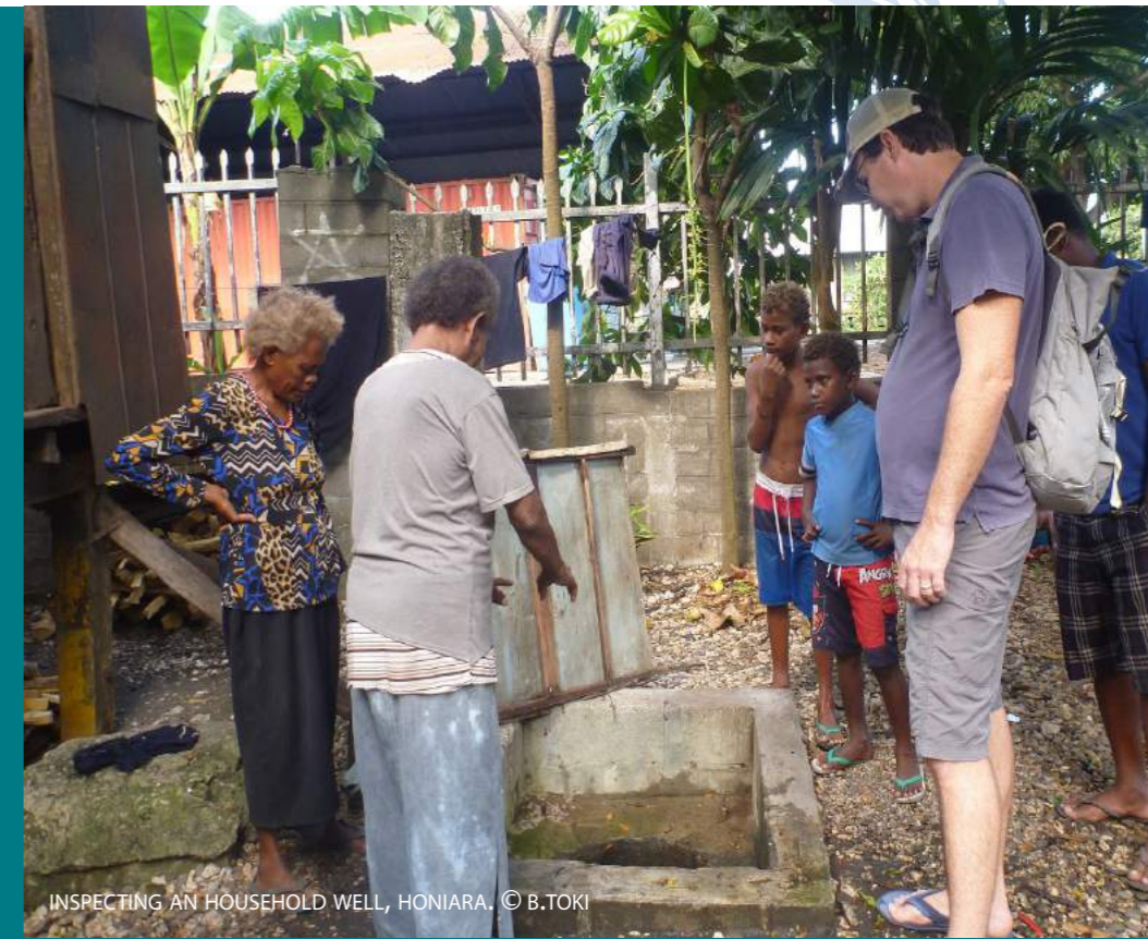
INSPECTING AN HOUSEHOLD WELL, HONIARA.