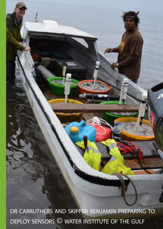
DR CARRUTHERS AND SKIPPER BENJAMIN PREPARING TO DEPLOY SENSORS

Activities include native forest conservation,