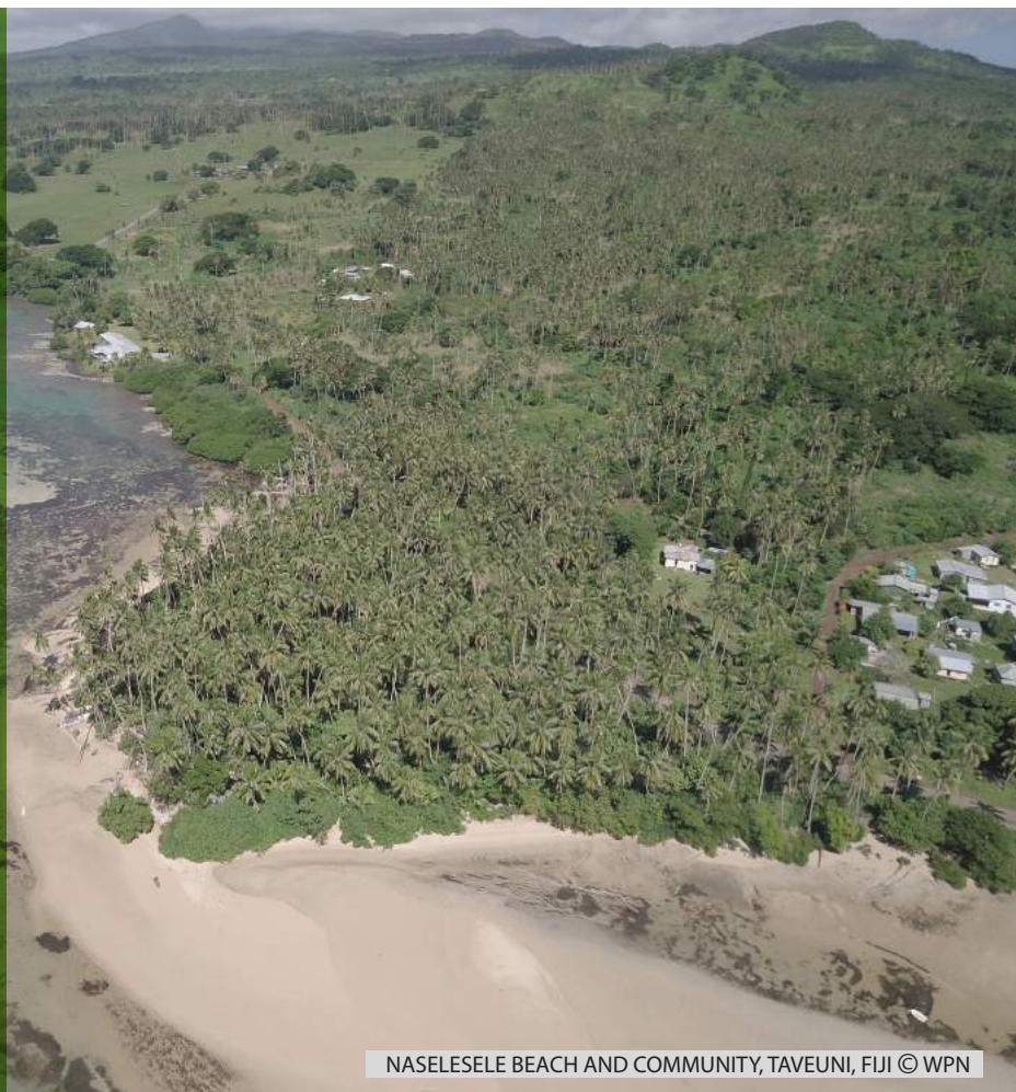
NASELESELE BEACH AND COMMUNITY, TAVEUNI, FIJI