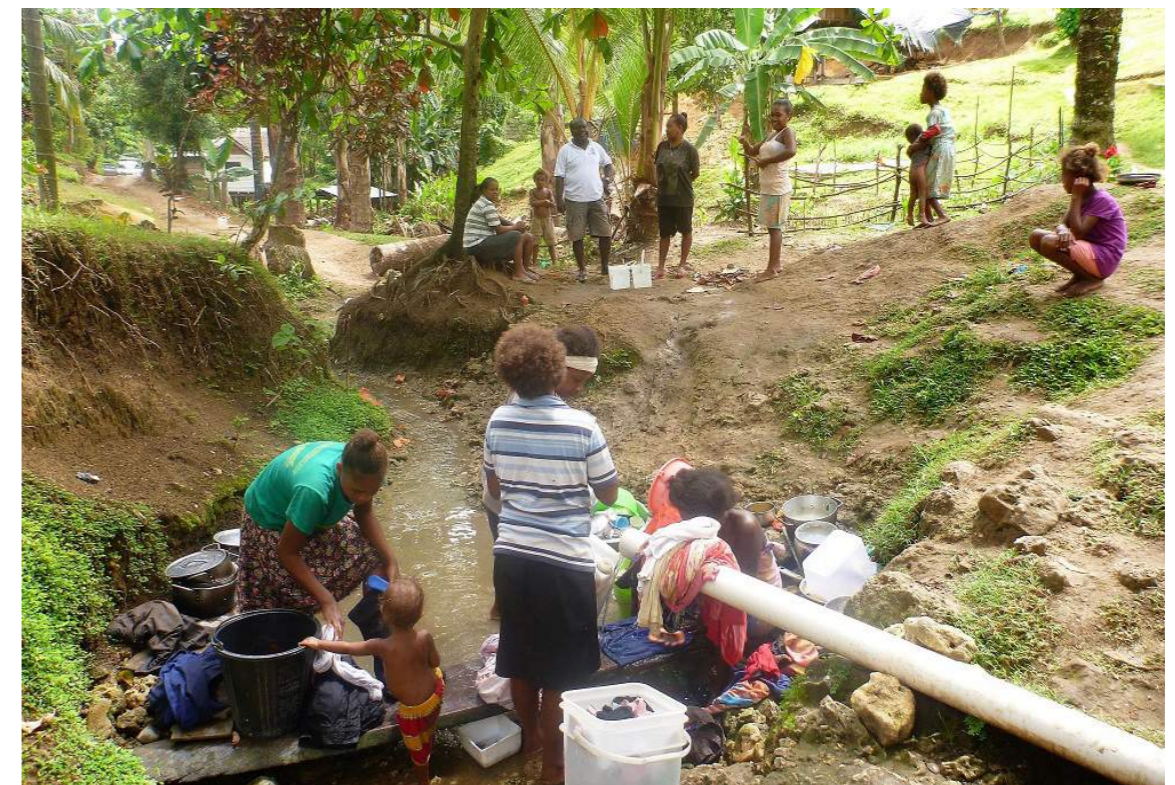
WOMEN ACCESSING WATER, WIN VALLEY SETTLEMENT IN HONIARA.

Similar consultation meetings were held with Choiseul provincial government to discuss activities for Wagina Island, Sasamuga and Choiseul Bay.