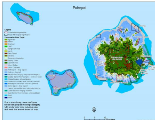
Figure 3A. Pohnpei subset map - Conservation Base Map