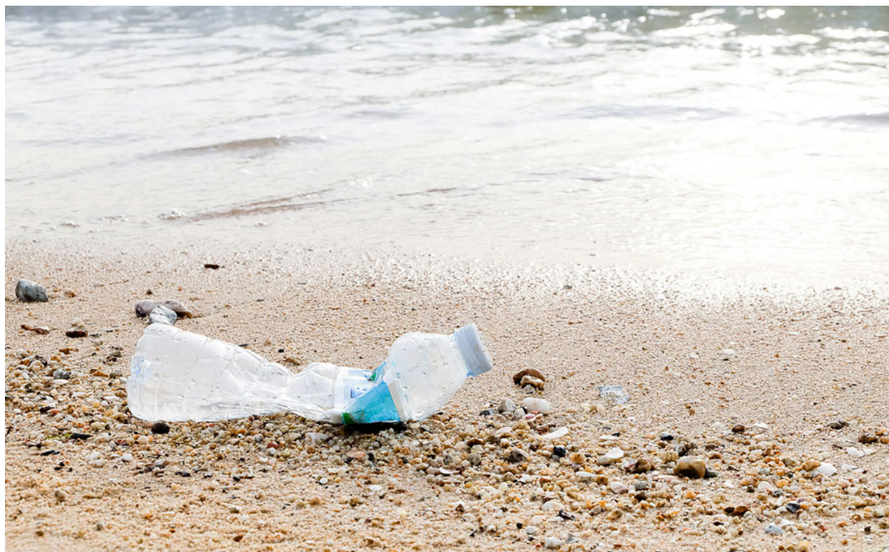
SINGLE-USE PLASTIC ON BEACH