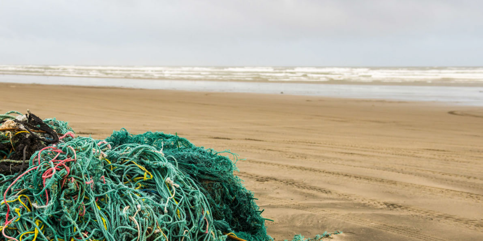
TANGLED MESS OF NETS AND ROPES WASHED UP ON THE OREGON BEACH

Ecological Solid Waste Management Act of 2000. 168 The Act prohibits open dumps and states that: