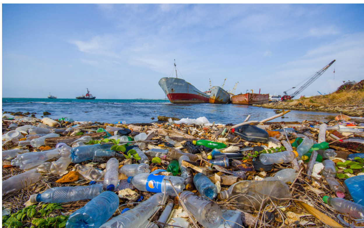
PLASTIC POLLUTION WASHED ASHORE NEXT TO THE PANAMA CANAL