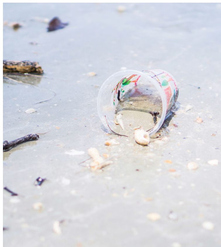
SINGLE-USE PLASTIC CUP ON BEACH

through memoranda of understanding among cities and regions, 324 the buyback program’s purpose is to incentivize fishermen to bring back long-lasting DFG (plastic nets, lines, traps, and other fishing equipment) collected during fishing operations. Funds are provided 4:1 by the Korean central government and the local governments, respectively. 325 The program is applicable beyond 12 miles from the coastline (i.e., beyond the territorial sea as defined by the UN Convention on the Law of the Sea). 326 The annual average budget for the 2009-2012 period was US$4.4 million for payments based on a fixed rate per type of