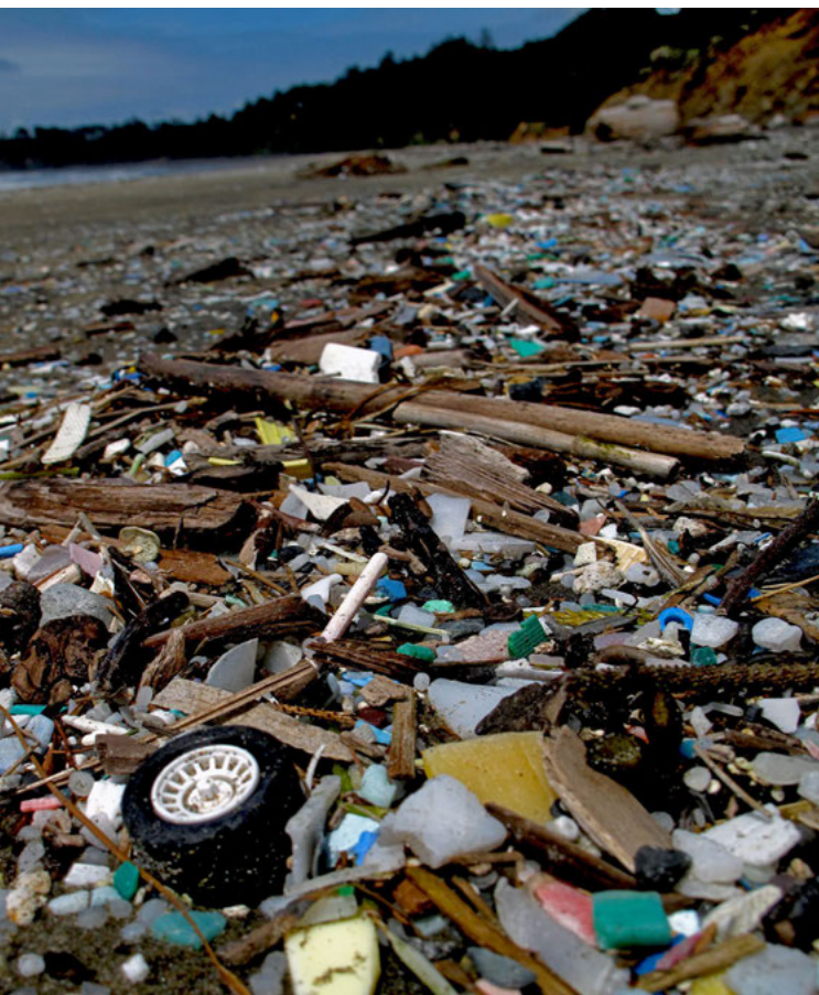
A BEACH WITH A HIGH CONCENTRATION OF MARINE LITTER

abandoned nets and fishing gear, leading to death and injury. 12 Several studies have found that ingested microplastics can disrupt cellular processes and degrade tissue 13 as well as concentrate toxins across the food chain, leading to a biomagnification effect. 14 Marine litter can also lead to economic losses, due to the cost of coastal cleanup and lost tourism revenue. The Asia-Pacific region is reported to lose US$1.265 billion annually due to damage to its fishing, shipping, and marine tourism industries caused by marine litter. 15 Marine litter presents a serious nonpoint pollution problem to Scotland, costing the state at least £16.8 million or US$24.3 million annually (when calculating consumptive uses, non-consumptive uses, and indirect uses of Scottish coasts and waters). 16