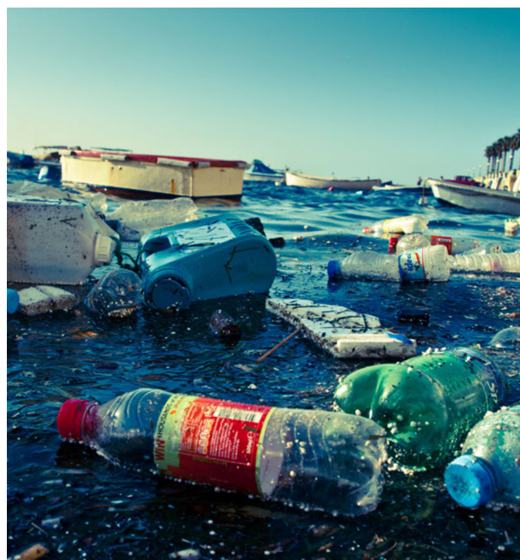
MARINE PLASTIC DEBRIS ON A BEACH IN MALTA

In 2007, California passed a law requiring best management practices for companies that manufacture, handle, and transport nurdles. 74 The law governs “preproduction plastic,” which “includes plastic resin pellets and powdered coloring for plastics.” 75 It provides that “all permits issued under the national pollutant discharge elimination