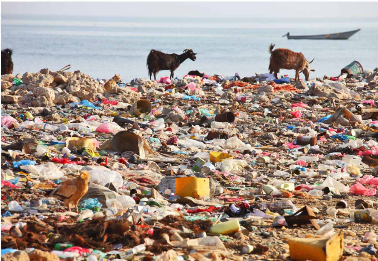
MARINE PLASTIC DEBRIS ON BEACH

In July, 2015, New York City banned certain polystyrene foam items such as: polystyrene foam single-service items including cups, bowls, plates, takeout containers, and trays; and polystyrene loose fill packaging, commonly known as packing peanuts. 147 The law exempted expanded polystyrene containers used for prepackaged food that have been filled and sealed prior to receipt by the food service establishment, mobile food commissary, or store, as well as expanded polystyrene containers used to store raw