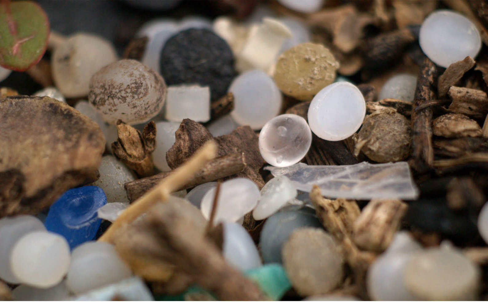
PLASTIC PELLETS USED IN PLASTIC PRODUCTION WASHED UP ON BEACH.

and effective response to marine litter. Article 30 also requires the creation of an Expert Council and the establishment of an Expert Conference to give advice and make proposals concerning promotion of countermeasures against marine litter. 46