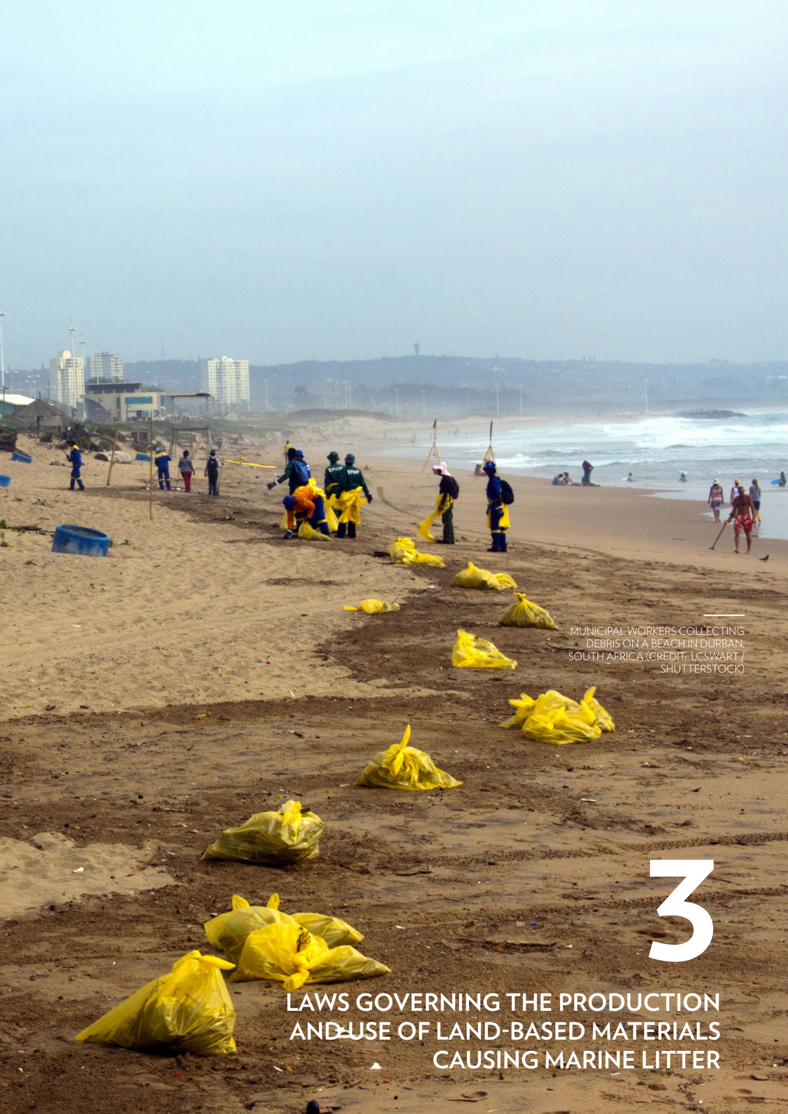
MUNICIPAL WORKERS COLLECTING DEBRIS ON A BEACH IN DURBAN, SOUTH AFRICA