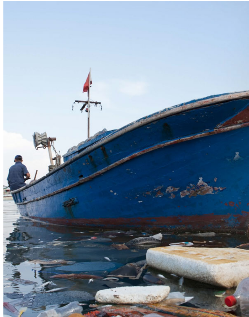
FLOATING MARINE DEBRIS