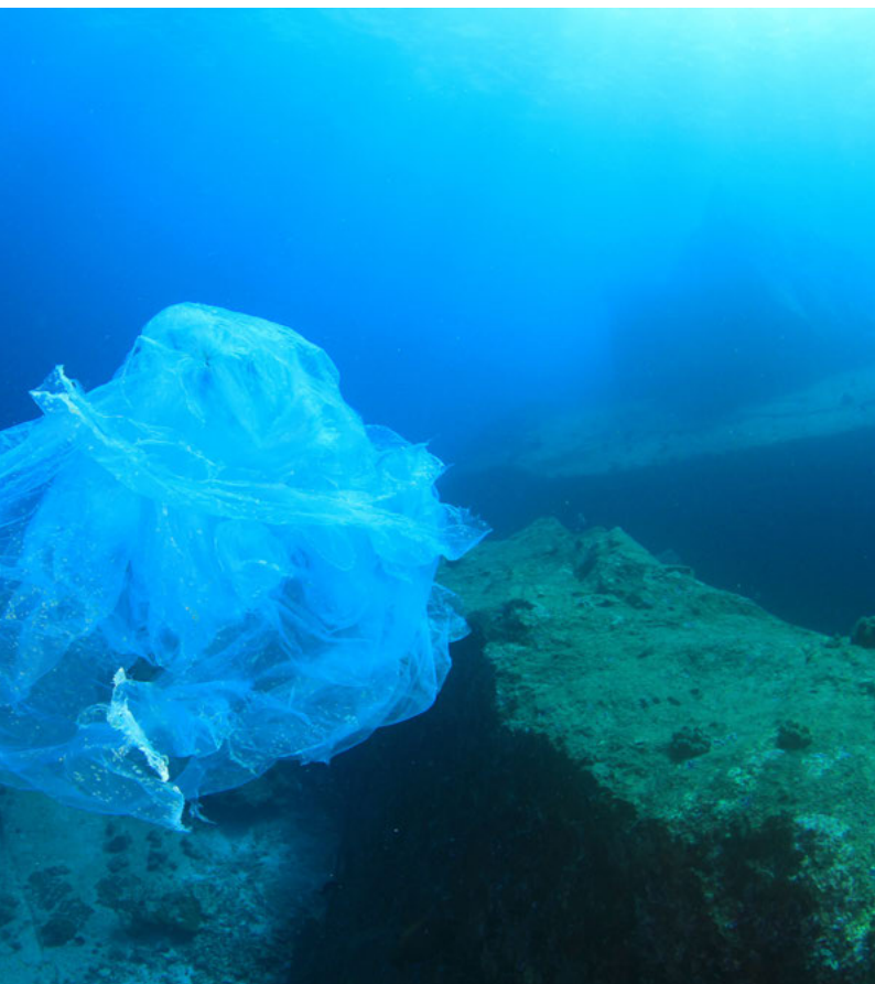
FLOATING PLASTIC DEBRIS

Pulp Mills case, and the Nuclear Test cases further confirm its binding status in international law. 38