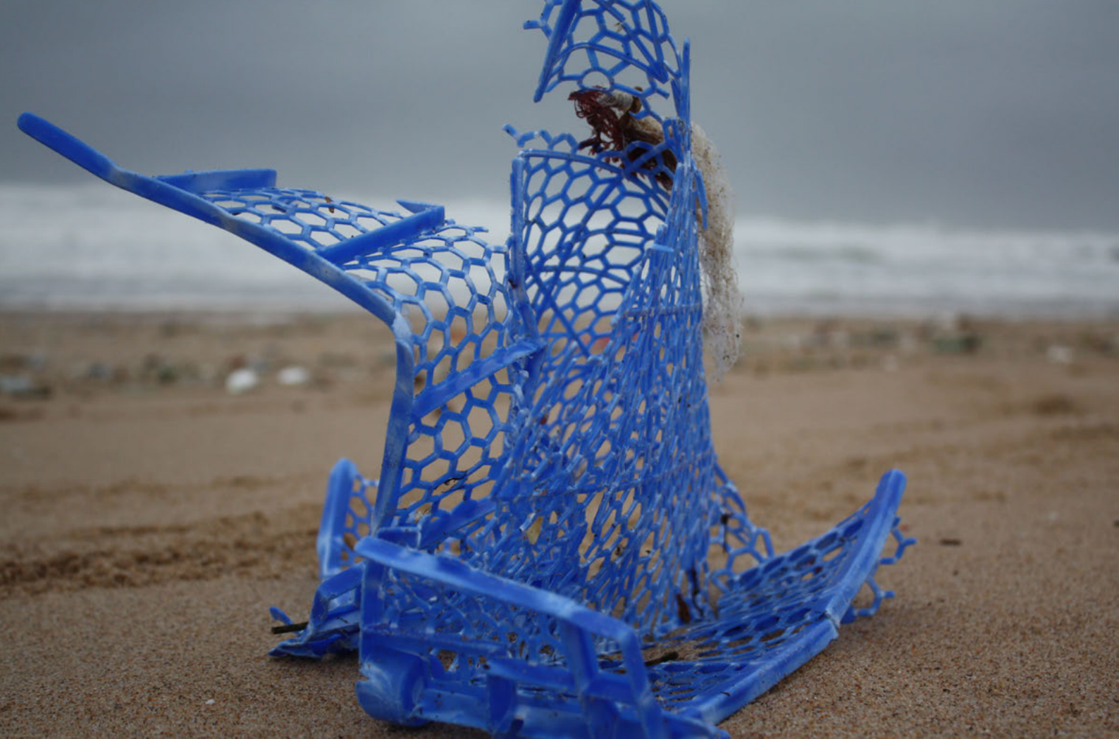
MARINE LITTER ON BEACH

of overarching marine litter policies. States that elect to adopt a comprehensive, holistic approach to marine litter management may: