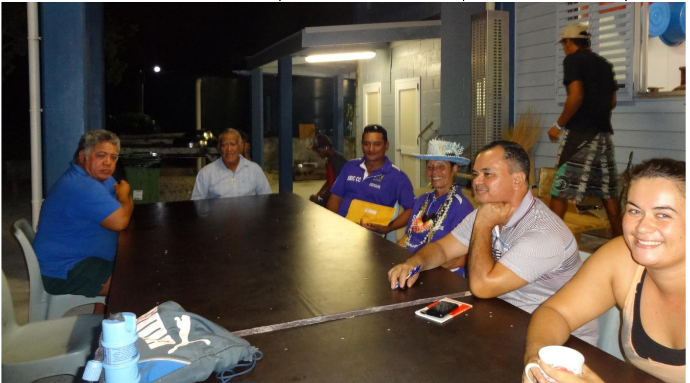
Passionate enthusiasts sharing their thoughts with the team 25 May 2015