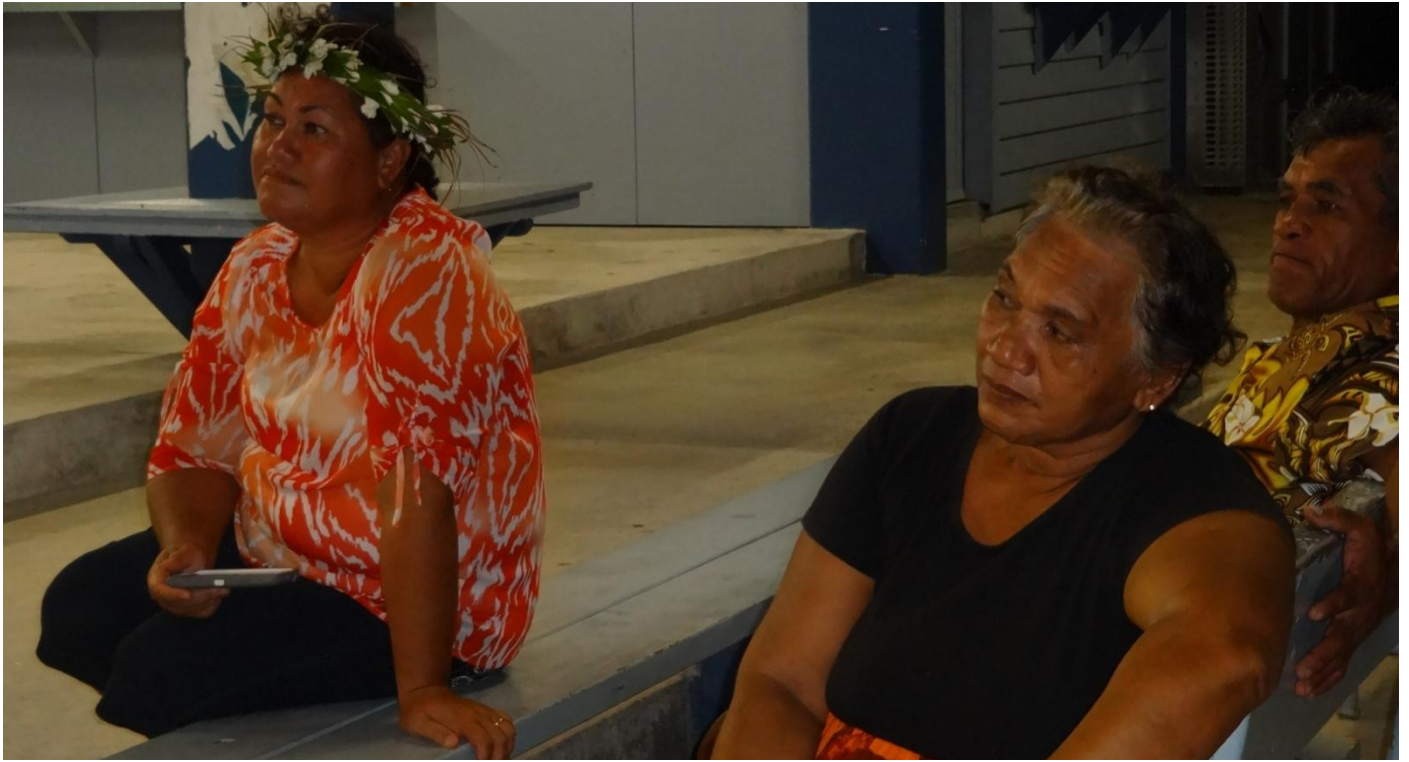
After watching the Rauti Para documentary the people in both villages were able to verify the information it contained. Some also shared their own experiences similar to those depicted in the documentary.