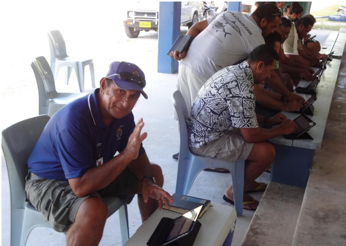
Tablet training in Tukao on Manihiki 22/25 May 2015