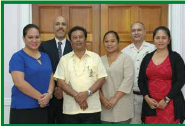
(Front-second from left): H.E. Thomas Esang Remengesau, Jr, President of The Republic of Palau with the Palau Peer Review Team, May 2013.