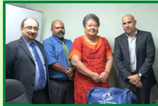
(First-right): Hon. Charles Abel, Papua New Guinea (PNG) Minister of National Planning and Monitoring with the PNG Peer Review Team, October 2012.