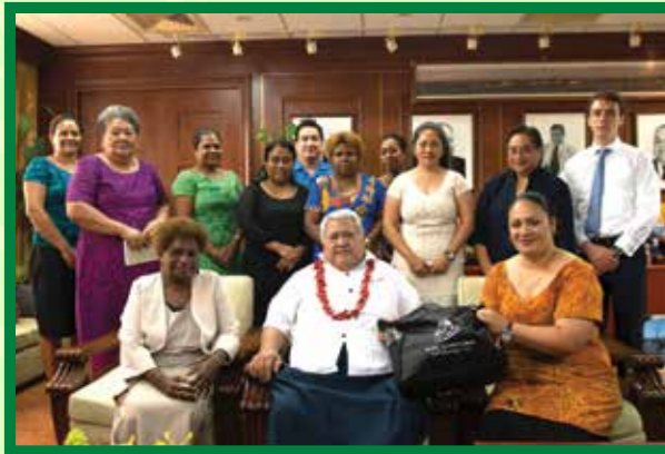
(Sitting-middle): H.E. Hon. Tuilaepa Lupeolai Aiono Sailele Malelegai, Prime Minister of Samoa with the Samoa Peer Review Team, November 2013.