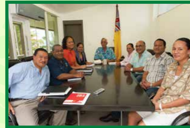
(Centre) Hon. Toke Talagi, Niue Premier with the Niue Peer Review Steering Committee and PIFS Peer Review Follow up team, April 2012.