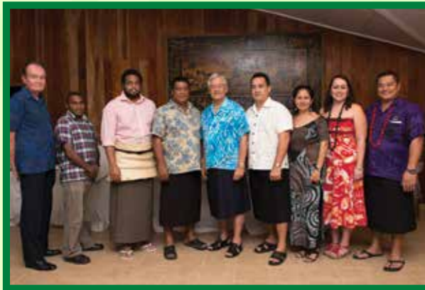
(Fourth from left) H.E Lord Tu'ivakano, Prime Minister of Tonga, (Fifth from left) Tuiloma Neroni Slade, PIFS Secretary General and the Tonga Peer Review Team