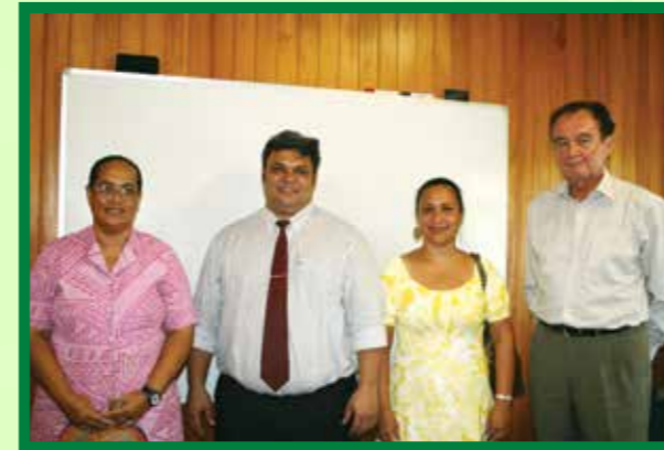
(Second from Left) Hon. Dr Kieren Keke, (Former) Nauru Minister for Finance and Planning with the Nauru Peer Review Team, March 2010.