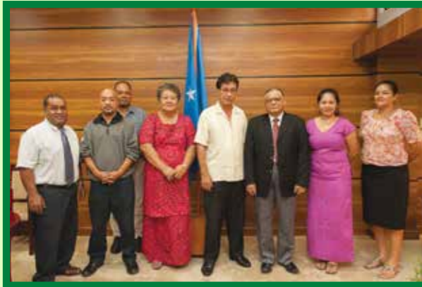
(Fifth from left): H.E. Emanuel Mori, President of the Federated States of Micronesia (FSM) with the FSM Peer Review Team, November 2012