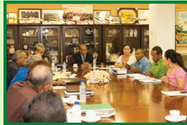
H.E. Christopher J. Loek, President of the Republic of the Marshall Islands (RMI) with his Cabinet and RMI Peer Review Team, February 2012