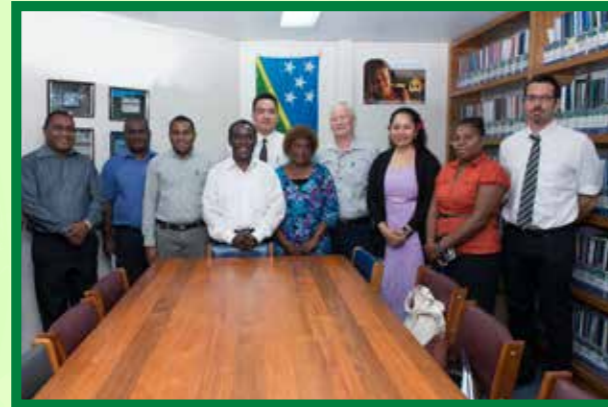
(Fourth from left): Hon. Connelley Sandakabatu, Solomons Islands Minister for National Planning and Aid Coordination with the Solomon Islands Peer Review Team, September 2013.