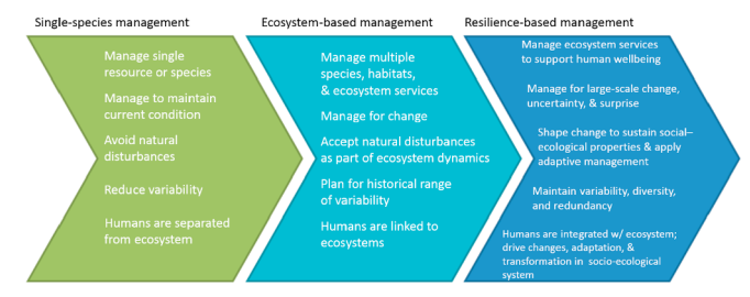
Fig. 1. Evolution of Natural Resource Management (modified from Chapin et al., 2009).

Atmospheric Administration (NOAA) 2018). Continued climate change, even if global warming can be kept within 2 °C above preindustrial levels, is likely to drive most coral reefs into further decline (e.g., Frieler et al., 2013).