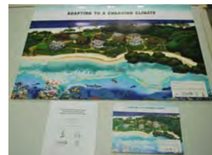
Climate Change Tool Kit

February 27 – March 2: The PACC Project Assistant, attended the Climate Change Tool Kit workshop in Kosrae. This was organized by The Micronesia Conservation Trust, MCT and the Nature Conservancy on behalf of the Micronesia Challenge. Training was given in the use of the Climate Change Flipchart, which will be used in awareness campaign. A Climate Change Awareness Team team organized with members from PACC, KIRMA, Kosrae Conservation & Safety Organization, KCSO; Yela Environmental Landowners Authority, YELA; Marine Resources Division ,MRD; Department of Resources and Economic Affairs, DREA and the Department of Education, DOE.