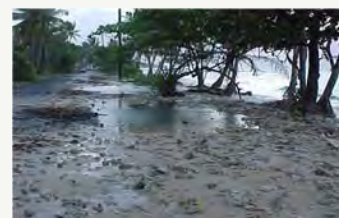
Surge waves damage to road