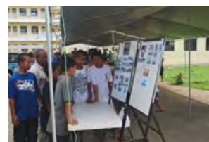
Cultural Day Exhibition

Our Culture, Our Environment Display. Visitors of the booth, included students, senior citizens, general public and Government officials. Brief description of the effects of climate change. Told the people about the community visits beginning in April to talk about how to adapt to the effects of a changing climate. In collaboration with the Kosrae CC Team ( KIRMA, KCSO, YELA)