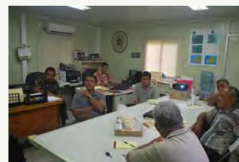
PACC Steering Committee