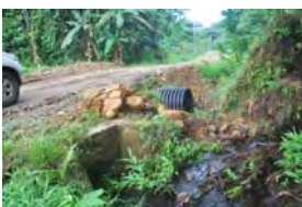
Raising the road and replacing bigger culverts