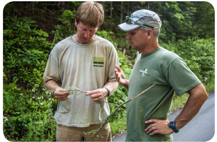
Forest Service employees discuss invasive species management.

and gain efficiencies, resulting in more effective treatment programs against terrestrial and aquatic invasive species. Partners include adjacent private landowners, nongovernmental organizations, and governmental partners (e.g., State departments of agriculture, State fish and game agencies, county governments, Federal regulatory agencies, and other Federal partners).