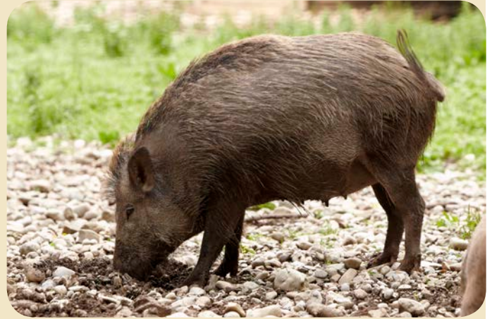
Feral swine.

Feral pigs ( Sus scrofa ) are formerly domestic swine hybrids that are free-roaming. Their rooting in the ground for food creates large areas of disturbance, which causes soil erosion, degrades water quality in streams, and damages property. More importantly, ground disturbance promotes the introduction and establishment of many invasive plants. In addition, feral pigs are very effective at dispersing the seeds of the many invasive plants with edible fruits, further exacerbating the spread and abundance of invasive plants. In Hawaii, invasive plants are replacing native species in native forests across whole watersheds and landscapes. In most instances, invasive plant management and restoration cannot be successful until the feral pigs are removed and excluded from the area. The Forest Service is partnering with the State of Hawaii and other organizations to fence large areas (2,000 to 5,000 acres) to enable the removal of feral pigs as a first step toward the restoration of native plant species and communities and the myriad of ecosystem services they provide.