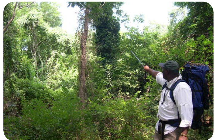
Forest Service employee conducting invasive species survey.