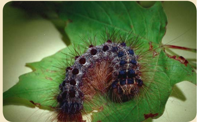
Gypsy Moth Larvae.

A key lesson to learn from the success of the gypsy moth Slow-the-Spread Program is the importance of working with partners to promote and implement a coordinated, regionwide program based upon the biological parameters of the pest. Gypsy moth Slow-the-Spread exemplifies a well-coordinated, broad landscape response that is often necessary to effectively respond to invasive pests.