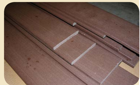
Saltcedar composite boards.