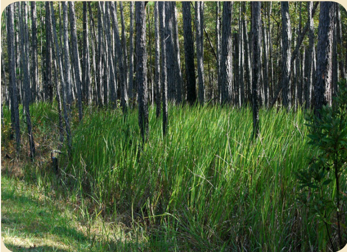
Cogongrass (priority 2 weed) invading pine stand on Francis Marion National Forest.

The Francis Marion and Sumter National Forests in South Carolina work closely with State agencies, the Southeastern Exotic Pest Plant Council, and other stakeholders to develop, prioritize, and coordinate invasive plant management activities on the forests and adjacent lands. The teams developed a joint list of the 50 high-risk invasive plants and prioritized prevention and control efforts based on threat distribution, threat to forest resources, and the geographic area threatened. The Forest Service eradicates high-risk species not known to occur on Forest Service lands and detects and manages invasive species that threaten priority habitats.