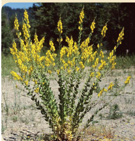
Dalmatian toadflax.

Effective control often requires an integrated approach such as mechanical control combined with herbicide treatment, herbicide treatment followed by seeding with competitive grasses, and the treatment of large infestations with herbicides in combination with biological control with insects. One example of this technique would be to release biological control agents near the center of the infestation, and then spray the edges to reduce or prevent the spread of the infestation. The greatest impact is obtained by repeated treatments over multiple years.