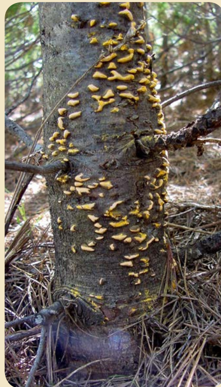
White pine blister rust ( Cronartium ribicola ).