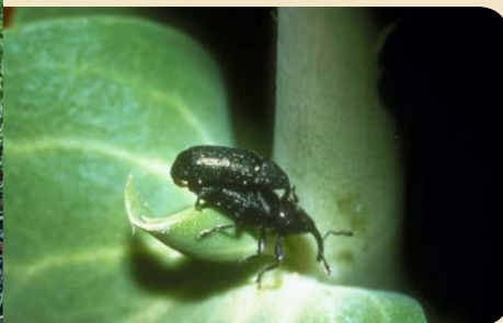
Below: Adult toadflax stem mining weevils ( Mecinus janthinus ) established on yellow toadflax near Ovando, MT.