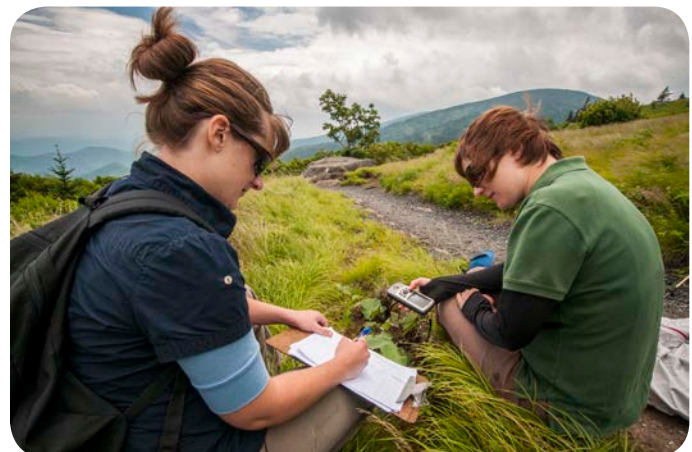
Forest Service employees record survey results.