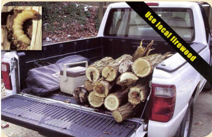
Don't move firewood, use local firewood—on Northeastern Area's don't move firewood poster (NA-PR-02-06).

When the Gold Spotted Oak Borer (GSOB) ( Agrilus auroguttatus ) arrived in San Diego County in 2008 and began killing native oaks, forest health protection specialists developed a campaign to prevent the spread of invasive insects and diseases that move in firewood in California. They led the creation of the California Firewood Task Force with other Federal, State, and local partners. The task force established a Web site (complete with interactive cartoons), developed and distributed education and outreach materials to each of the 18 national forests in California, and developed a Firewood Pest Passport Activity to educate youth and their families about the risk that moving firewood poses to forests. Efforts are ongoing with multiple private and public landowners to halt the movement of GSOB-infested oak firewood; 39 million acres of oak forests are at risk in California alone. A multipartner effort is also working on improved methods for GSOB detection, appropriate use/disposal of infested material, and individual tree protection.