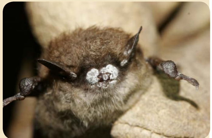
Little brown bat; close-up of nose with fungus, New York, October 2008.

Hibernating bats species are threatened by a rapidly spreading, lethal disease called white-nose syndrome (WNS). The disease is caused by a new fungal pathogen, presumed to be exotic, called Geomyces destructans . It was first discovered in 2007 in upstate New York and has already killed more than a million bats, including rare and endangered species. The pathogen is spreading rapidly south and west. The Forest Service is very concerned about the spread of WNS, an unprecedented wildlife health crisis, and has joined with other agencies and conservation organizations in restricting access to caves and mines to help slow the spread of WNS. Forest Service scientists worked with partners to develop a sensitive test to detect the fungus in cave soils. Now they are evaluating the genetic viability of the Indiana bat based on current population losses, to look for resistance to the disease among hibernating bat species, and to characterize the distribution of the pathogen in cave sediment samples from bat hibernation sites in the Eastern United States. Bat biologists working on WNS are using this research to devise strategies to save these animals from extinction.