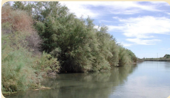
Salt Cedar ( Tamarix spp. ) on Snake River.