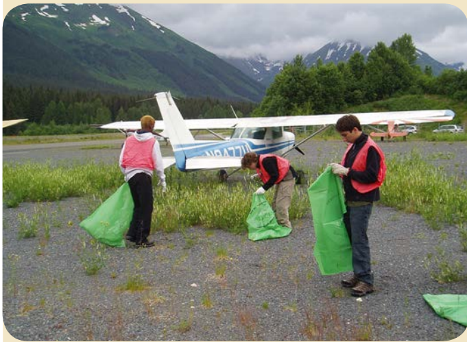
Eradication of white sweetclover ( M. albus ) in Alaska.

White sweetclover ( Melilotus albus ) and other invasive plants on the Chugach National Forest in Alaska occur in areas of human disturbance and adjacent river systems, but they are generally absent in back-country areas. In 2006, a large patch of clover was found at the Girdwood Airport, an entryway to a salmon stream. The Forest Service immediately partnered with the town on a weed-pulling campaign by local students. During the first couple of years, a 10-person crew annually pulled weeds and filled dozens of bags during a 1-week-long period. After 5 years, a 2-person crew was able to complete the job in 1 day. This white sweetclover infestation is a priority because the sweetclover has the potential to disperse its seed via the adjacent creek and via aircraft into much larger areas of roadless land throughout the Chugach National Forest and interior Alaska.