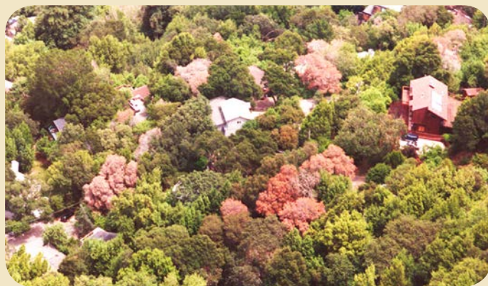
Sudden Oak Death is costly and difficult to manage when infected trees occur in residential settings such as this San Francisco Bay Area neighborhood.

Although the impact of Sudden Oak Death, to date, has mainly been seen in coastal areas of Western States, the Forest Service's National Early Detection Survey for P. ramorum has surveyed more than 500 streams in the Eastern United States in an effort to protect valuable oak resources in the East.