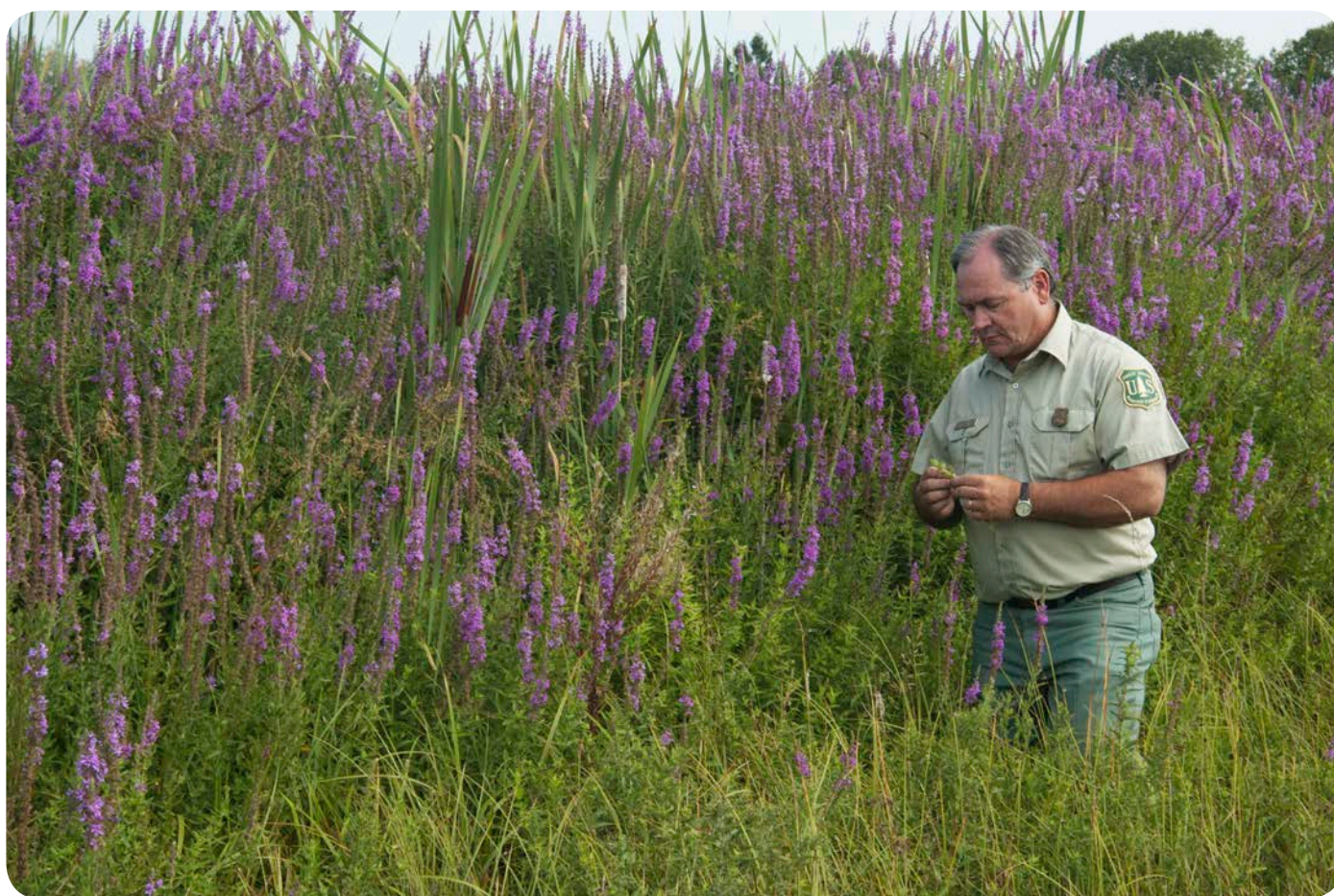
Purple Loosestrife ( Lythrum salicaria L.) on the Sawtooth National Forest, Idaho.

grammed at the regional scale, as appropriate. The ISSA guiding principles and the roles and responsibilities sections clarify the roles of the national office, Northeastern Area, International Institute of Tropical Forestry, and regions, stations, and forests (appendix A). Successful implementation of the ISSA involves coordination and communication among all parts of the agency and effective outreach and collaboration with local, regional, national, and international partners.