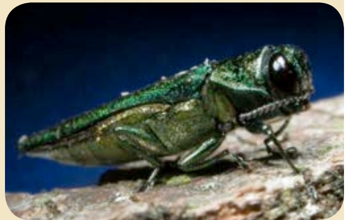
Emerald ash borers and other borers move with firewood.

Nationally, the Forest Service continues to collaborate with the U.S. Department of Agriculture, Animal and Plant Health Inspection Service; the National Association of State Foresters; the National Plant Board; and others to develop and implement national standards for "pest-free" firewood. In addition, Forest Service scientists at the National Threat Centers and their partners focused on pathways for human-assisted spread of forest pest species. This research helps to craft strategies that help land managers prepare for and respond to the spread of multiple pests across very large regions in North America.