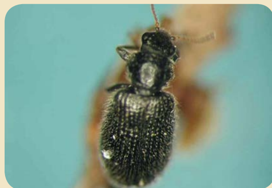
The beetle, Laricobius nigrinus, is a predator of hemlock woolly adelgid adults and eggs.

Of the nine species of hemlock worldwide, only eastern and Carolina hemlock evolved in the absence of an adelgid herbivore. Foreign exploration revealed that a number of adelgid specialist predators played an important role in regulating HWA populations in its native range. Several of these predators (there are no known parasites of adelgids) proved to be good candidates for establishment in the Eastern United States, including several coccinellid and derodontid beetles from China, Japan, and the Pacific Northwest. Although establishment efforts are still underway for most of the selected predators, a lady beetle from Japan, Sasajiscymnus tsugae , and the derodontid beetle Laricobius nigrinus from the Pacific Northwest are now confirmed established in a number of Eastern States. The establishment of L. nigrinus has been so successful in some areas that in the 8 years following its initial release, thousands of predatory beetles can now be collected in the field and redistributed annually to other infested areas.