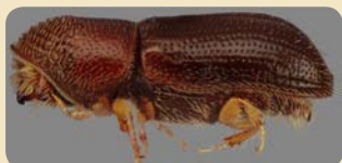
Walnut twig beetle.

Dieback and mortality of eastern black walnut trees ( Juglans nigra ) in the Western States has become more common and severe during the last decade. Walnut twig beetles ( Pityophthorus juglandis ) initiate this mortality, by creating numerous galleries beneath the bark of affected branches. The walnut twig beetle carries the fungus ( Geosmithia morbida ) that causes large numbers of cankers under the bark, hence the name “thousand canker disease.” The beetle and the disease have now been confirmed in several Eastern States.