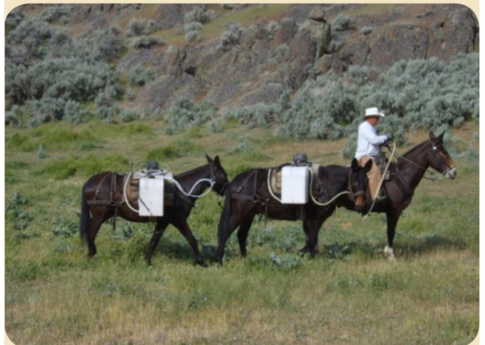
Horse-mounted pesticide application equipment used for backcountry weed eradication on national forests.

The Jackson and Buffalo Ranger Districts of the Bridger-Teton National Forest make up 52 percent of the land within the Jackson Hole Weed Management Association. In the past, weed invasions tended to enter the forest near the boundaries of lands of other jurisdictions and at the periphery of the Jackson Valley, typically along roads, trails, and river corridors, and spread into the forest from there. In 2006, using this geographic information and a list of 15 priority “new invader” plant species, the Forest Service initiated an Early Detection and Rapid Response (EDRR) program in priority (emphasis) areas, with the objective of eradicating those high-risk invasive plants before they could get a foothold and spread. By adapting the geospatial and tabular capability of the Natural Resource Information System-Terra invasive species application, the Forest Service identified almost 7,000 priority acres for detection and immediate eradication efforts. In total, the Forest Service successfully eradicated 15 priority species from those 7,000 acres. One emphasis area was the Teton Wilderness. The forest hired a packhorse contractor with extensive experience to detect, map, and treat all listed species of priority invasive weeds within the Teton Wilderness. This jointly funded Forest Service and Rocky Mountain Elk Foundation effort was the first broad effort to proactively confront and successfully address the invasive-weed problem within the Teton Wilderness using the EDRR approach.