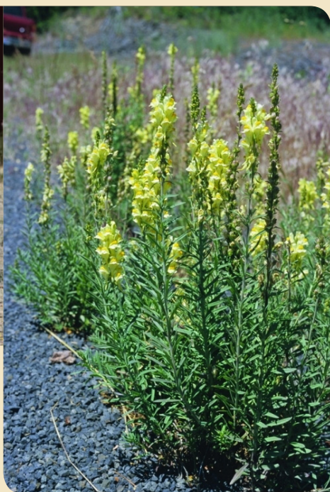
Left: Yellow toadflax.