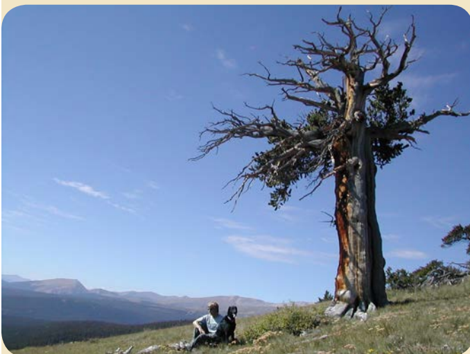
High-elevation western pines are threatened by invasive white pine blister rust, native bark beetles, and weather patterns.

Proactive management strategies are being tested that encourage regeneration in advance of the pathogens arrival so that a larger pool of genotypes is present (Schoettle and Sniezko 2007). Then natural selection will allow the survivors with more resistance to the rust pathogen to reproduce. In addition, preparation for early deployment of genetic resistance through plantings into threatened ecosystems is underway to sustain ecosystem health and function as blister rust continues to spread. Collaboration across Forest Service deputy areas and with cooperators/partners in other Federal and State agencies and tribes is essential to making progress in protecting, sustaining, and restoring key white pine ecosystems, including high-elevation ecosystems.