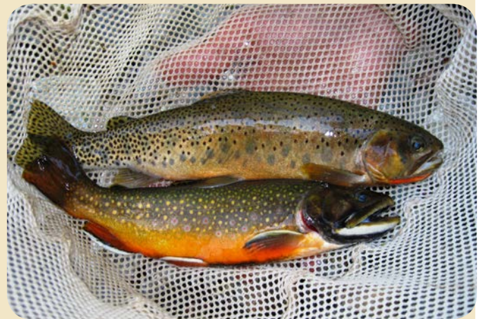
Cutthroat trout ( Oncorhynchus clarkii ) and brook trout ( Salvelinus fontinalis ).

The faces of success. The interagency 2007 Cherry Creek crew typifies the crews who walked many miles restoring the stream and the number of workers required annually for a successful treatment.