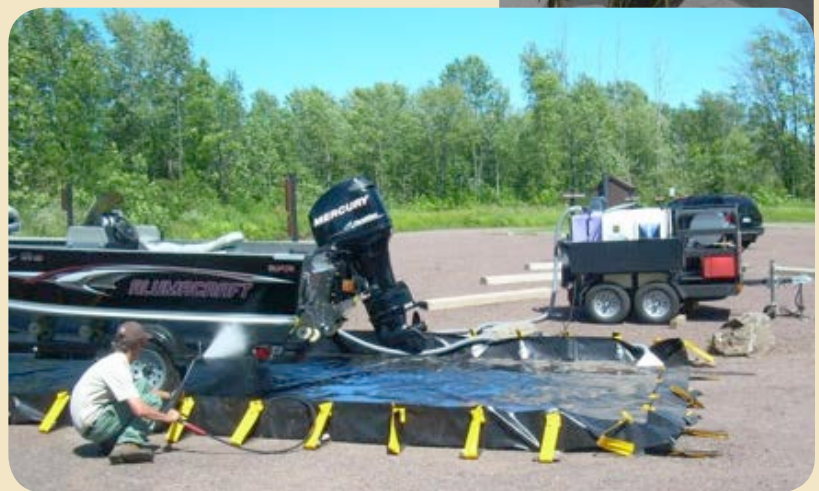
Inspecting and cleaning a boat to remove invasive plants and mollusks.