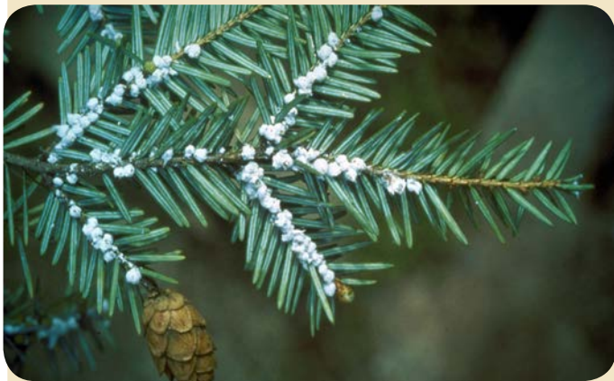
Cottony masses on the underside hemlock branches are characteristic of the presence of hemlock woolly adelgid. These ovisacs contain mature hemlock woolly adelgid and eggs and are conspicuous from the late fall to early summer.

At the request of a broad range of stakeholders including the National Association of State Foresters, and the National Plant Board, the Forest Service (State and Private Forestry and Research and Development) prepared an HWA research and technology development needs assessment to address HWA and, particularly, the lack of management tools. In