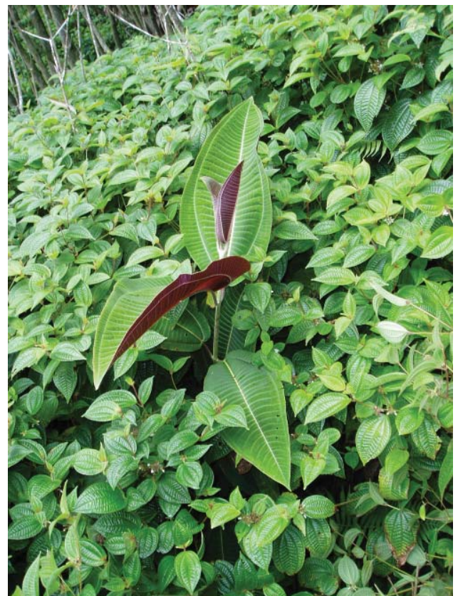
Fig. 4 A sapling growing out of a patch of Clidemia hirta on O'ahu. The large leaves and striking purple undersides make miconia fairly detectable, although in heavy vegetation, trees can still be missed.