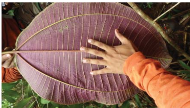
Fig. 2 Typical leaf size for Miconia calvescens .

Ground surveys are conducted for 800 m around every mature tree and 500 m around every immature tree every three years. The 500 m or 800 m radius around trees is called the ground buffer. An analysis of OISC's miconia field data shows that 99% of immature trees fall within 350 m of a mature tree (Fujikawa, pers. comm. 2017), confirming that the size of the search area is large enough.