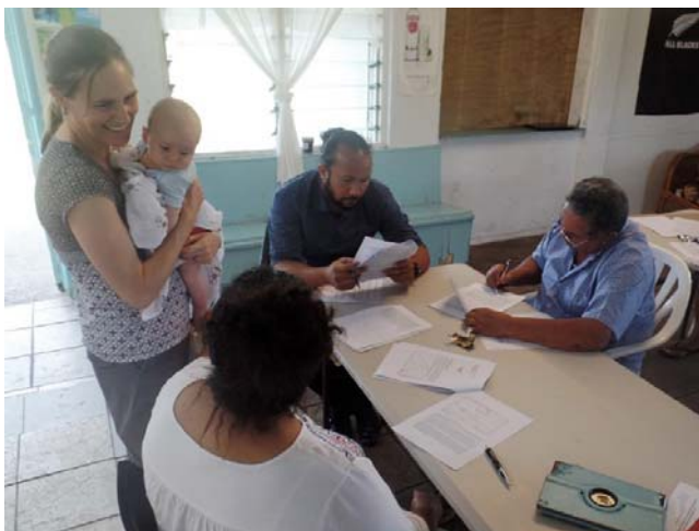
Practical EIA exercise – EIA report review