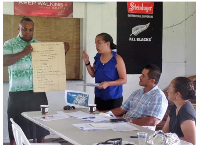
Practical EIA exercise – development proposal screening