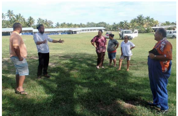
Field trip – inspection of site for new cultural centre