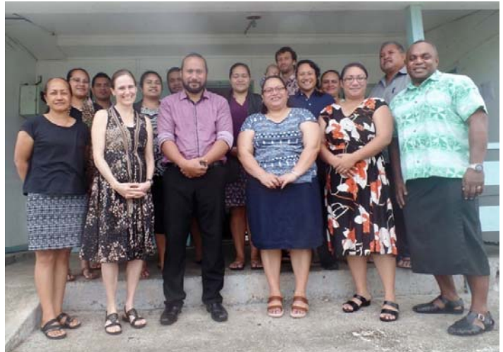
Workshop participants, day 1