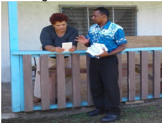
Visit households by council staffs