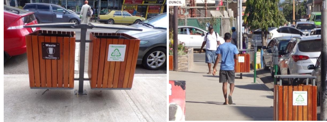
Separate Bins installed along the Main Street