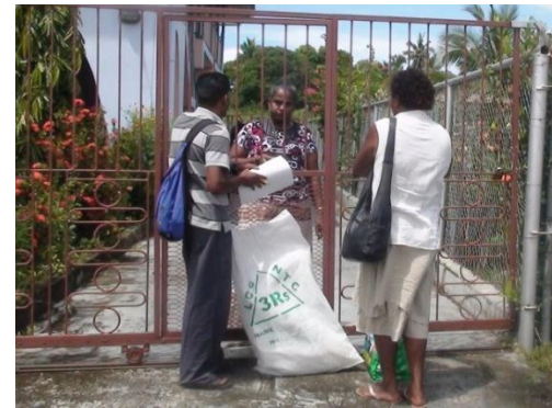
House-to-house visit by 3R Promoters