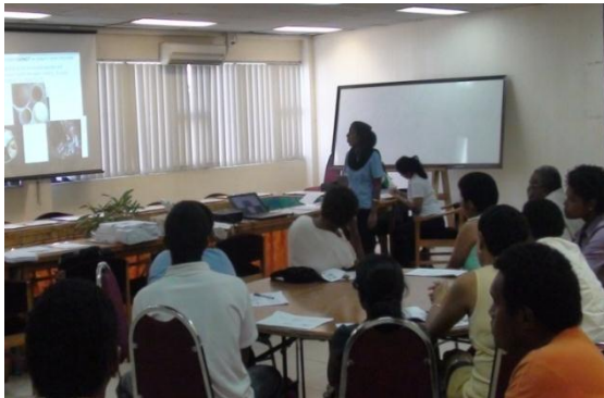
Training for 3R Promoters