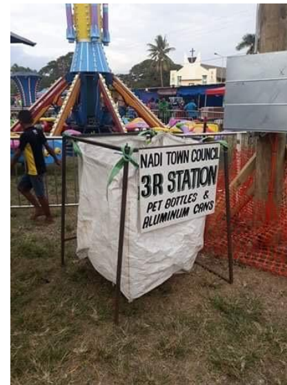
3R Stations during Bula Festival