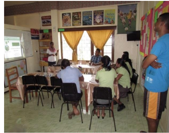
Professional Development Session for teachers