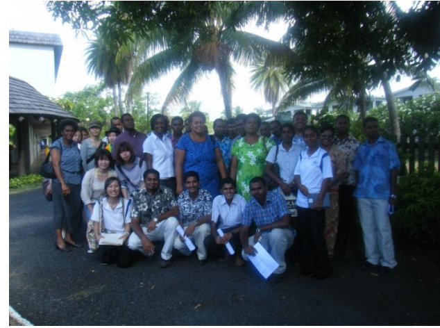
Workshop for teachers