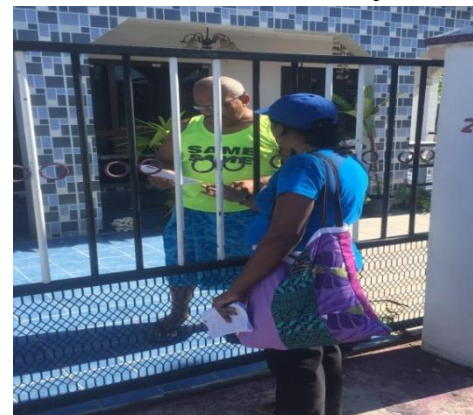
Visit households by council staffs