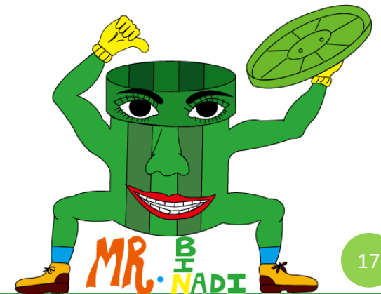
Nadi's environmental character

Contact: Nadi Town Council Health Department PO Box 241 Nadi, Fiji health1@naditowncouncil.com.fj