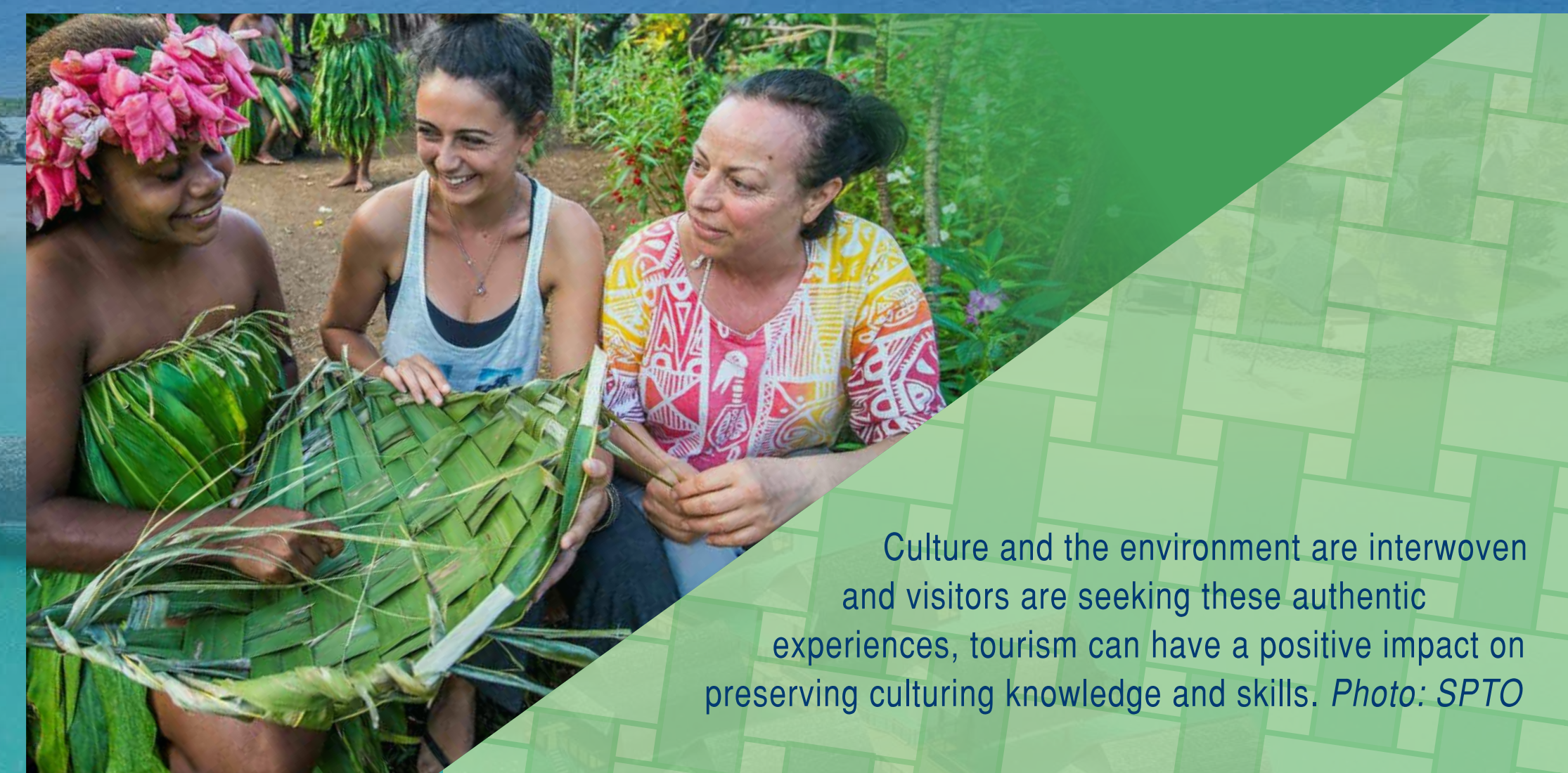
Culture and the environment are interwoven and visitors are seeking these authentic experiences, tourism can have a positive impact on preserving culturing knowledge and skills.

Well planned developments can lead to improved environmental outcomes such as improved water quality and coastal stability, through better waste management and erosion control. Photo: Tonga Domestic Ferry Terminal.