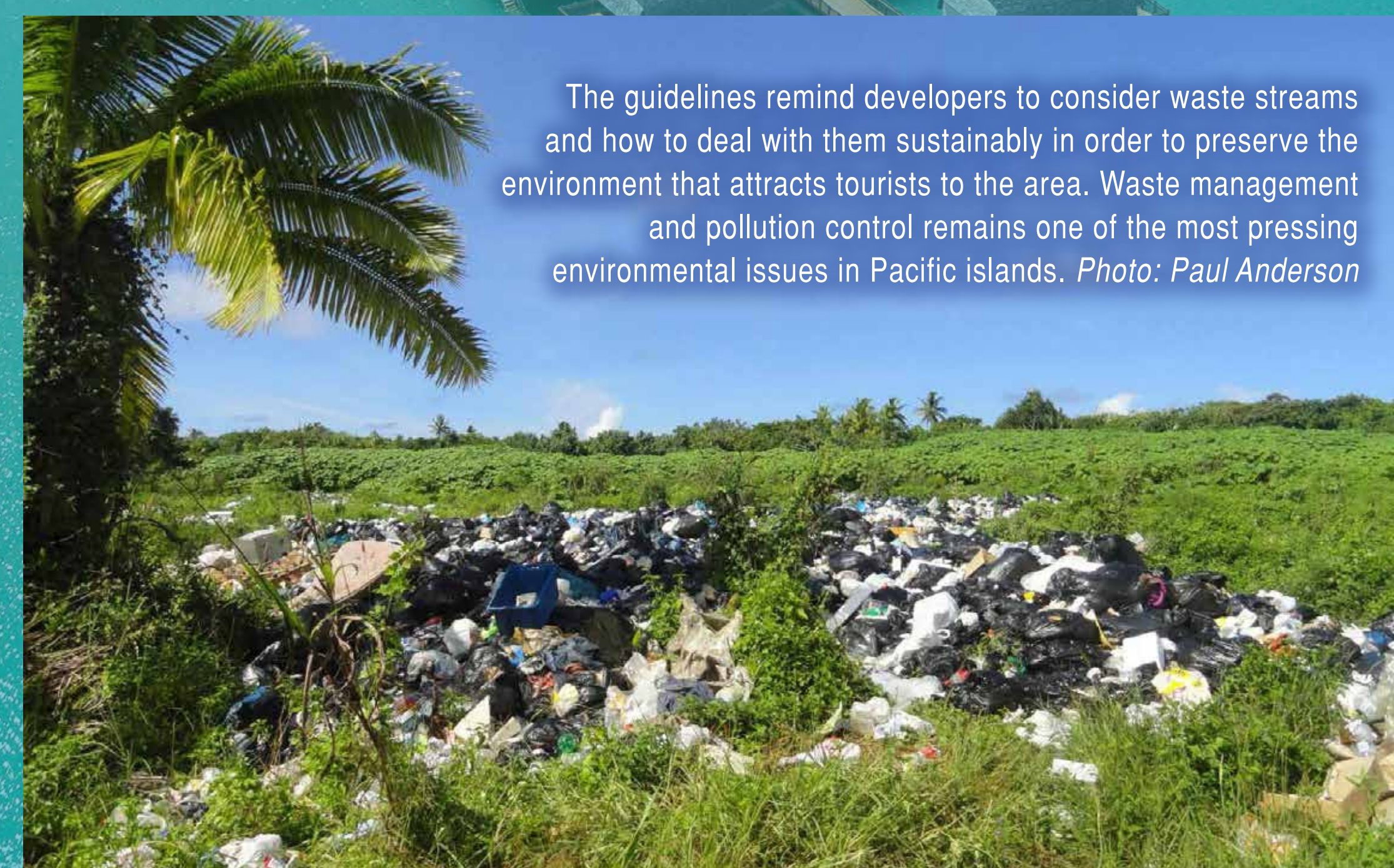
The guidelines remind developers to consider waste streams and how to deal with them sustainably in order to preserve the environment that attracts tourists to the area. Waste management and pollution control remains one of the most pressing environmental issues in Pacific Islands.

SPREP has now partnered with the South Pacific Tourism Organisation (SPTO) to produce the Environment Impact Assessment Guidelines for Coastal Tourism Development in the Pacific island countries and territories .