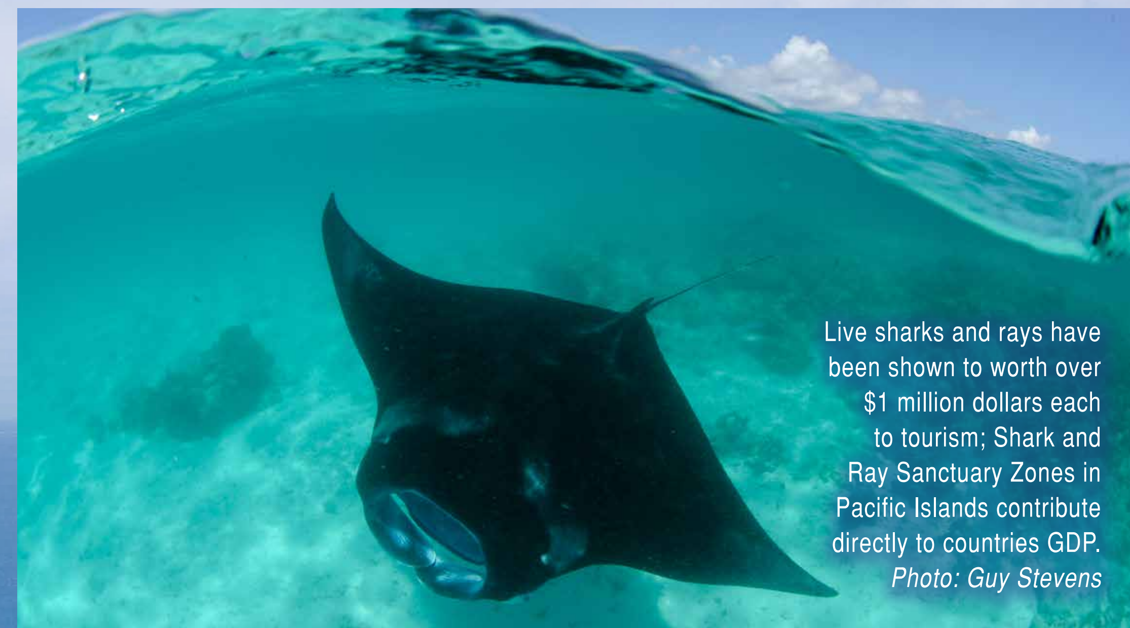
Live sharks and rays have been shown to worth over $1 million dollars each to tourism; Shark and Ray Sanctuary Zones in Pacific Islands contribute directly to countries GDP.