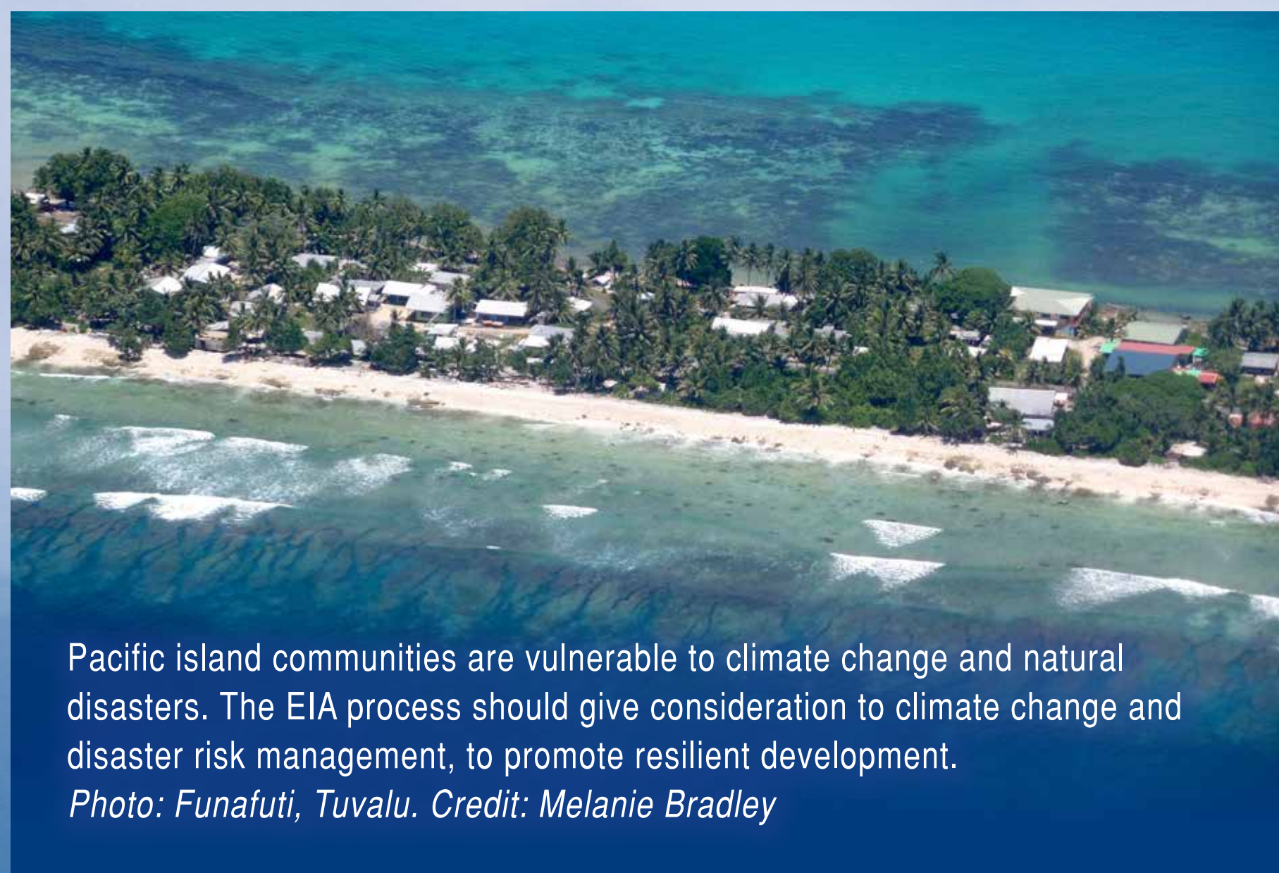
Pacific island communities are vulnerable to climate change and natural disasters. The EIA process should give consideration to climate change and disaster risk management, to promote resilient development. Photo: Funafuti, Tuvalu.