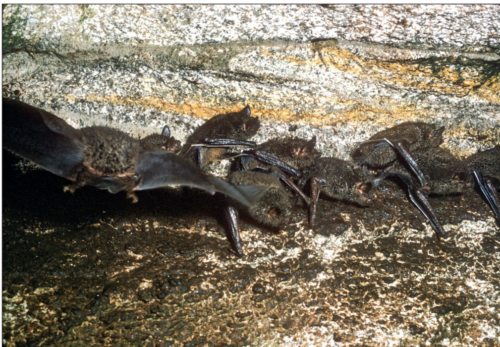
Figure 3. Greater short-tailed bats ( Mystacina robusta ) in the “bat cave”, Big South Cape Island/Taukihepa, April 1961.

In 1998, an oil spill from the tanker Command occurred on the Californian coast and killed thousands of seabirds including an estimated 32,000 titi (Moller et al. 2003; Bellingham et al. 2010; McClelland et al. 2011). Eleven titi were recovered on beaches including one banded on Whenau Hou (Codfish Island). The discovery of this bird allowed Rakiura Māori and Otago University to apply for mitigation funding through the Command Oil Spill Trustee Council . With the assistance of Oikonos Ecosystem Knowledge , funding was received to study the productivity of titi and sustainability of muttonbird harvesting (under the Kia Mau Te Tītī Mo Ake Tōnu Atū project) and to restore privately owned islands through the eradication of rats, which was overseen by the non-profit group, Ka Mate Nga Kiore (Moller et al. 2003; Moller et al. 2009; Bellingham et al. 2010; McClelland et al. 2011). The