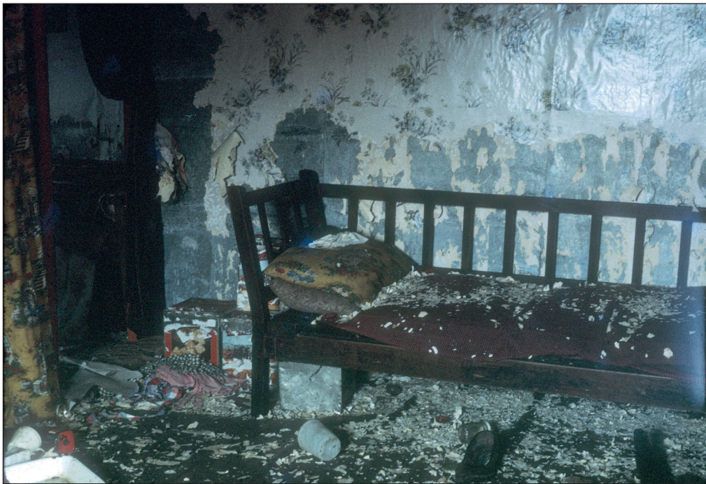
Figure 2. Damage by ship rats ( Rattus rattus ) to the Waitiri family muttonbird hut on Big South Cape Island/Taukihepa, April 1964.

et al. 2016), supporting this origin hypothesis.