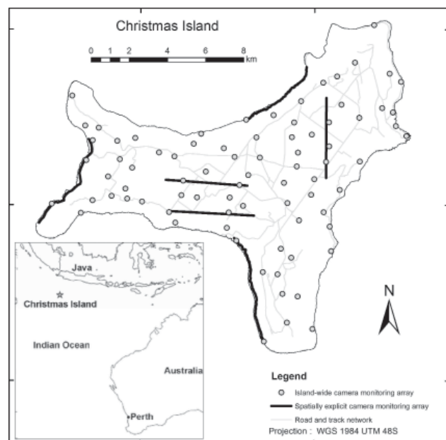
Fig. 2 Christmas Island.

Of necessity, the monitoring of feral cat activity must be conducted across the entire island. CI has an extensive road/track network (see Fig. 2) whereas, on DHI, much of the former pastoral road network has regenerated, with many roads and fence lines being impassable. The monitoring programme on DHI is being conducted from All Terrain Vehicles (ATVs) which can traverse the entire island in a safe and efficient manner. Prior to implementing the monitoring programme, it was necessary to construct a network of survey tracks to allow monitoring of cat activity across the island. The spacing of these tracks