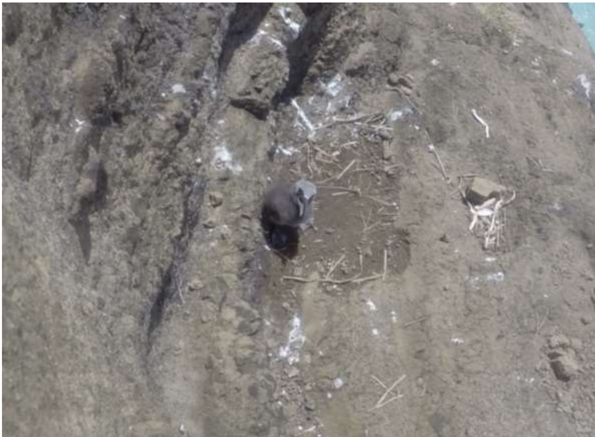
Photograph 1. Brown Noddy chick