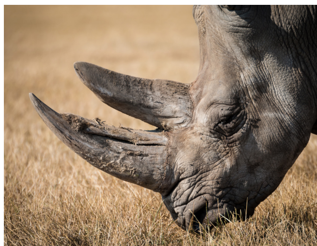
Black rhinoceros grazing - a critically endangered species

One particularly successful outcome was the African Colloquium of Parliamentarians in Entebbe, Uganda in June 2012, which culminated in the creation of the network of African Parliamentarians known as the Green Birds Africa to promote environmental sound management through legislative and national channels. This momentum was carried forward with greater participation of parliamentarians and stakeholders at the Parliamentarian Colloquium held in Addis Ababa in 2014. The outcome came in the form of a declaration by the Parliamentarians and important recommendations addressed to institutions including the African Union Commission, UN Environment, and member states. The Declaration included a commitment by the Parliamentarians to engage in MEAs implementation and environmental sustainability issues in their countries.