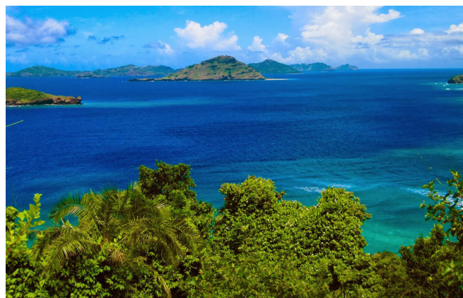
A view of nature’s beauty from Comoros Islands - an ACP country

In the Caribbean, the programme has supported a culture of institutionalizing capacity building for MEAs. In 2015, the Ministers of Environment and Sustainable Development – based on recommendations from beneficiaries – officially requested the CARICOM Secretariat to play a key role in facilitating and coordinating various capacity development initiatives on access and benefit-sharing in the region. Endorsed through a decision at the Meeting of the Council for Trade and Economic Development (COTED) – Environment and Sustainable Development in 2015, this move was emblematic of the institutional strengthening of MEAs support in the region as a result of CARICOM Secretariat’s role in hosting the Caribbean Hub.