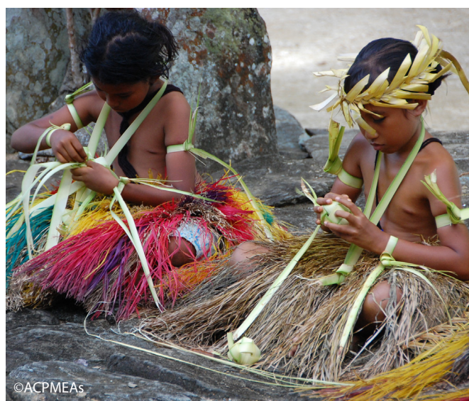
Girls in traditional grass skirts in Yap, Federated States of Micronesia

Fiji and Cook Islands also completed their respective State of Environment Reports. SPREP organized trainings for Pacific Island countries to support negotiations with users of genetic resources under the Nagoya Protocol. For example, access and benefit sharing workshops were held in Nadi and Sydney from August 5-8, 2014 to support Pacific Island Countries’ understanding and potentially becoming Parties to the Nagoya Protocol. Through such support, it is expected that at least four more Pacific ACP countries will soon become party to particular MEAs and benefit from SPREP’s advice on the same.