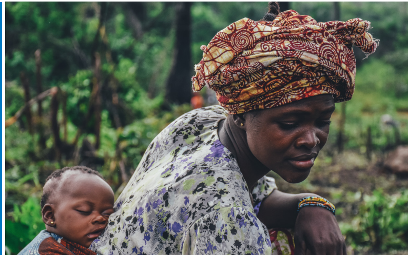
A mother working in a cassava field in Sierra Leone

In the past nine years, the programme has built a culture of institutionalizing MEAs at the regional and national level by enhancing capacities of regional institutions, national bodies, and most fundamentally, empowering the change makers of the field.