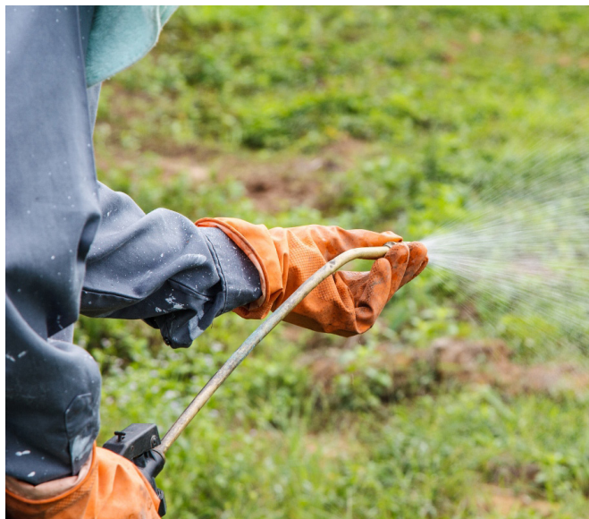
Human contact with pesticides can be harmful to health

On the issue of e-waste – the discarding of electronic equipment, which can lead to adverse human health effects and environmental pollution – the Africa Hub has led joint efforts with Economic Community Of West African States (ECOWAS), the Basel Convention Coordinating Center (BCCC), and the Secretariat of Basel, Rotterdam, and Stockholm conventions. For example, in October 2015, a joint workshop held in Lagos, Nigeria, allowed stakeholders to identify common goals, interventions, and concrete recommendations on e-waste management in the continent.