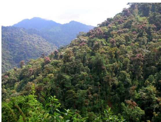
Photo: The lush cloud forests of Ecuador

https://www.iucn.org/crossroads-blog/202003/primary-forests-a-priority-nature-based-solution