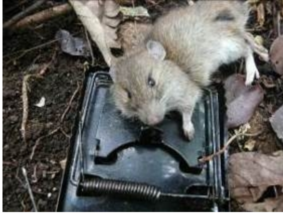
Late - Rat in snap trap