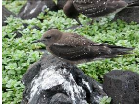
Sooty Tern fledgling ('Ekiaki)