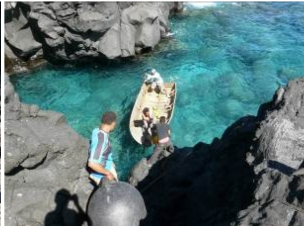
Late – final load departure off rocks.