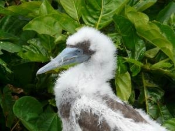
Nestling brown booby (Ngutulei)