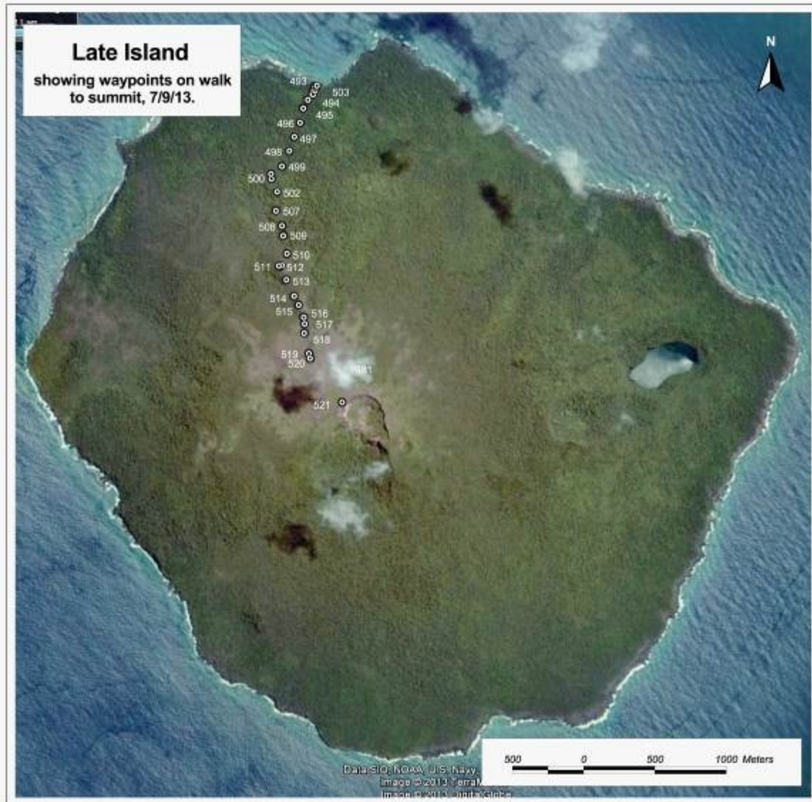
Map 2 – Late Island