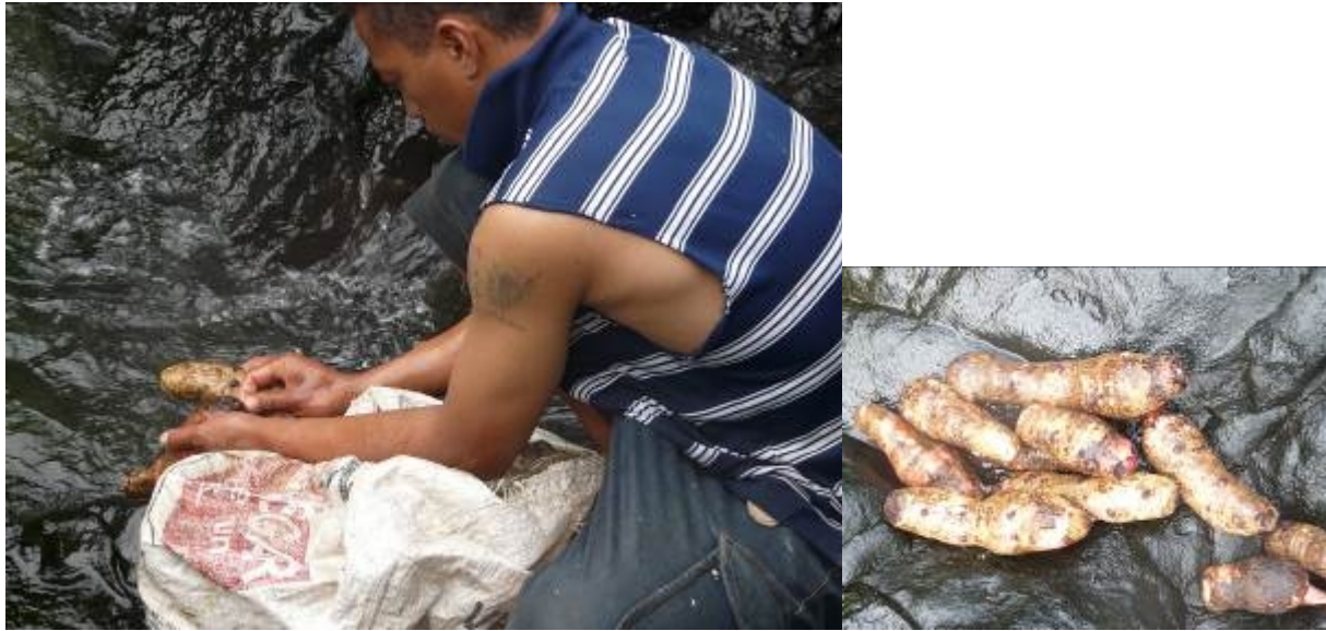
Washing taro in the sea at Late

Other root vegetables were delivered in sacks covered with soil and washed in the sea before being allowed onto Late.