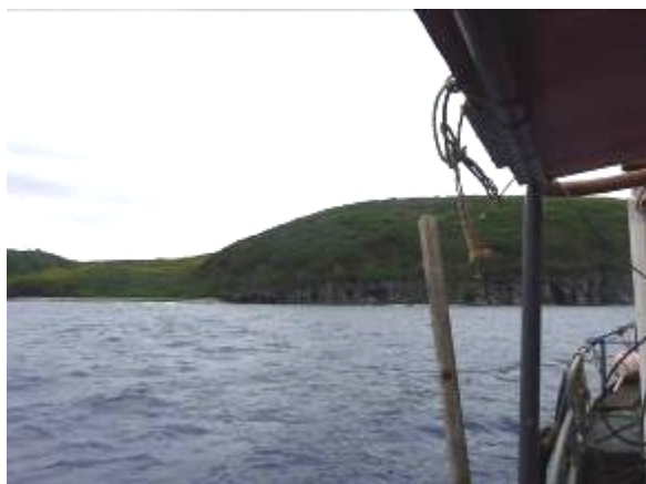
Fonualei – beach of small boulders (future landing)