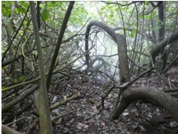
Malau nesting ground with steam in background