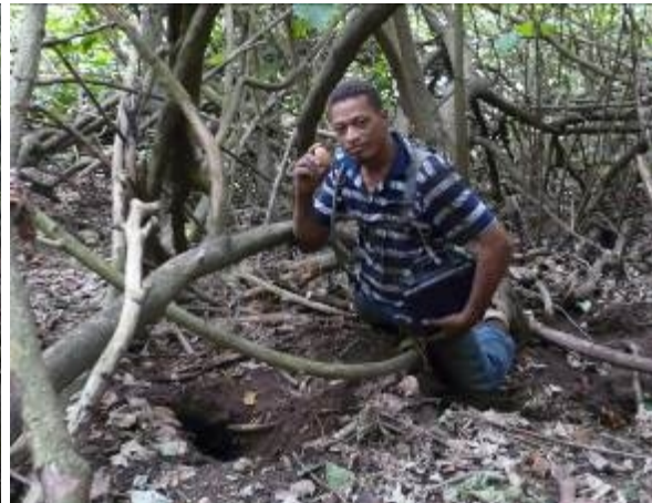
Malau nesting burrow with 1 egg (waypoint 466)