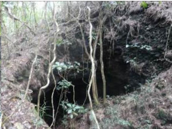
Late – inland cave

A sequence of habitat photos were taken on the walk to the summit and a second sequence of views of the island taken from the boat during the partial circumnavigation. These will be made available for the feasibility study for the rat eradication.