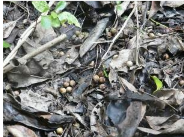
Late – fruit on forest floor