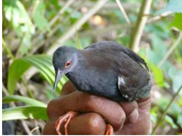
Spotless crake (Moho) released from glue trap