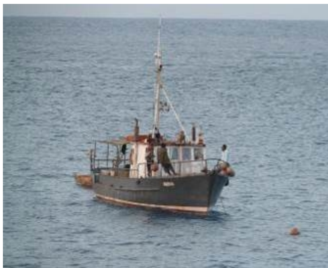
MV Akina at anchor

Left Neifau, Vavau at 12.35pm on MV Akina in fine southerly weather. Around 6pm Loku Island visible to right. 8.45pm anchored off Fonualei – opposite beach of small rocks on NW corner.