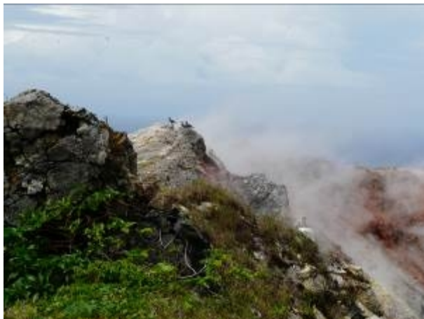
Brown booby on crater rim with steaming slopes