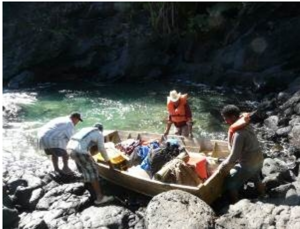
Late – departing from sheltered cove.

Checked traps and processed 5 rats caught on glue and snap traps around coast. Left Late at 12pm and circled partly round island to west before heading to Vavau at 1pm reaching Neifau at 9pm. Sequence of photos taken round coast.