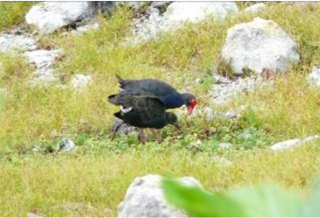
Purple swamphen & chick (kala)