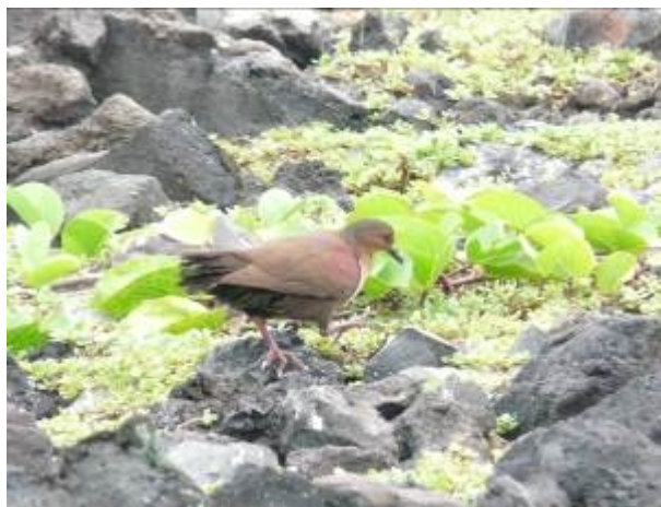
Shy ground-dove (Tū) - male