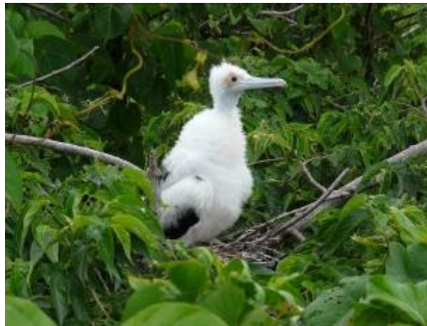
Nestling frigatebird (Lofa, Helekosi)