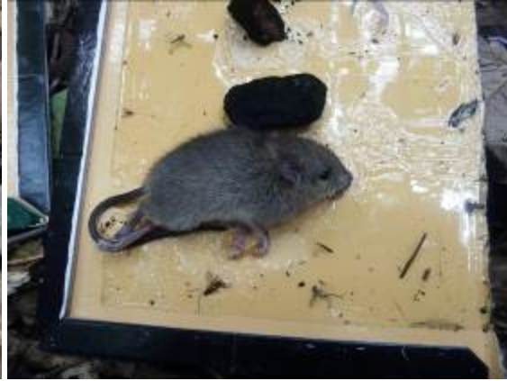
Late - Juvenile rat on glue trap