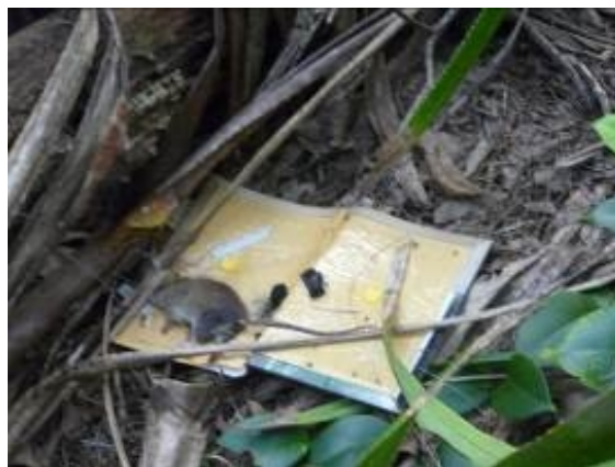
Late - Rat on glue trap baited with roast coconut