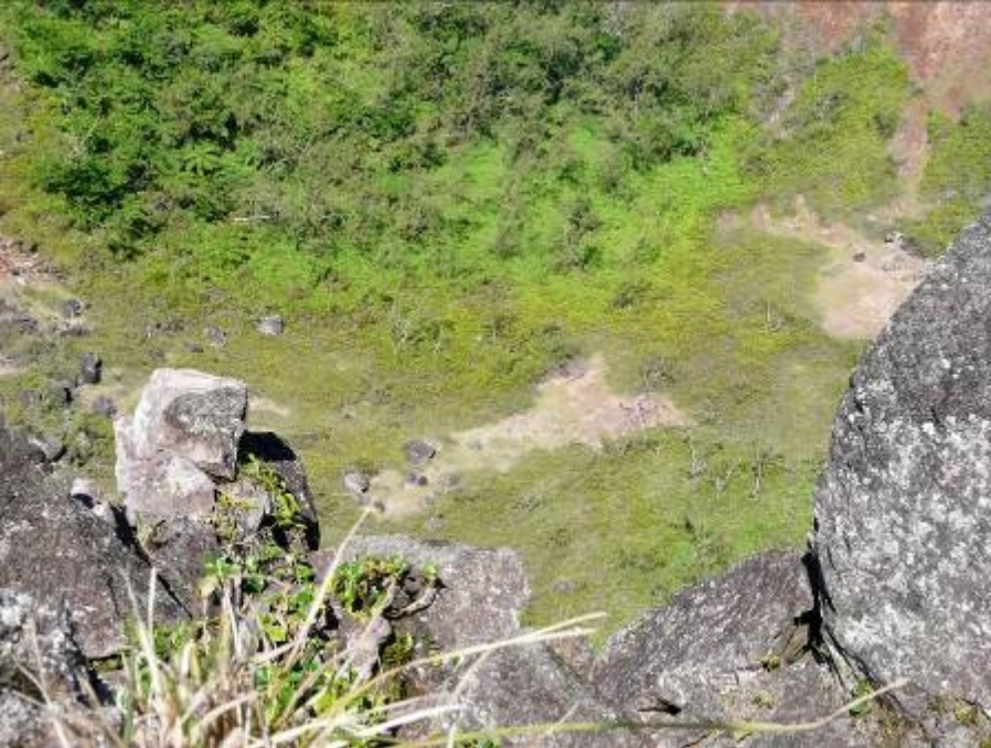
Late – looking down into main crater

Section 7.2 identifies that a volcanologist did detect some activity and steam on Late in the 1970s and it would be worth finding out whether this was in this area. It could theoretically be accessed from the south as the crater ‘breaks open’ in this direction, or more readily by helicopter if one is used for a rat eradication (see 7.3).