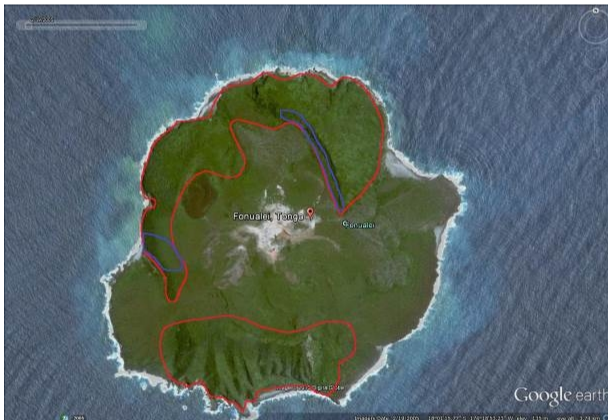
Fonualei Island showing forested areas that may be inhabited by malau