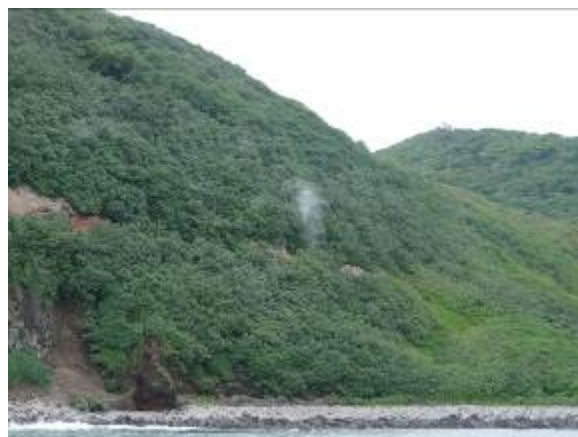
Fonualei – landing beach of large boulders 2013 (Malau nesting ground above fissure with steam)