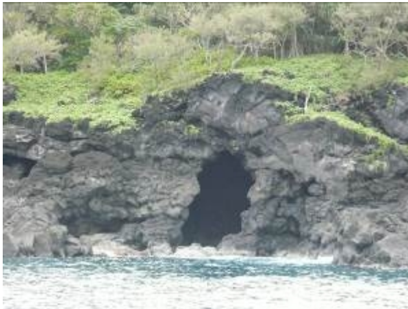
Late – coastal cave