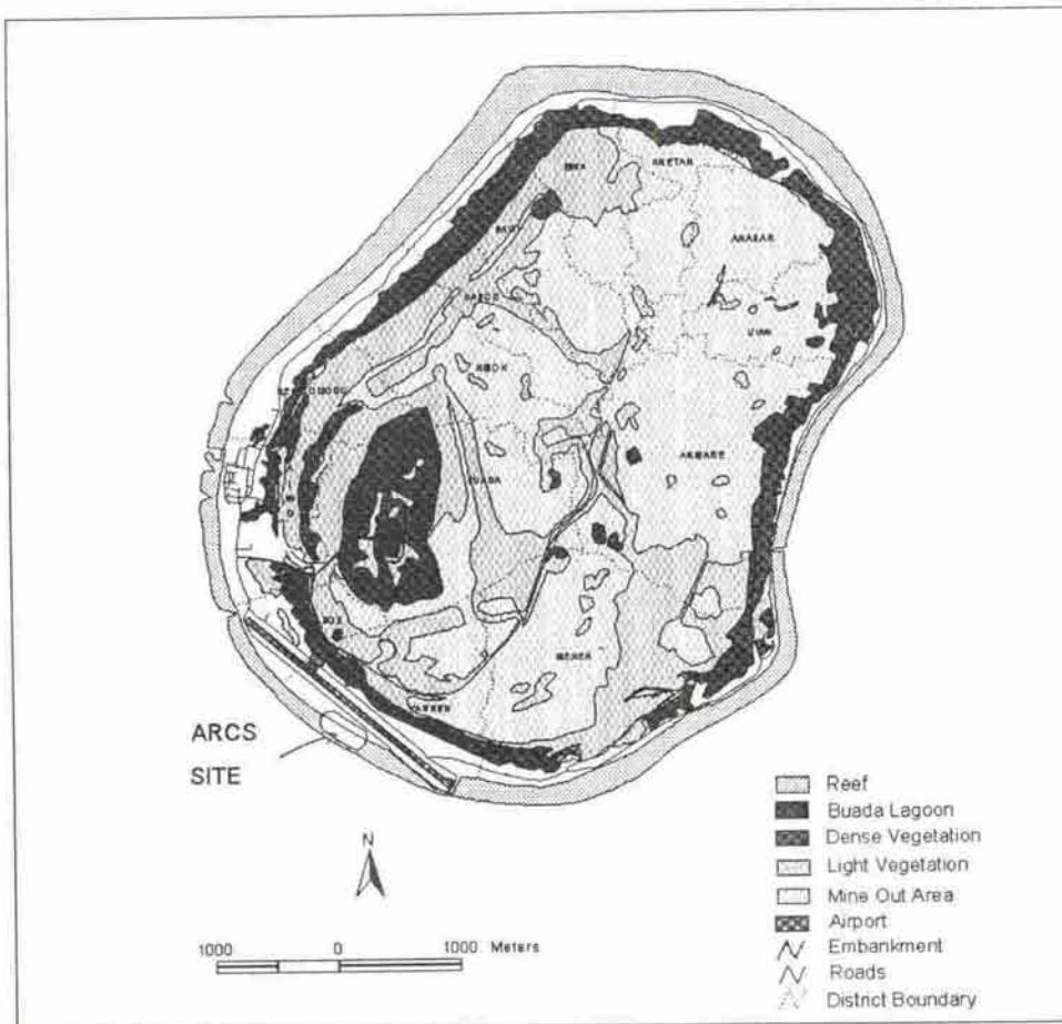
Figure 2.1: Map of Nauru

Should the ARCS be used as a basis for a Meteorological Service some additional instrumentation and operators will be required. This will be the responsibility of the Nauru Government. The ARM Program will assist in this effort and a cost efficient collaboration will be worked out. Any requirements of the ARCS instruments or requirements and use of the ARCS data outside ARM operational research requirements will be the responsibility of the Meteorological Service. ARM will collaborate within its charter to assist in these areas as well. Basically the ARM and Meteorological Service working together can serve both functions in a cost effective manner.