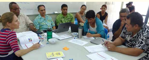
Members of the Environmental Monitoring and Governance Division of SPREP during a planning session