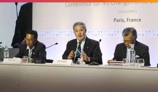
Prime Minister of Tuvalu with the President of Palau (left) and the Prime Minister of the Cook Islands (right) at a Pacific Press Conference at the COP21