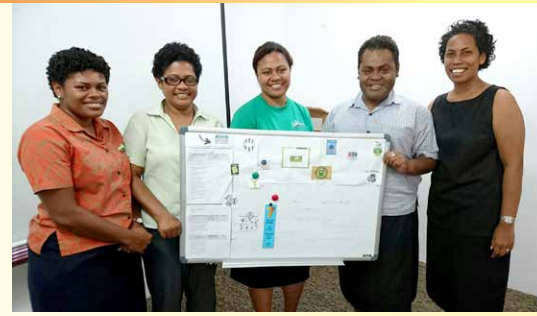
Coordinators of the Clean, Green Unit Competition

“Our plan is to open this up to other Government Ministries, right now we are starting small and making sure our good environment practices are cemented first. We look forward to the results of this year!”