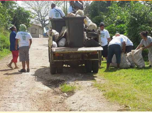
Community garbage collection system, Vava'u, Tonga