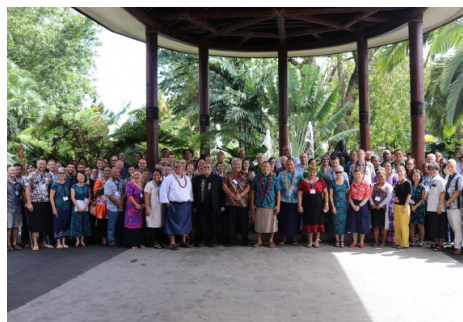
8TH PACIFIC ENVIRONMENT FORUM FOCUSES ON TACKLING PLASTIC