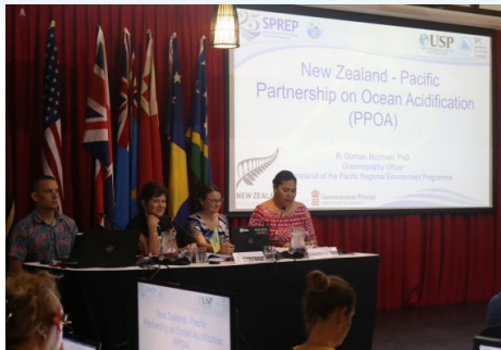
ACCELERATING ACTIONS TO ADDRESS OCEAN ACIDIFICATION IN THE PACIFIC