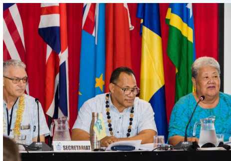
SAMOA APPOINTED NEW CHAIR OF 29TH SPREP MEETING