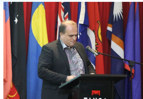
WALLIS AND FUTUNA'S INNOVATIVE ECOLOGICAL TAXATION