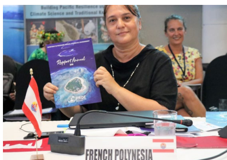
SPREP ACHIEVEMENTS HIGHLIGHTED IN 2018 ANNUAL REPORT