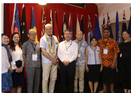
GUIDELINES FOR DISASTER WASTE MANAGEMENT IN THE PACIFIC TO BE LAUNCHED IN 2020