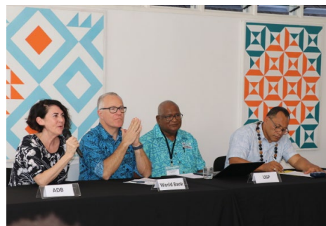
A PARTNERSHIP FORMED FOR ENVIRONMENTAL SAFEGUARDS WILL BENEFIT THE PACIFIC REGION