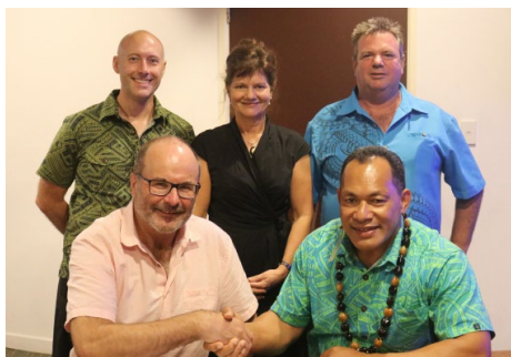
NEW ZEALAND DEPARTMENT OF CONSERVATION BOOSTS REGIONAL RESPONSE TO INVASIVE SPECIES