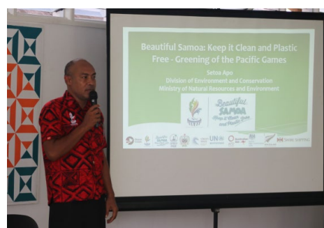
SAMOA LEAVES A LEGACY FOR THE GREENING OF FUTURE PACIFIC GAMES