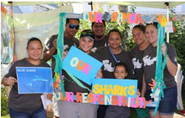
The team from SPREP, MNRE and the Samoa Conservation society who organised the outreach.

'Our Sharks, Our Samoa, Our Responsibility' was the core theme of a campaign launched that saw a commitment from over 150 people to protect sharks within Samoan waters during the Alo Paopao International Paddling Festival in August. Held annually in Samoa, the event also draws a large number of supporters and families. They along with the paddlers participated in a number of special family activities to promote the importance of sharks in our oceans.