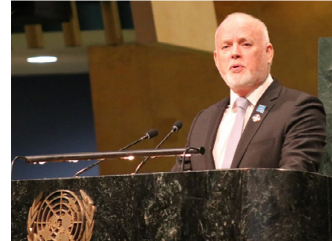
H.E. Ambassador Peter Thomson, President of the UNGA.

'Human induced problems have human devised solutions.' That's what the president of the current session of the United Nations General Assembly and Fiji's Ambassador to the UN, Peter Thomson, said in his opening address at the start of the first ever UN conference on Oceans in New York last month.