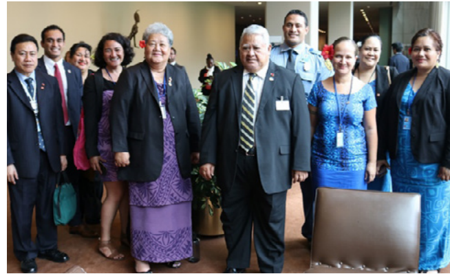
Samoa delegation at the UN Ocean Conference.

Samoa has registered 12 Voluntary Commitments under Sustainable Development Goal 14 (SDG14) at the UN Ocean Conference in New York. These include Samoa's Community-based Fisheries Management Programme which aims to ensure the long term sustainability of coastal fisheries resources for food security and livelihoods of coastal village communities through the empowerment of communities.