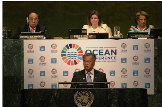
Prime Minister of the Cook Islands, Hon. Henry Puna.

While the Cook Islands may be a land area of only 237