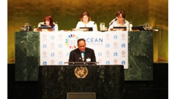
Kiribati Fisheries Minister Tetabo Nakara.

Pacific countries continue to raise their voices on their struggles to obtain suitable and equitable return from their tuna resources. For a small island nation like Kiribati with a population of just over 110,000 revenue from tuna provides 80 percent of government's earning. From a relatively modest base of AUD$29.5 million in 2009, the figure climbed to AUD$141.6 million in 2014. For 2015, government expected the earning to be well above the AUD$200 million dollar mark.