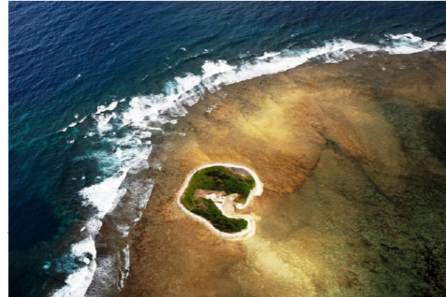
Nu'utele Island, Falefa Bay, Samoa

The Cook Islands has growing support in its call to explore the rights of the ocean as a legal person, during the UN Ocean Conference in New York last month. At the very first UN conference focussed on bringing the world together to achieve Sustainable Development Goal 14: Life Below Water, the island nation of the Cook Islands amplified its appeal for the Ocean to have legally enforceable rights to "exist, flourish and evolve".