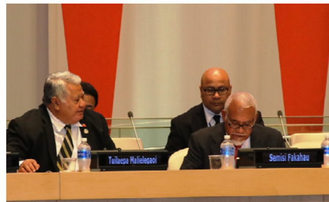
The Kingdom of Tonga, a co-host of the event.

Discarded or abandoned fishing gear, also known as ghost gear, is responsible for at least one-tenth of all marine debris. It is four times more deadly to marine animal life than all other forms of marine debris combined, according to Pacific island leaders. At the UN Ocean Conference in New York, the Global Ghost Gear Initiative, an alliance of partners committed to tackling this challenge, was showcased with a special event led by the Kingdoms of Tonga and Belgium, in association with the World Animal Protection Society.