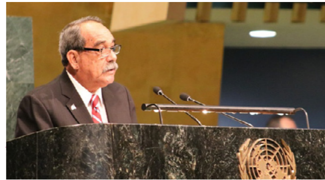
H.E. President Peter Christian of the Federated States of Micronesia.

The Federated States of Micronesia (FSM) and Marshall Islands have used the UN Ocean Conference held in New York to amplify their long-standing concerns about nuclear contamination and pollution from World War 2 wrecks. President Peter Christian of FSM said nuclear contamination is a serious threat for small island countries in the north Pacific because of claims that the fall-out from the nuclear tests conducted in the Marshall islands may have reached as far as Palau.