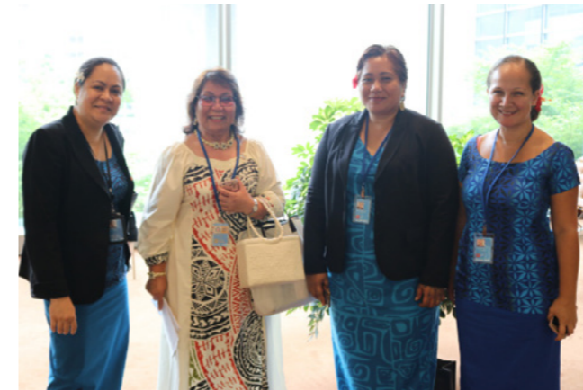
Members of the Samoan delegation to the UN Ocean Conference in New York.

Samoa had two key messages for world leaders attending the