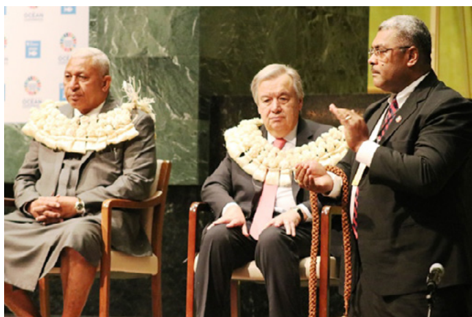
L-R: Prime Minister of Fiji, Voreqe Bainimarama, Secretary General of the United Nations, António Guterres, Sai Navoti