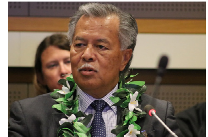
Hon. Henry Puna, Prime Minister of the Cook Islands.

The Cook Islands event hosted in partnership with