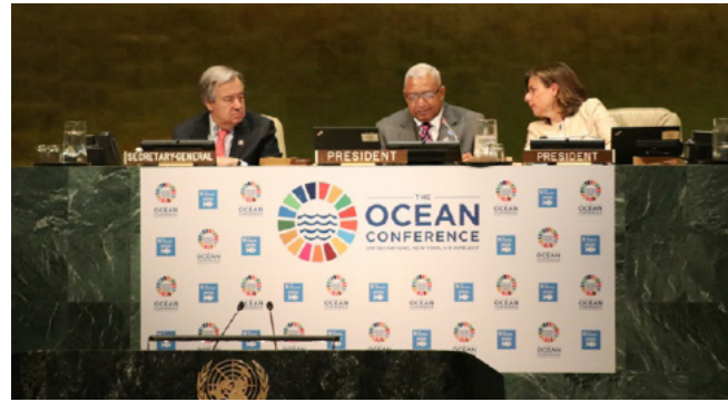
Prime Minister of Fiji, Voreqe Bainimarama, (middle) co-host of the UN Ocean Conference.

The first global oceans conference in New York opened with messages of optimism and hope that all countries will mobilise its 7.5 billion citizens to take up the global fight to improve the quality of the world's oceans. He urged world leaders and delegates and other stakeholders present in New York last month to stop the degradation of the world's oceans and roll back the tide of neglect and preserve marine resources for the future generations to come.