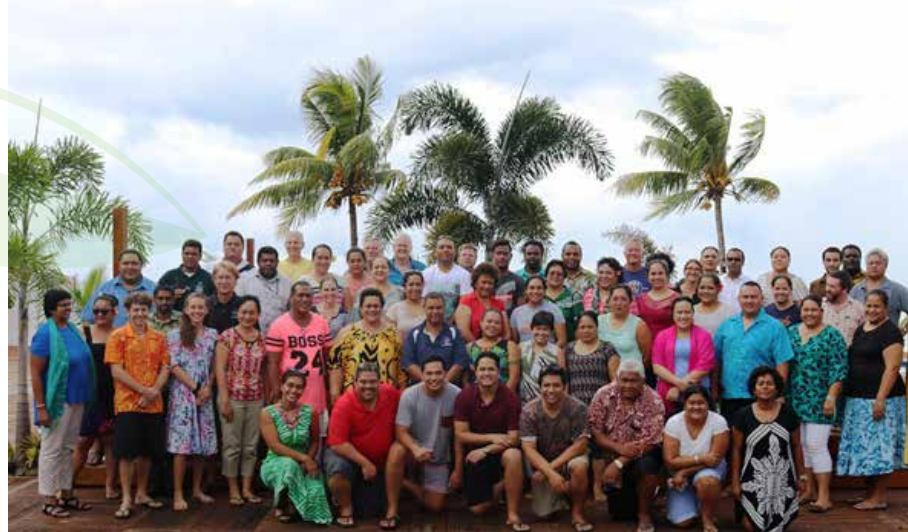
SPREP Advance, March 2017

To end my brief note, we'd also like to congratulate FSM who had their USD 9 Million Dollar Adaptation Fund Project approved. This will greatly help FSM strengthen resilience to climate risks.