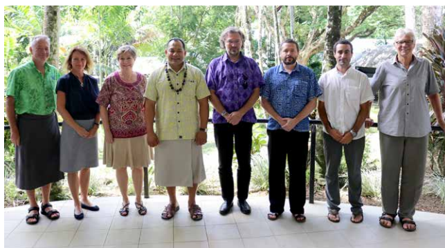
The Norwegian delegation with SPREP staff at the SPREP headquarters, Vailima.