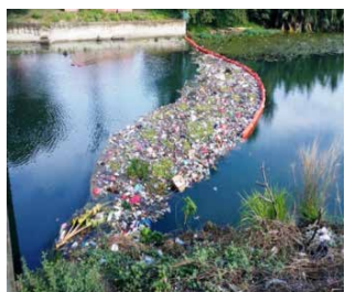
Waste collected by a boom placed in Mataniko River, Solomon Islands.