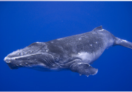
Whale watching in Niue.