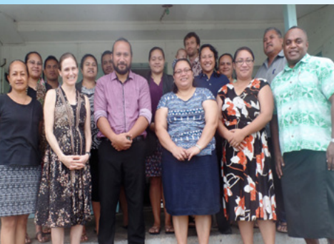
Participants of the Environmental Impact Assessment Training in Niue.