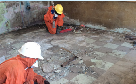
Damaged asbestos flooring materials are safely removed at a building adjacent to the site of the fire.