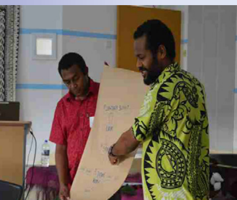
Discussions underway at the two-day workshop held in Port Vila, Vanuatu.