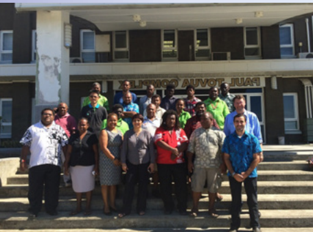
Participants of the first National Drought Policy Workshop and Consultations in Solomon Islands.