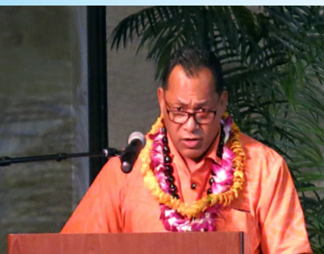
SPREP Director General, Kosi Latu.