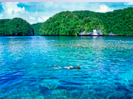
Marine Protected Area, Chelbacheb, Palau.