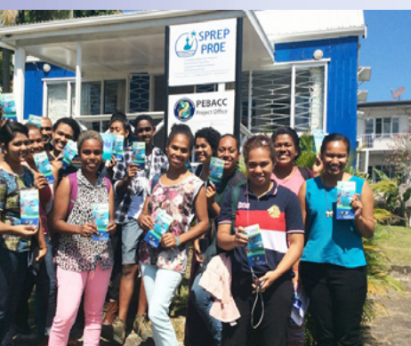
The students of FNU outside the SPREP Suva office.