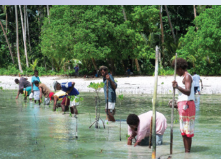
Ngawawa Village, Solomon Islands.