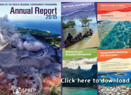
The 2015 SPREP Annual Report