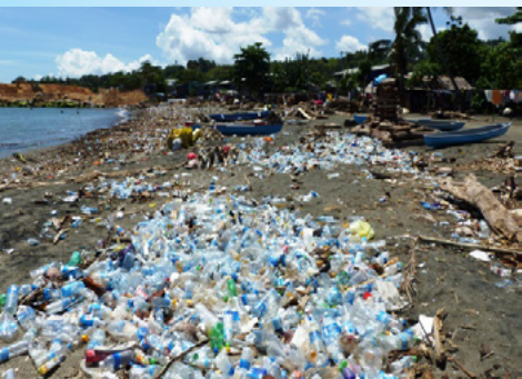
Plastics comprise between 60 and 80 percent of the marine debris in all of the world's oceans.