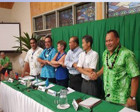
Signing of the Regional Cooperative Framework for J-PRISM II at the 27th SPREP meeting.