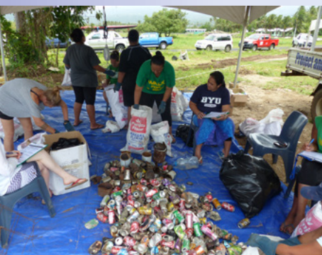
Volunteers sorting through the rubbish collected during the cleanup.