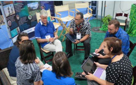
Discussions on Ecosystem-based Adaptation to Climate Change.