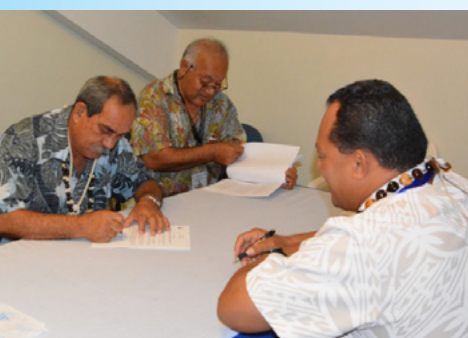
Signing of the Host Country Agreement in the Federated States of Micronesia.