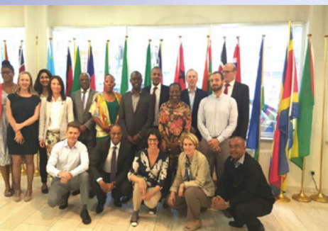
Members of the Programme Steering Committee in Brussels.