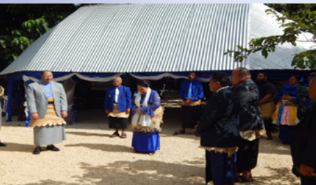
His Majesty King Tupou VI and Her Majesty Queen Nanasipau'u during their visit to Toloa Rainforest.