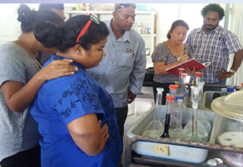
Participants at the Best Practice Chemical Management Training in Kiribati undertake an inventory exercise.