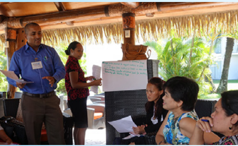
Delegates in session at the Clean Pacific Roundtable in Suva.