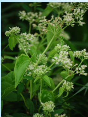
Mikania micrantha plant.