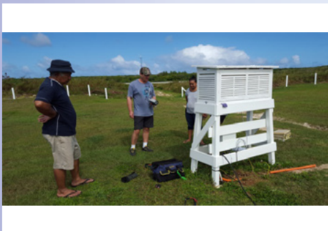
Installing the sensor for the iSTARAWS.