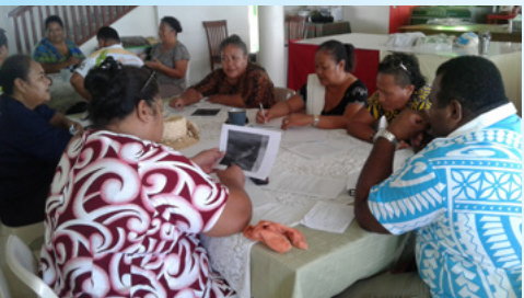
Participants taking part in group discussions.