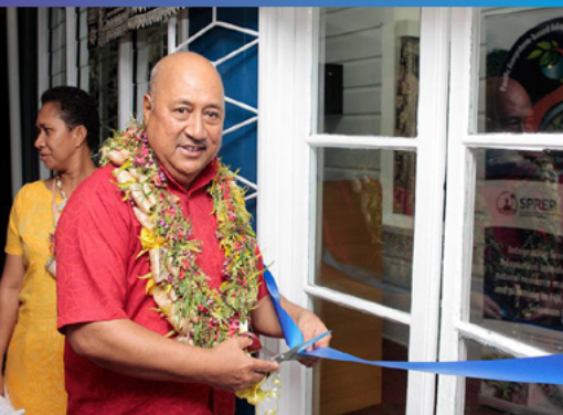
Fiji's Foreign Affairs Minister, Hon. Ratu Inoke Kubuabola, cutting the ribbon to officially open the SPREP office.