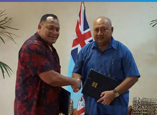
SPREP Director General, Kosi Latu and Fiji Government's Minister for Foreign Affairs, Hon. Ratu Inoke Kubuabola, at the signing of the agreement in Suva.