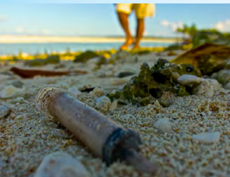
The provision of the PacWaste incinerators will improve the proper disposal of healthcare waste across the Pacific.