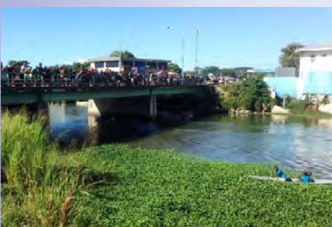
Canoe races on the Mataniko River.