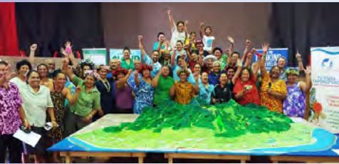
Participants of the first P3DM training in Vaka Puaikura.