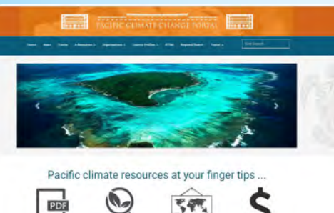
The new and improved Pacific Climate Change Portal.