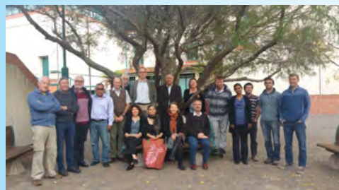
Participants of the PIP Annual Meeting in Auckland, New Zealand.