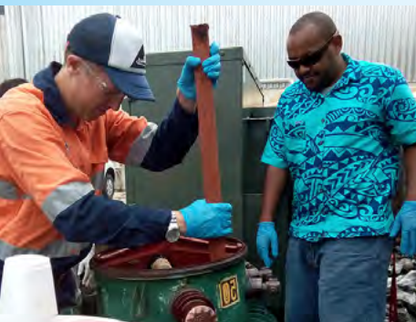
Conducting the PCB training.