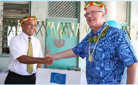
European Union Commissioner for International Cooperation and Development, Mr. Neven Mimica, at the hand over of healthcare waste incinerators to Tungaru Central Hospital.