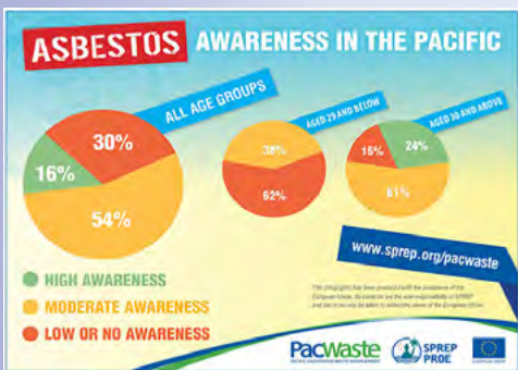
A summary of the results of the Asbestos Awareness Survey.