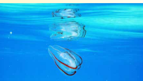
Ctenophore Comb Jelly: the Mnemiopsis leidyi is a species of Comb Jellyfish introduced into the Black Sea through ballast water and is now a marine invasive species.