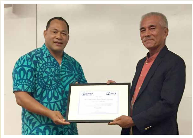
H.E. President Tong delivered the opening keynote address at the special post-COP21 Pacific Climate Change Conference in Wellington, New Zealand.

and it was here that we recognised him for his unwavering commitment and global leadership in defending the Pacific islands region and Small Island developing States against climate change issues that threaten island nations. He also championed the Pacific Oceanscape Framework, the regional mechanism which allows for sustainable multiple uses and management practices, which was adopted in 2012.