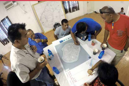
Nauru MSP training participants at work defining values in their marine environment.