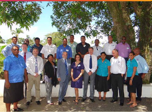
Group photo of participants at the Regional Workshop of the London Protocol in Suva, Fiji.