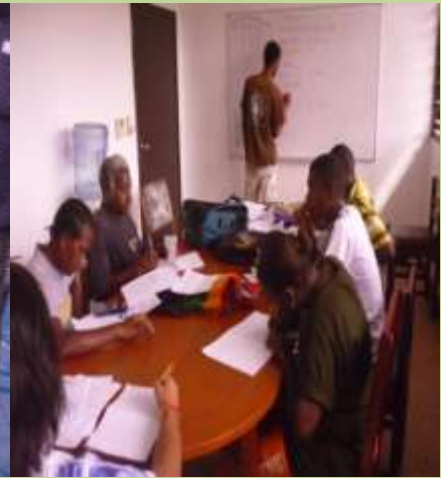
Analyzing waste data records