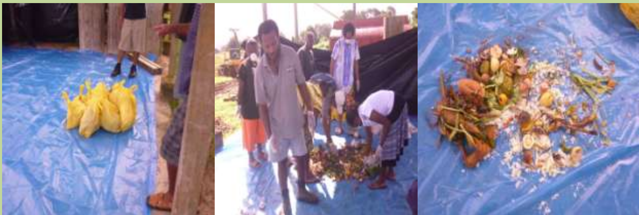
Collection of waste trash bags

The yellow trash bags from the selected households were collected daily and then transported to Bouffa landfill for analysis. At Bouffa the trash bags were weighed to determine daily waste generation rate, composition and density.