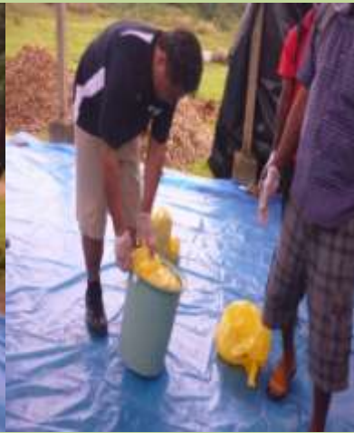
determining density of waste disposed