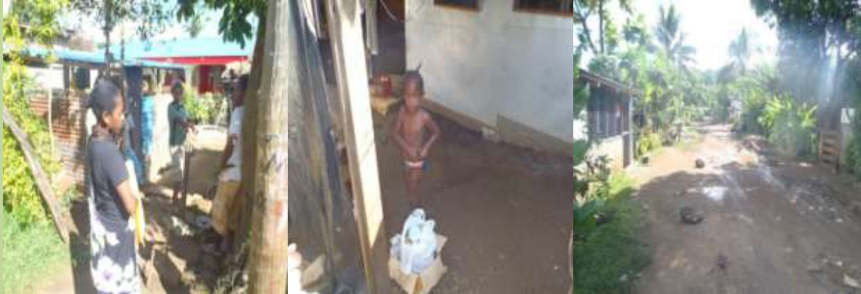
Survey briefing to household members

The ten randomly selected households were interviewed and briefed on collection schedules. Refer to attached copy of questionnaire used for the survey in annex II.