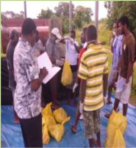
Recording of waste generation weights