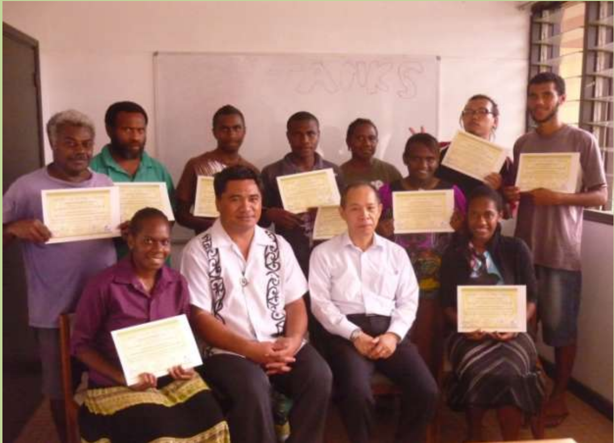
Participants with their certificates at the Department of Environmental Protection and Conference room, Port Vila