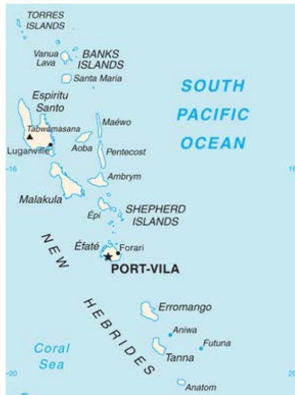
Figure 1 – Map of Vanuatu

A map of Vanuatu is shown below in Figure 1.