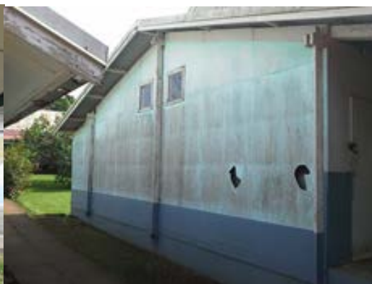
Photo 10 - Malapoa College