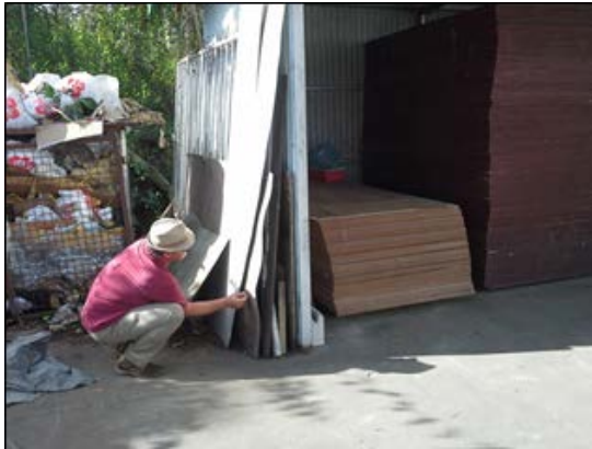
Photo 4 shows AC cladding on the Ministry of Land and Natural Resources building at Port Vila. The AC sheeting was confined mostly to the outside gable and soffits, although limited quantities were also used as wall cladding.

Photo 3 below shows an AC sheet at the entrance to a Chinese Hardware Store (MOK 3) in Elluk Rd. The shop manager had previously reported that he sometimes sells asbestos cement sheeting but that he did not have any in stock at the moment. The above panel was then found and sampled.