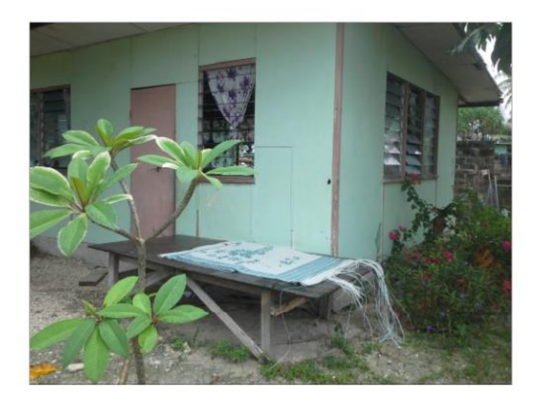
Photo 1: typical structure in Funafuti showing fibre board cladding

The majority of residential dwellings observed on Funafuti were constructed using plywood or fibre board, concrete blocks and corrugated iron, but fibre board external walls were the dominant type. Photo 1 shows a typical building in Funafuti. Most shade houses were constructed using traditional materials consisting of tree branches as the pillars and woven palm fronds as the roof cladding.