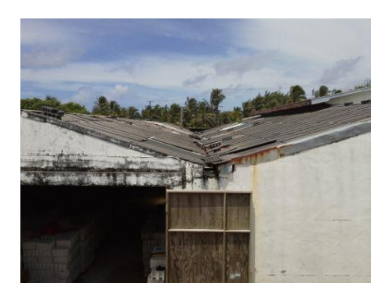
Photo 4: Damaged asbestos roof cladding at the Majuro Japan Construction Co.