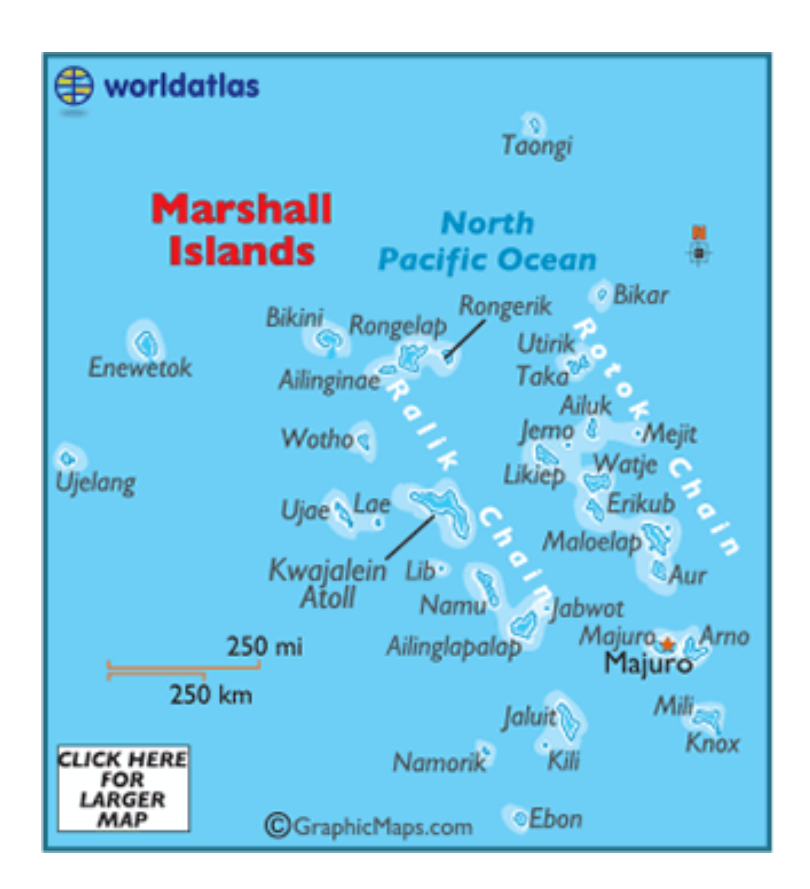
Figure 1 - Map of RMI

Politically, the Marshall Islands is a presidential republic in free association with the United States, with the US providing defense, subsidies, and access to social services. The country uses the United States dollar as its currency. The majority of the citizens of the Marshall Islands are of Marshallese descent, though there are small numbers of immigrants from the Philippines and other Pacific islands. The two official languages are Marshallese and English.