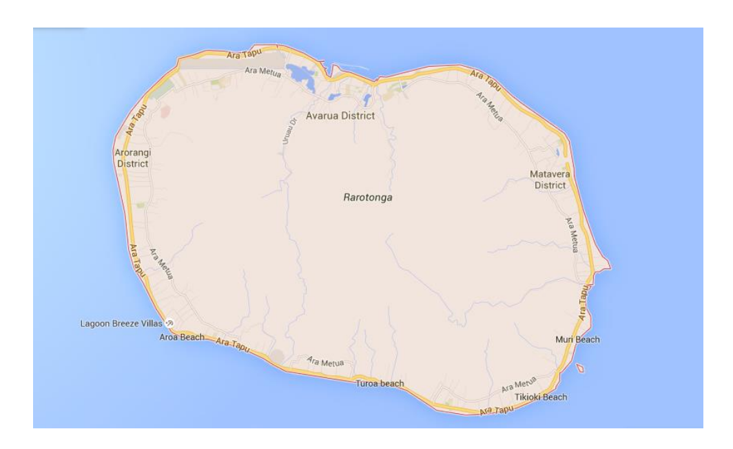
Figure 2 - Map of Rarotonga