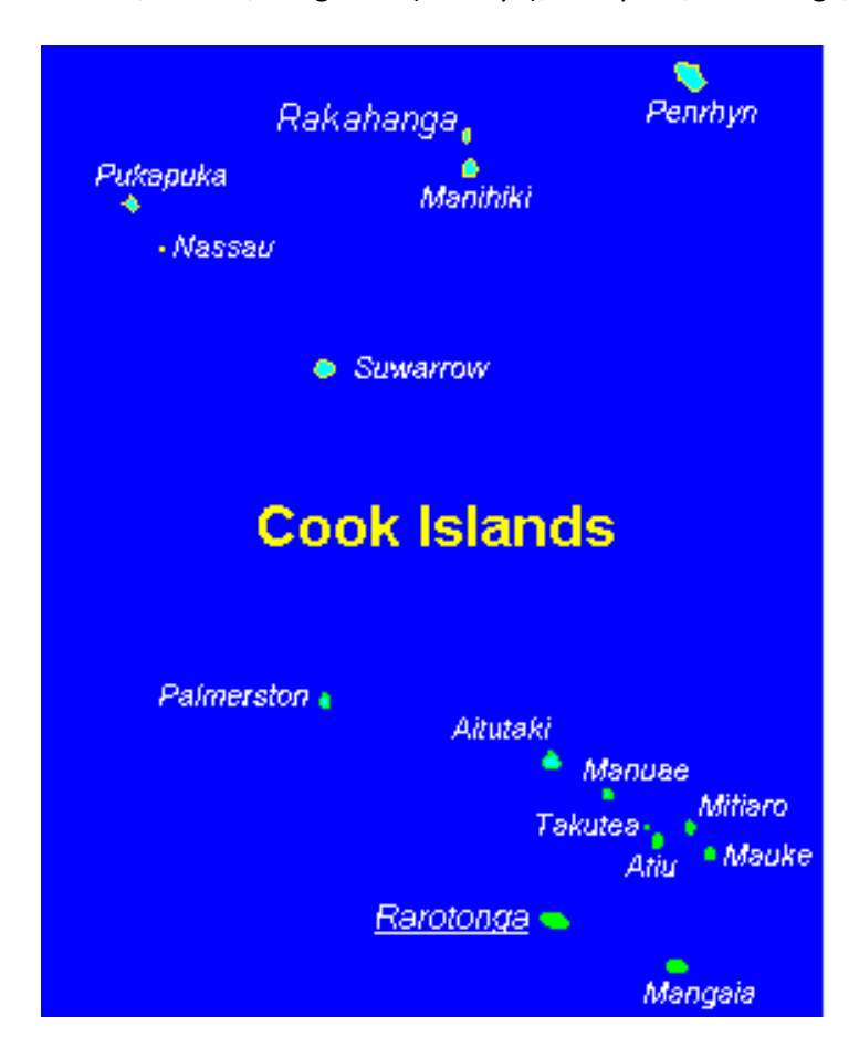
Figure 1 – Map of the Cook Islands

Northern Group - Manuhiki, Nassau, Tongareva (Penrhyn), Pukapuka, Rakahanga, Suwarrow