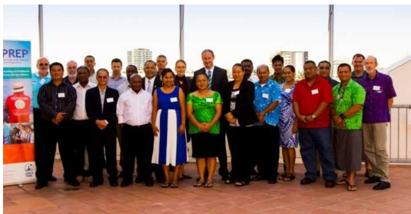
Figure 3. PACPOL Workshop attendees, Brisbane, Australia, October 2014

This third version of PACPOL for 2015–2020 was developed with funding from the International Maritime Organization (IMO), primarily through the hosting of a specific PACPOL Workshop held in Brisbane, Australia in October 2014. The five-day Workshop was attended by 13 PICTs and provided an opportunity for stakeholders to consider the outcomes of PACPOL 2010–2014 and the issues relating to marine pollution that required the most urgent attention in each country and the region. Representatives from Australia, New Zealand and the Secretariat of the Pacific Community also participated in the Workshop, with presentations on relevant issues provided by the Great Barrier Reef Marine Park Authority, Great Barrier Reef Foundation and Commonwealth Department of the Environment. In addition to sessions discussing progress with specific items in the existing PACPOL, the Workshop was provided with information on the new IMO Integrated Technical Co-operation Program Thematic Priorities for 2016-17 (including the need for IMO Country Maritime Profiles) (see Appendix 5), the IMO Wreck Removal Convention and relevant parallel programmes, such as the SPC Transport Services Implementation Plan, the Global Partnership on Marine Litter and the Shipping Related Invasive Marine Pests in the Pacific (SRIMP-PAC).