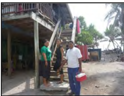
Water Quality surveyors contracted under PACC

The PACC project works closely with the Health Department in assessing the quality of water at the pilot site, Lofeagai. The project has engaged eight Red Cross volunteers to do the baseline data collection with the kind assistance