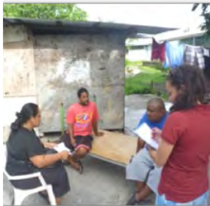
PACC team out in the field

The PACC Project Management Unit staff from the Water Sector countries attended a week long Socioeconomics Assessment (SEA) PACC Training held on the 15-19 Nov 2010 at the Marshall Islands. The objective of the training was to introduce the SEA-PACC and its linkages to the Vulnerability and Adaptation (V&A) process, provide the climate context for the SEA-PACC; introduce the SEA-PACC indicators, and engage the participants in group discussions discussing the process, indicators and analysis, and the 'how to' of carrying out the surveys. Participants to the RMI SEA PACC training comprised of Nauru, Niue, RMI, Tonga and Tuvalu. Joining the PACC team was the IWRM Regional coordinator Marc Wilson and