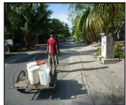
Communities carry water from community reservoir to homes

Finally, PACC will engage SOPAC in compiling the whole report.