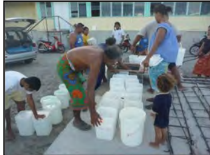
Communities rationing their water supply

The current situation now and it is reality, tanks are drying out, people are flocking by the door step of the Public Works Department queuing to get the first opportunity to buy water, people queuing up at community and church reserves every morning and afternoon to get a portion of water for the day. The National Disaster committee are meeting up so very often to think of other