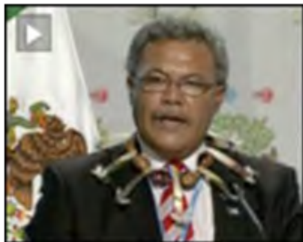
Deputy Prime Minister and Minister for Foreign Affairs and Environment, Mr. Enele Sopoaga at Cancun, Mexico

The Tuvalu delegate to the Climate Change meeting in Cancun made it clear to the international community that small island states such as Tuvalu remains a scapegoat of the industrialized and developed countries and delegates also specified that “we cannot be afford to be held hostage.....by political backwardness” when speaking of the hottest term in Cancun “Climate Change”