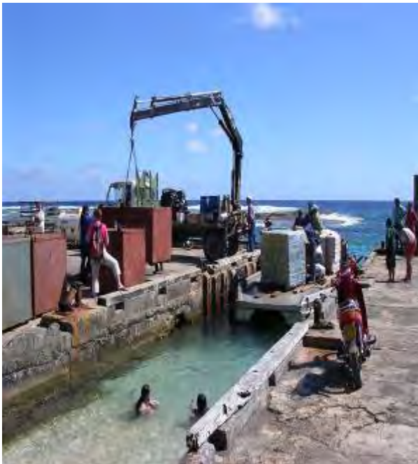
Plate 1 Prior to 2005