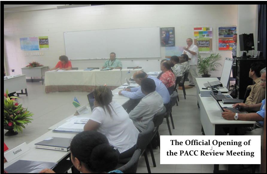
The Official Opening of the PACC Review Meeting