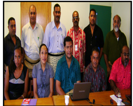
PACC Technical Team first meeting