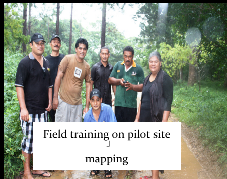
Field training on pilot site mapping