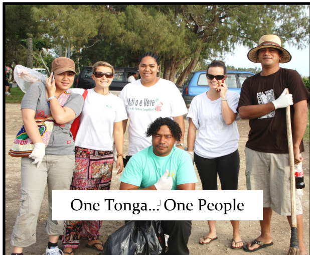
One Tonga...! One People