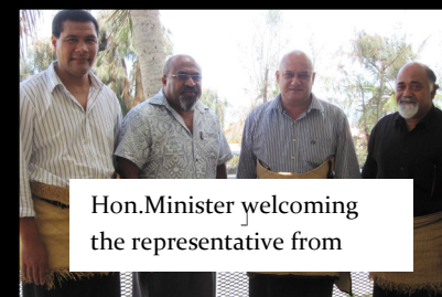
Hon. Minister welcoming the representative from