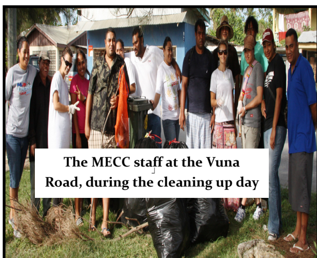
The MECC staff at the Vuna Road, during the cleaning up day

PACC project promote on the Opening day the important of adaptation and resilience to climate change issues. Officers from PACC PMU provide information for students and for public, the major role of PACC project that deal with the community due to climate change. Reports and brochure were also given out for public as for more details on PACC activities and update