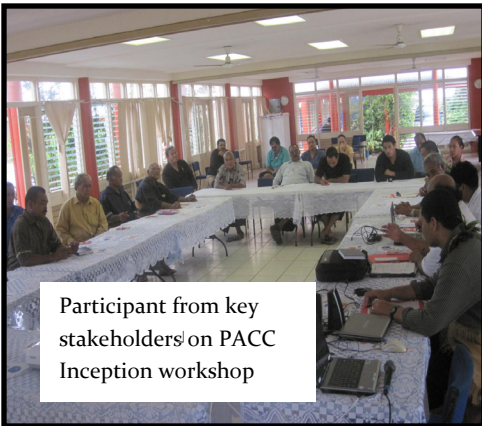
Participant from key stakeholders on PACC Inception workshop

NUKU’ALOFA: The PACC Inception Meeting was carried out on the 2nd of March at the Moulton Hall, Free Wesleyan Church in Nuku’alofa.