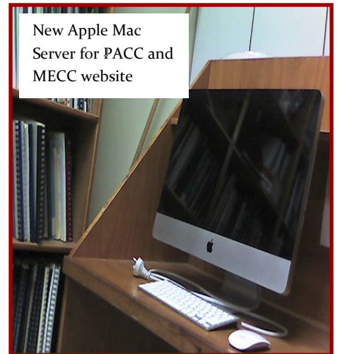
New Apple Mac Server for PACC and MECC website