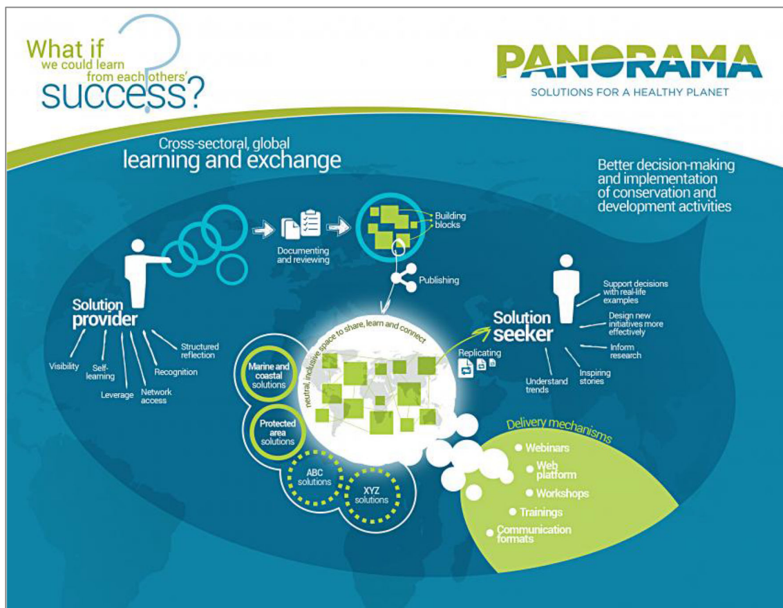
Fig. 1 Schematic illustrating the PANORAMA—Solutions for a Healthy Planet initiative, which implements a solutioning approach via an online web portal, workshops, webinars, and trainings to support protected area management

Psychologists have long embraced Bandura's (1985) theory of social learning, which posits that humans learn best by replicating the behaviors, norms, and beliefs of valued "others." However, as the behaviors become more