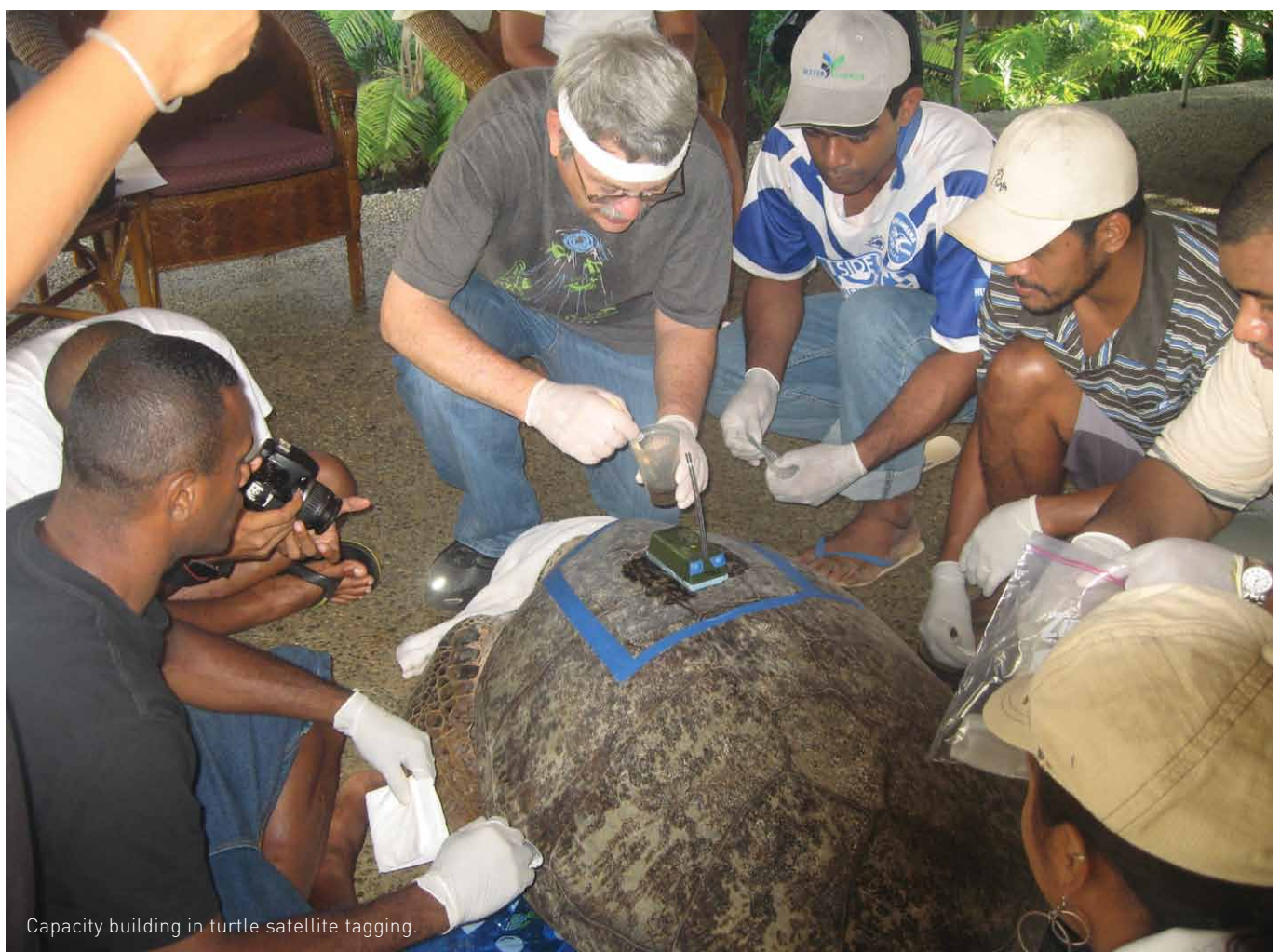
Capacity building in turtle satellite tagging.