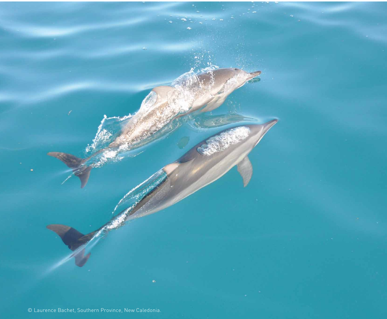
© Laurence Bachet, Southern Province, New Caledonia.