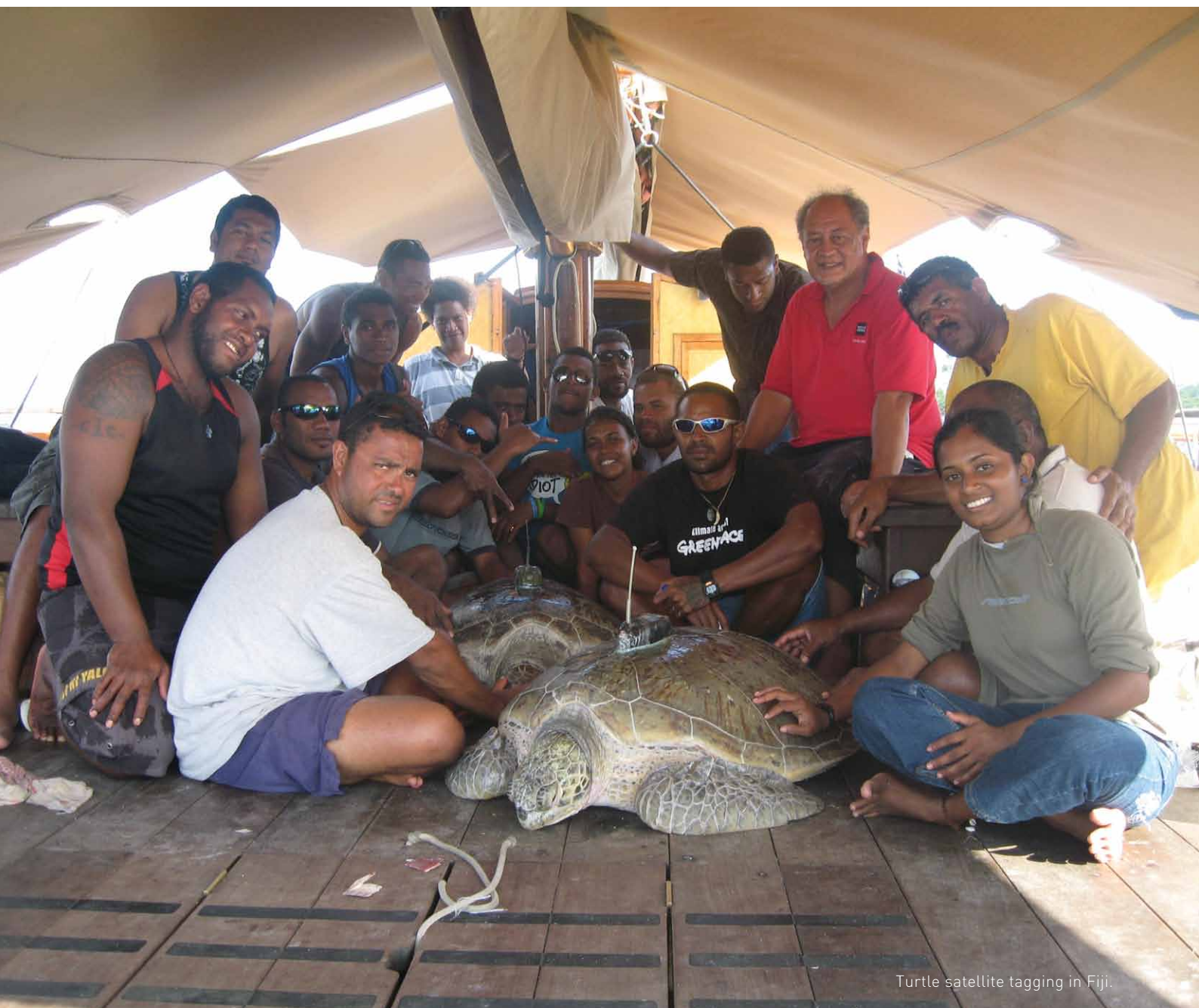
Turtle satellite tagging in Fiji.