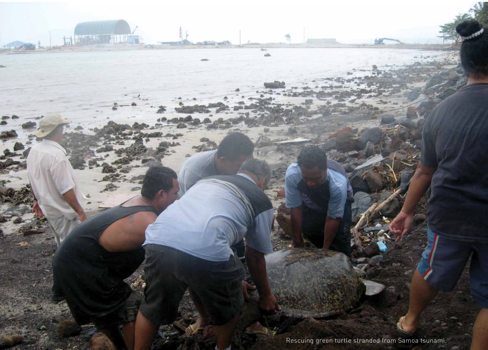
Rescuing green turtle stranded from Samoa tsunami.