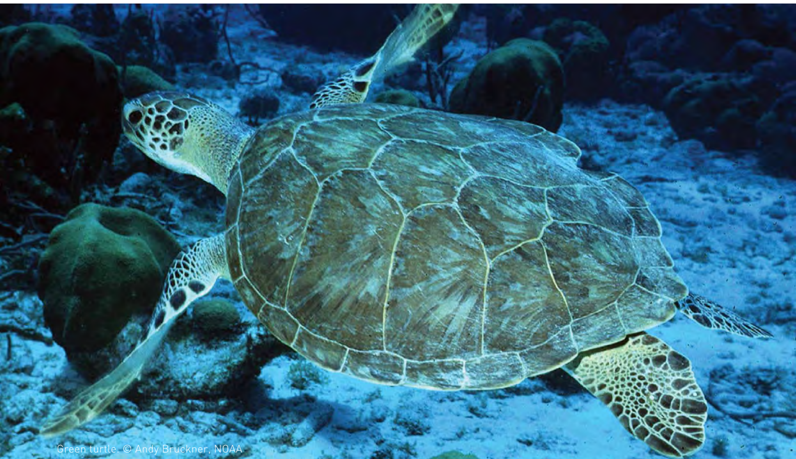
Green turtle.