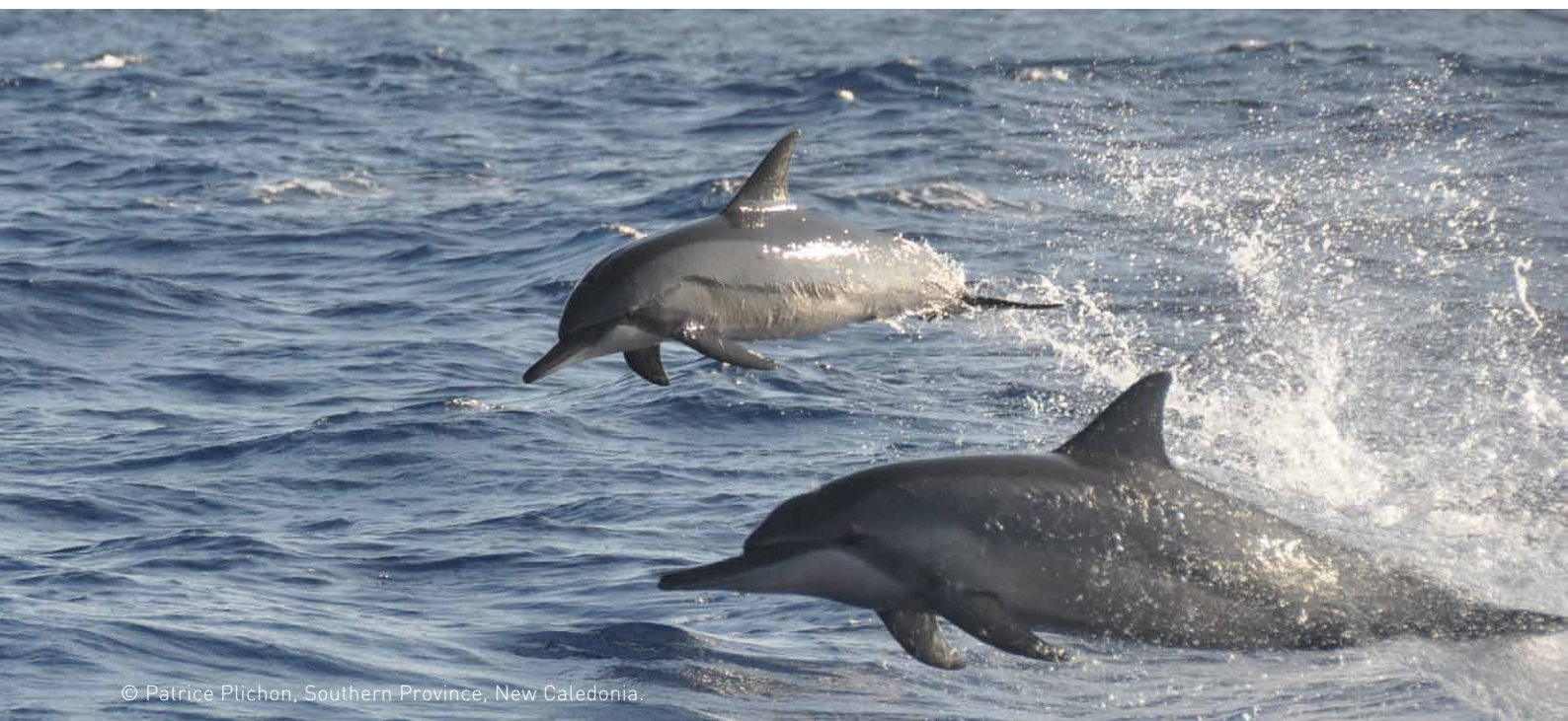
© Patrice Plichon, Southern Province, New Caledonia.