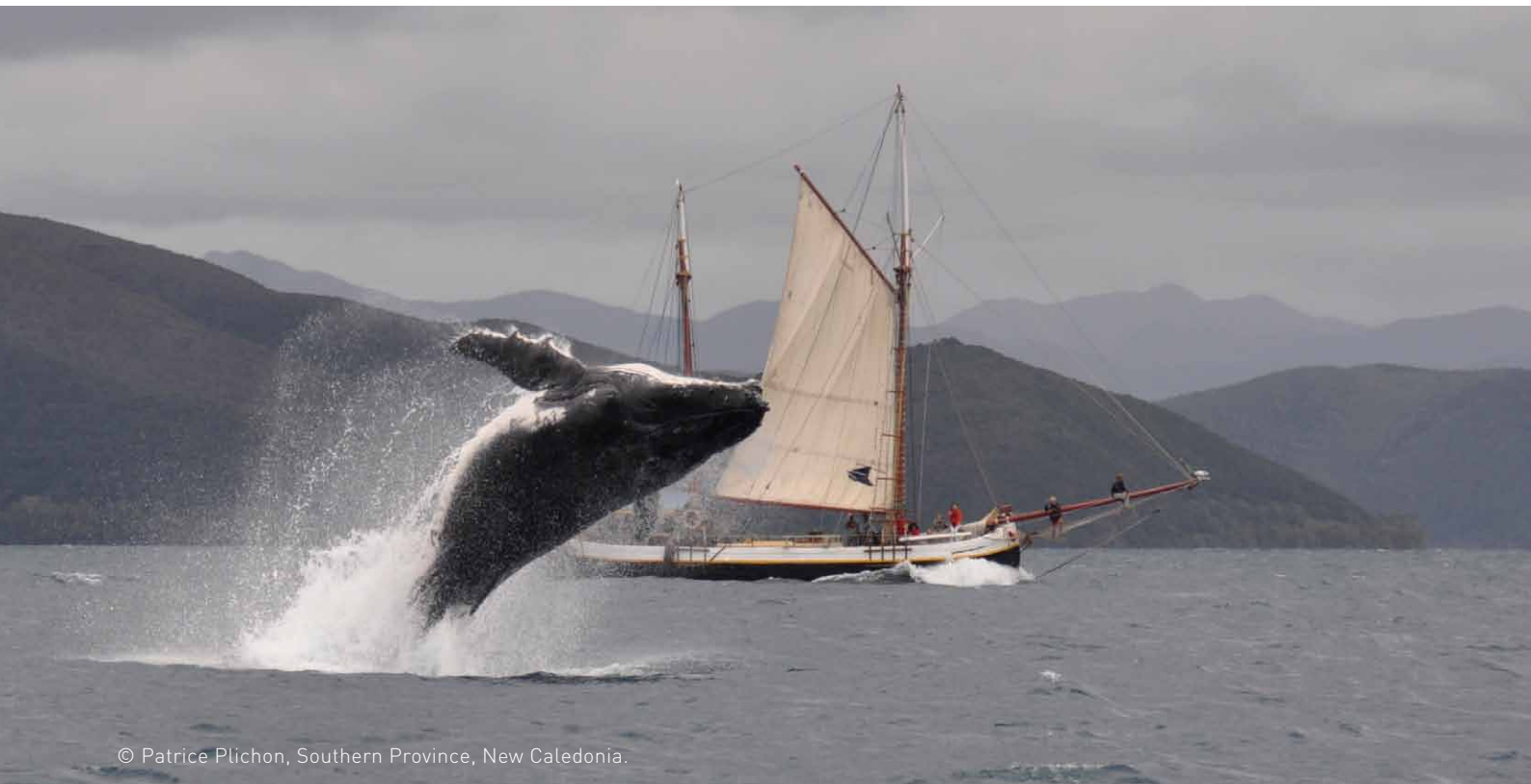
© Patrice Plichon, Southern Province, New Caledonia.