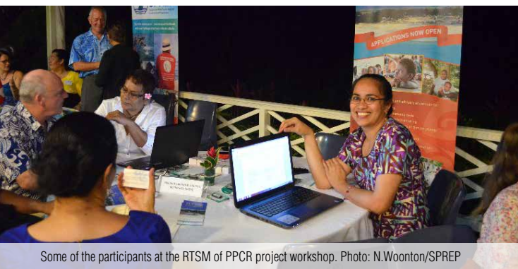
Some of the participants at the RTSM of PPCR project workshop.