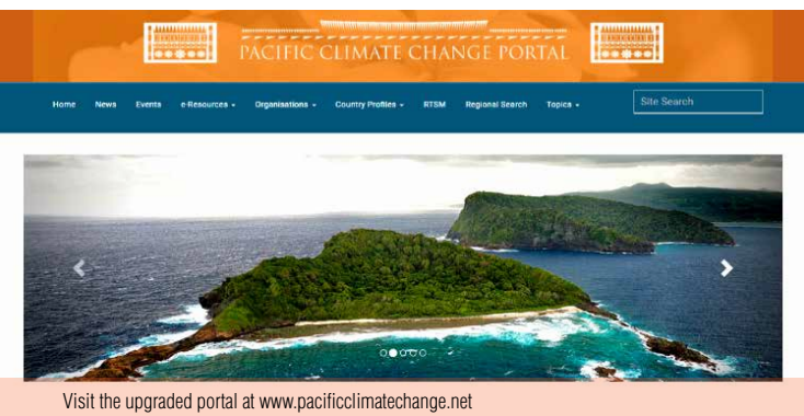
Visit the upgraded portal at www.pacificclimatechange.net