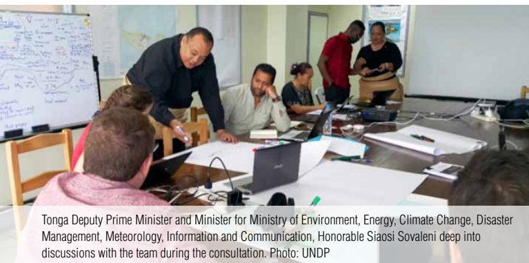
Tonga Deputy Prime Minister and Minister for Ministry of Environment, Energy, Climate Change, Disaster Management, Meteorology, Information and Communication, Honorable Siasoi Sovaleni deep into discussions with the team during the consultation.