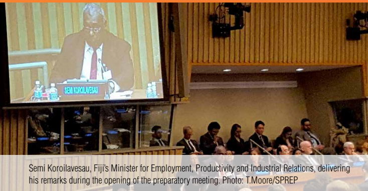
Semi Koroilavesau, Fiji's Minister for Employment, Productivity and Industrial Relations, delivering his remarks during the opening of the preparatory meeting.