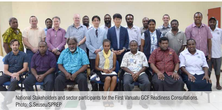
National Stakeholders and sector participants for the First Vanuatu GCF Readiness Consultations.