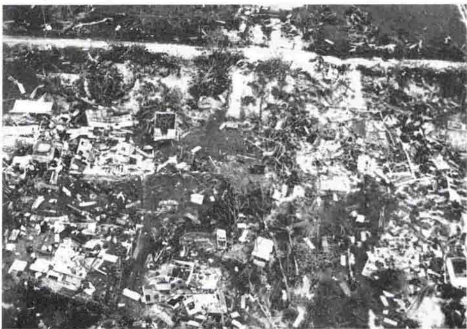
Dwellings not designed to withstand strong winds were blown down (Arutua).

damaged or totally destroyed. Thus the cyclones have shown up, in about half the atolls affected, serious shortcomings in design.