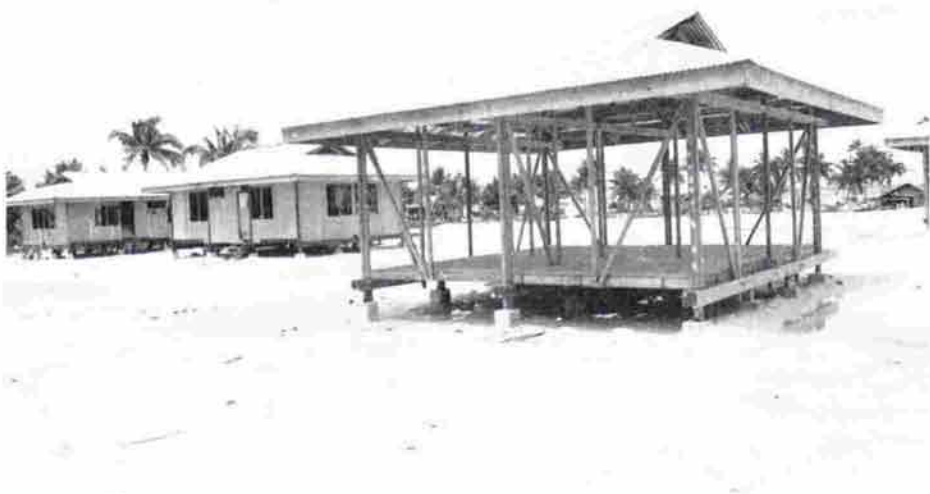
A better designed construction from ATR