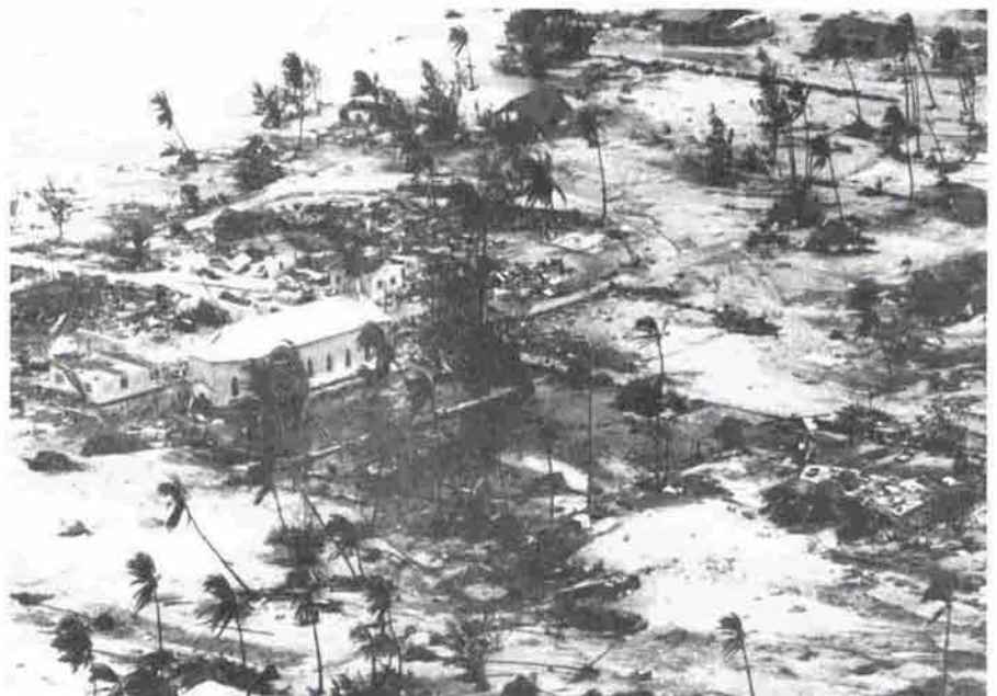
Sand and rubble accumulation in Tuuhora village, lagoon side