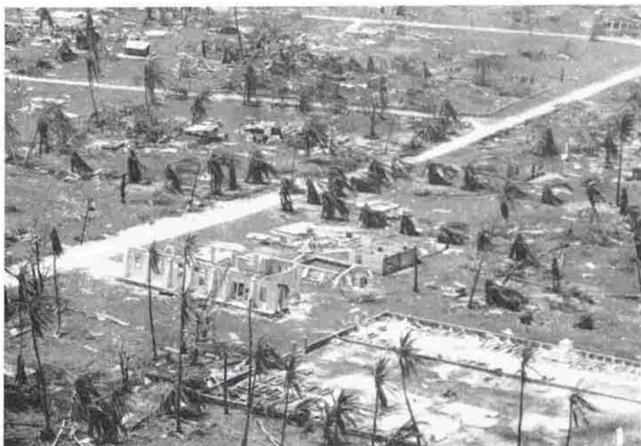
Damaged coconuts, buildings and watertanks (Arutua atoll).

In point of fact, numerous villages were practically wiped out by the combined action of the wind and the sea. It may be estimated that about half the dwellings were totally destroyed by the cyclones. The invasion by the sea resulted in the family watertanks being polluted by salt water. Several administrative buildings and the churches despite their being built of durable materials, often quite recently, were