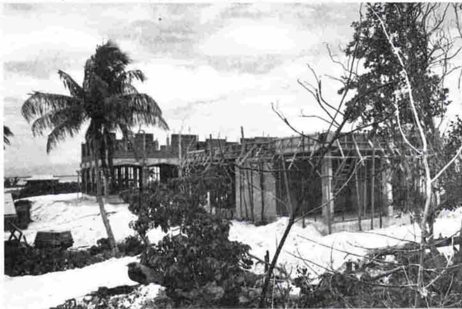
Community shelter being constructed (Anaa). A costly insurance.

lised the regeneration programme which had already been started before the cyclones. Production of copra which dropped considerably at first (a fall of more than 60% compared with 1982) began to rise again rapidly as early as 1984. This recovery of production suggests that the potential was under-utilised before the cyclones.