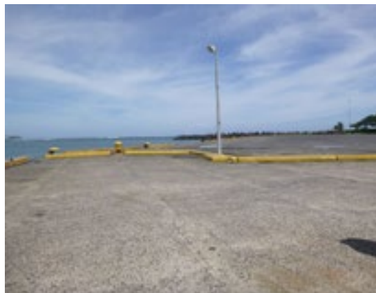
Figure 2c Main wharf and new wharf extension