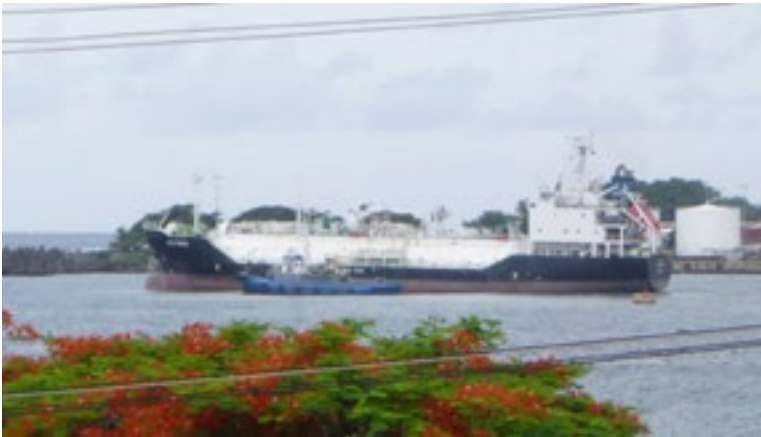
Figure 2f Tanker discharging cargo to subsea pipeline