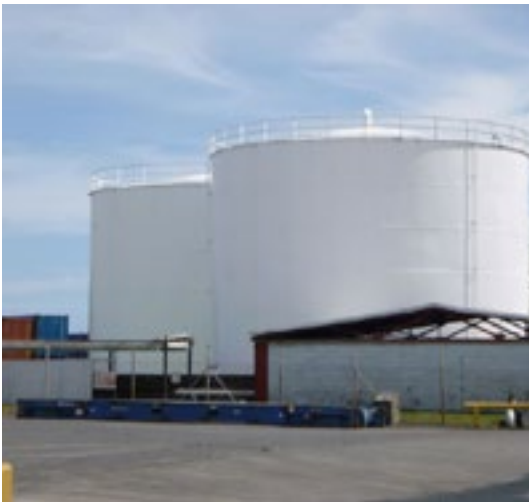
Figure 2g Diesel storage tanks in port