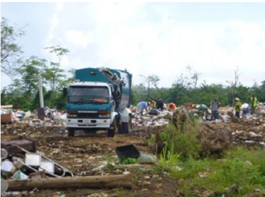
Figure 5 - MNRE Landfill site

Ship's garbage that has been cleared by quarantine is sent directly to recyclers or, for non-recyclable material to the MNRE landfill (Figure 5). MNRE informed us that the landfill site meets Japanese standards but does not meet US-EPA standards. Leachate is collected in evaporation pools near the base of the landfill.