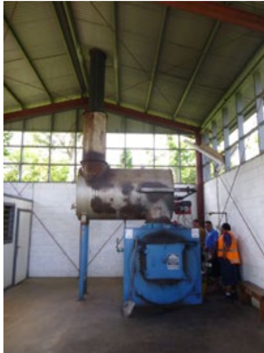
Figure 7 - Medical waste incinerator at MNRE landfill