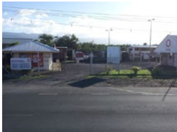
Figure 2h Origin LP Gas Terminal