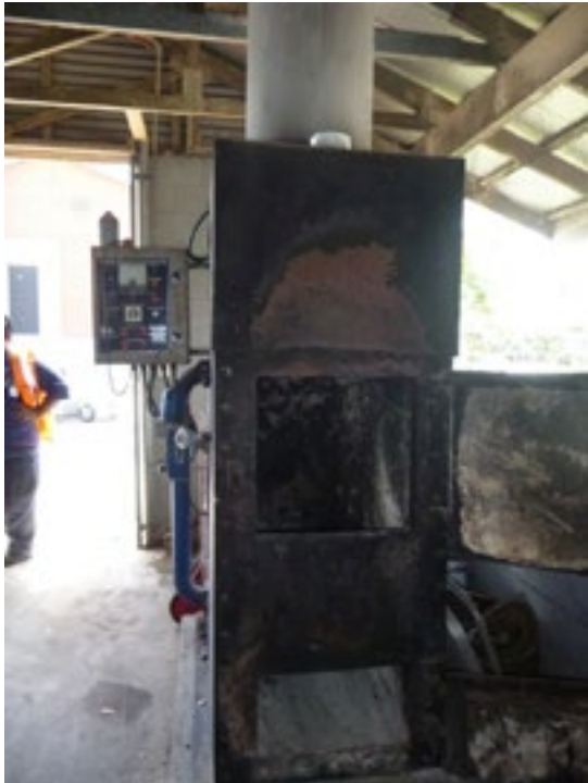
Figure 6 - Quarantine incinerator in port

For garbage that does not receive quarantine clearance and exceeds the Quarantine service's incinerator capacity, there is a deep burial area at the MNRE landfill.