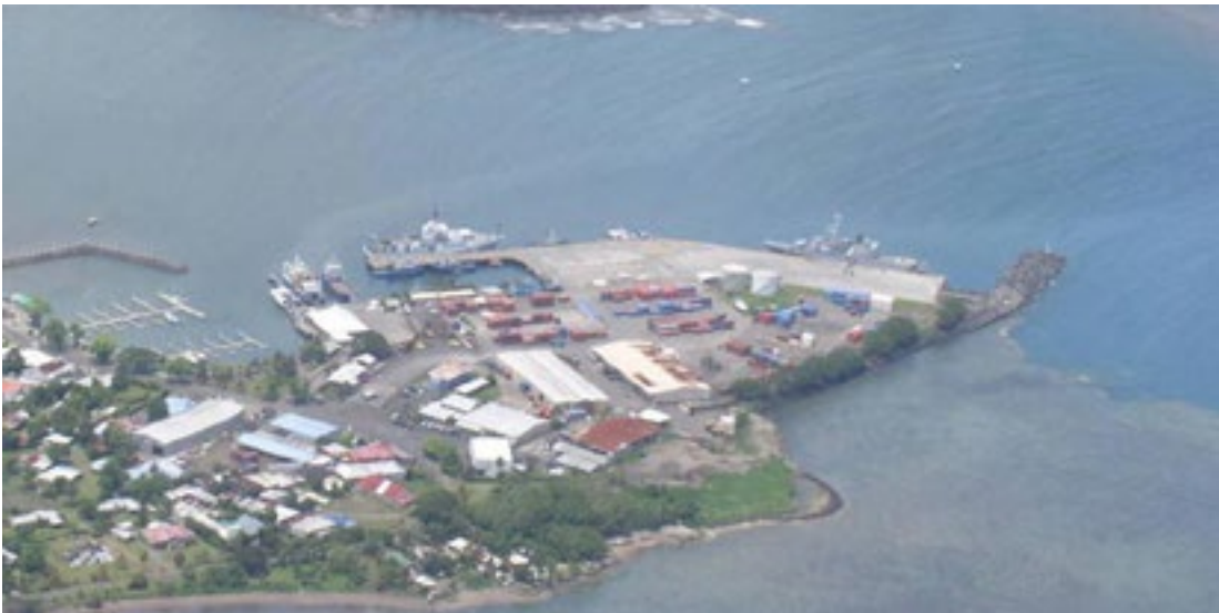
Figure 2a - Aerial view of port and tanker mooring buoys