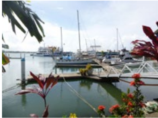
Figure 2d Cargo handling and storage areas Figure 2e Marina adjacent to port