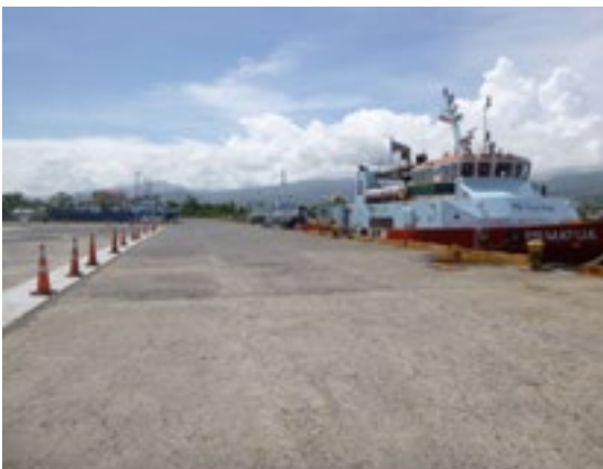
Figure 2b Main wharf area