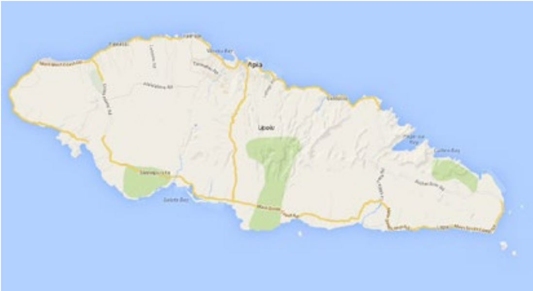
Figure 1 - Island of Upolu, showing location of Apia