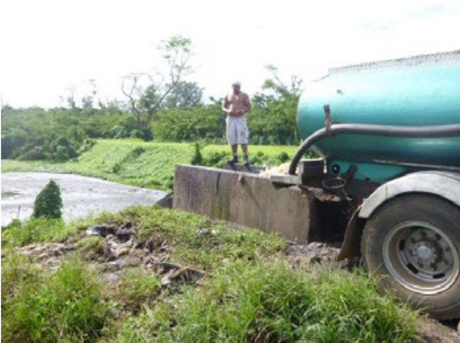
Figure 4 – A 7000L vacuum truck delivering liquid waste (greywater or septic tank water) to the sewage treatment ponds at the MNRE landfill, 26 November 2013.

It is only possible to accept sewage from domestic vessels at this point. Sewage from international ships is considered a quarantine risk, and because of the limited treatment available in Samoa for sewage delivered by truck (settling and evaporation pits, with subsequent use of sludge for fertiliser), it is not desirable for international ships to discharge sewage. The sewage treatment pond at the MNRE landfill is shown in Figure 4.