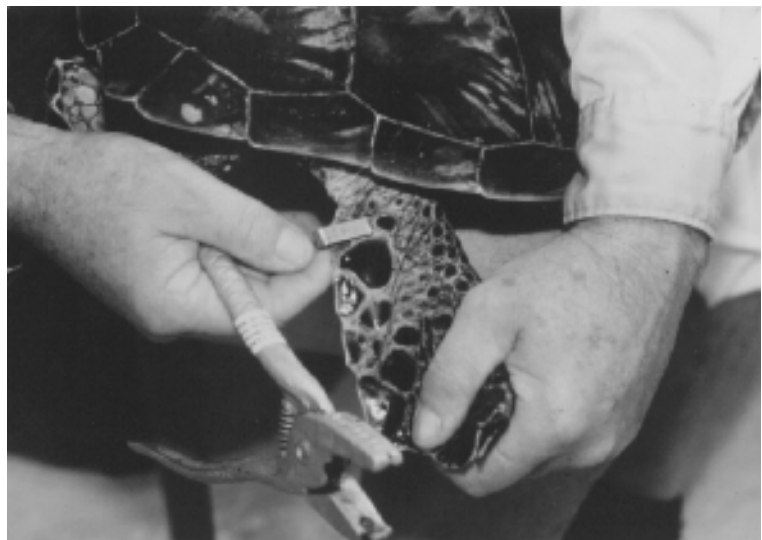
Figure 2. Style 681C Inconel tag attached to the hind flipper of a juvenile green turtle. The tag's piercing site is proximal of and adjacent to the first large scale. This tagging location seems to work well on nesting females. Discomfort to the turtle from applying the tag here is much less than when applied to a front flipper.