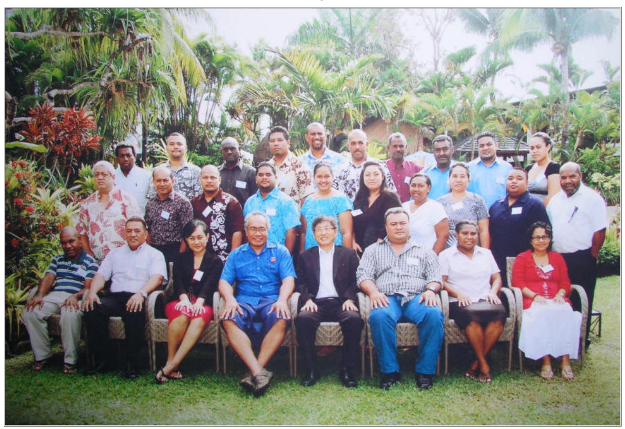
12-16 July 2010 Nadi, Fiji

The United Nations Convention to Combat Desertification Pacific Regional Training of National Focal Points on the UNCCD Performance Review and Assessment System (UNCCD PRAIS) and the Preparation of the 4th National Reports to the UNCCD